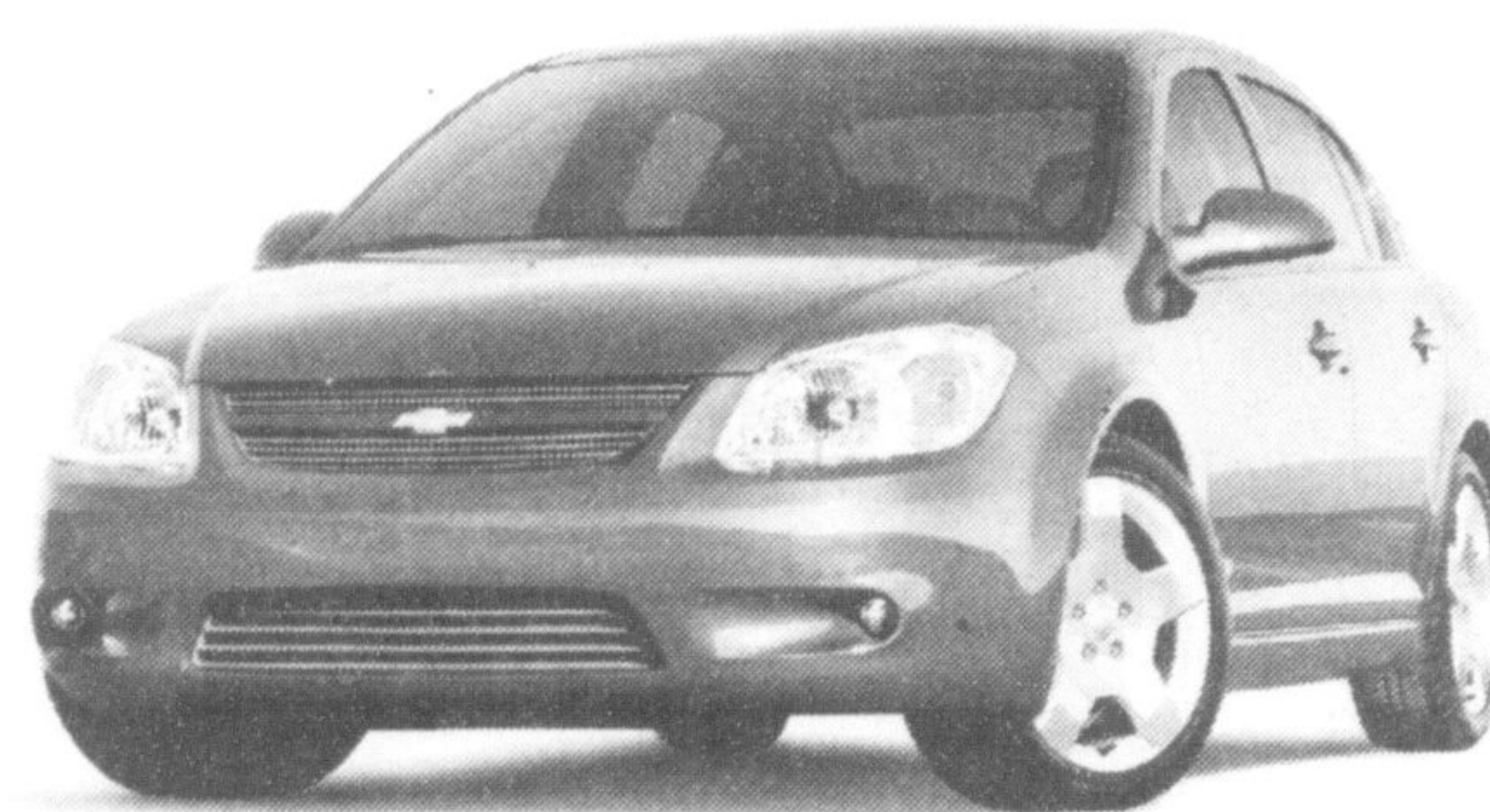
*Cobalt SS model shown.