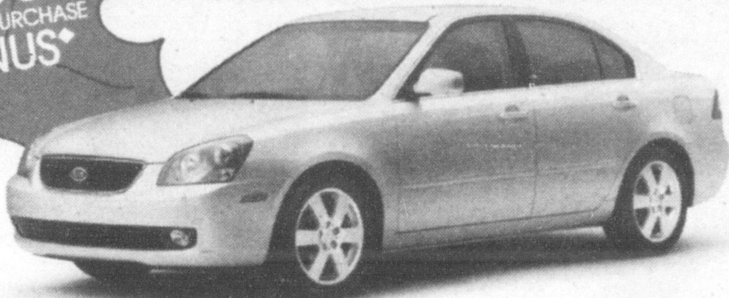
LX model shown* MSRP $21,895*