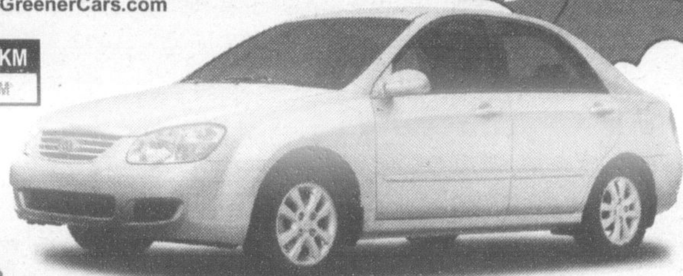
LX model shown* MSRP $15,995*