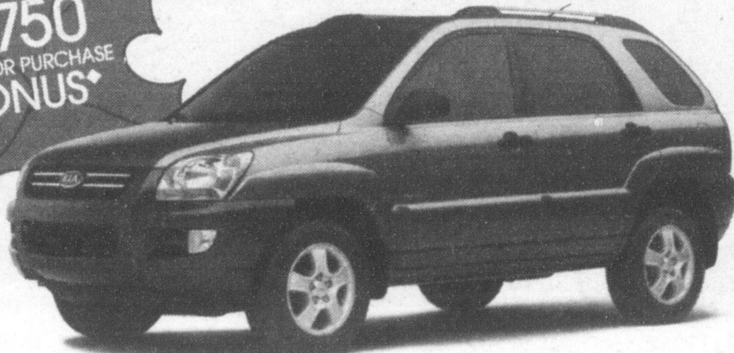
LX-AWD model shown* MSRP $21,695*