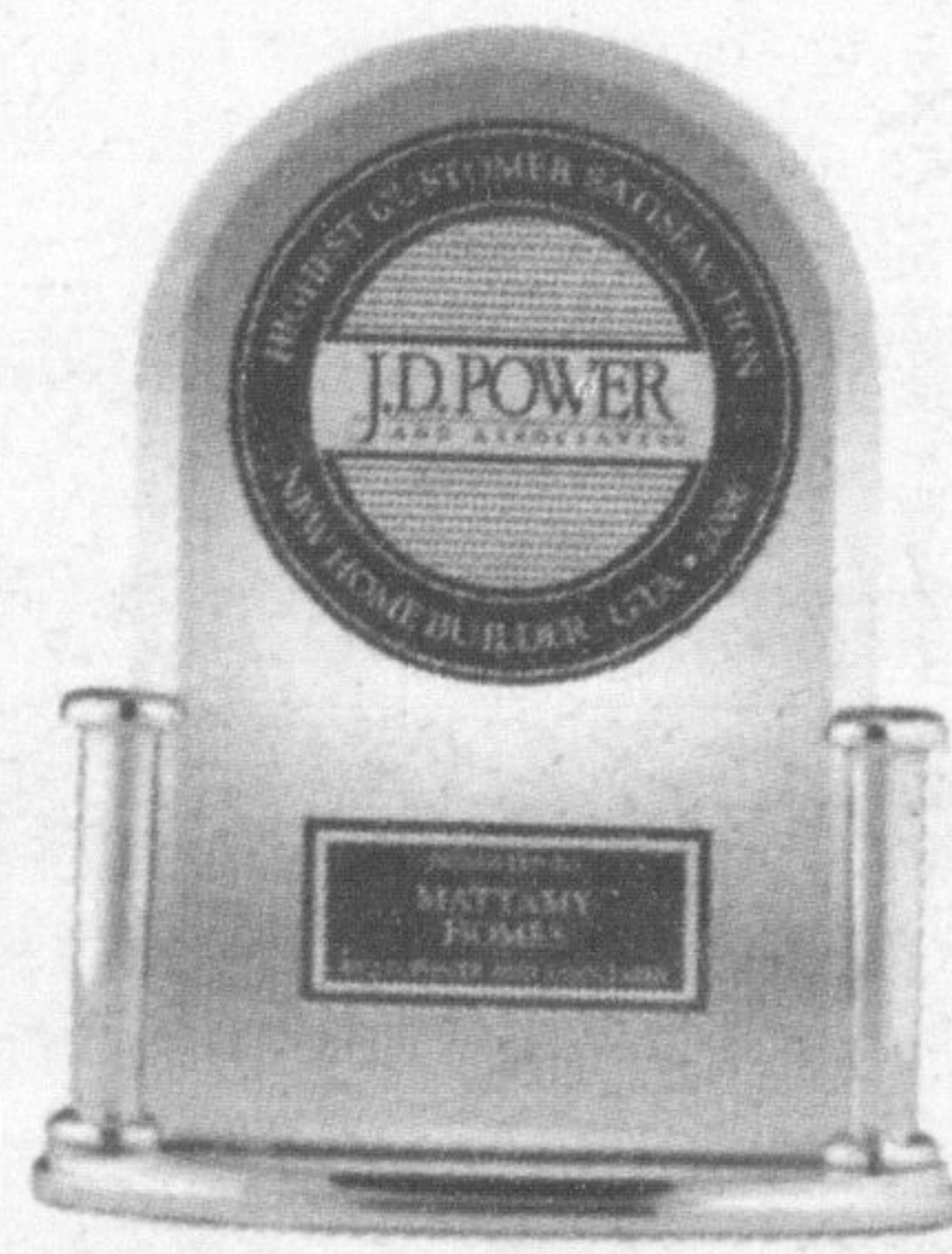
2006 Highest in Customer Satisfaction among New Home Builders in the GTA.