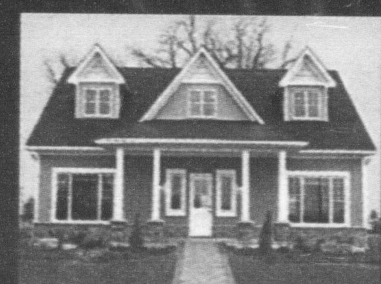
Two Storey Collection

Act now to SAVE THOUSANDS & move in next spring