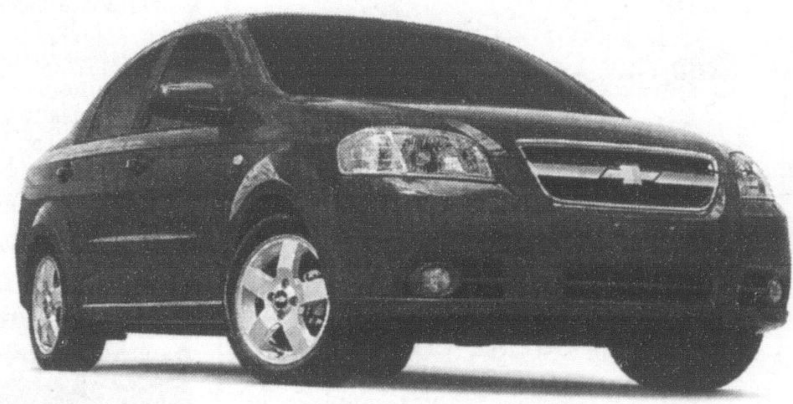
*Aveo LT model shown.