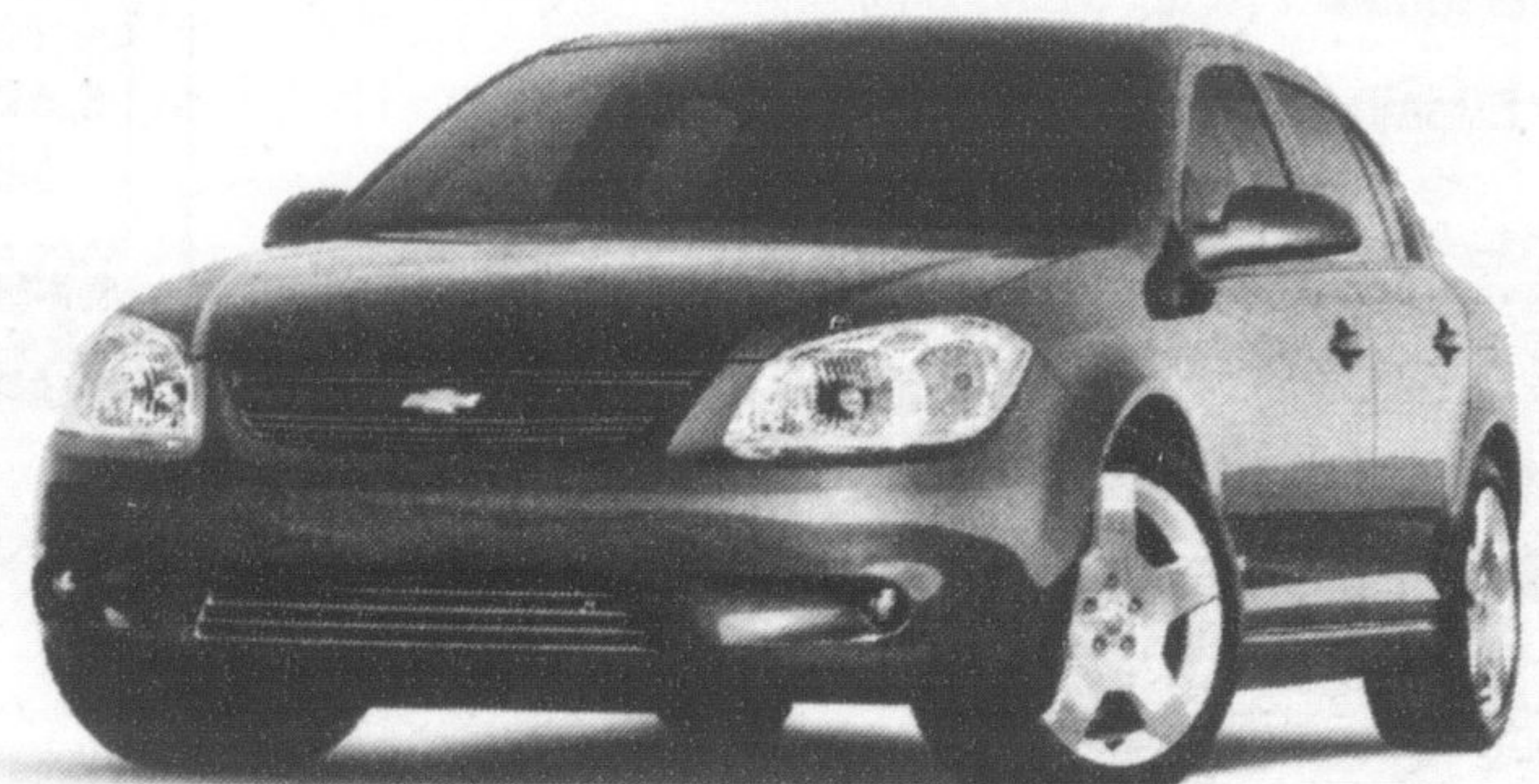
*Cobalt SS model shown.

LEASE THE AVEO LS WITH AIR & AUTO FOR $168 v AT 1.5% APR OR 0% FINANCING FOR 60 MONTHS 1 PER MONTH/48 MONTHS $1,560 DOWN PAYMENT $0 SECURITY DEPOSIT