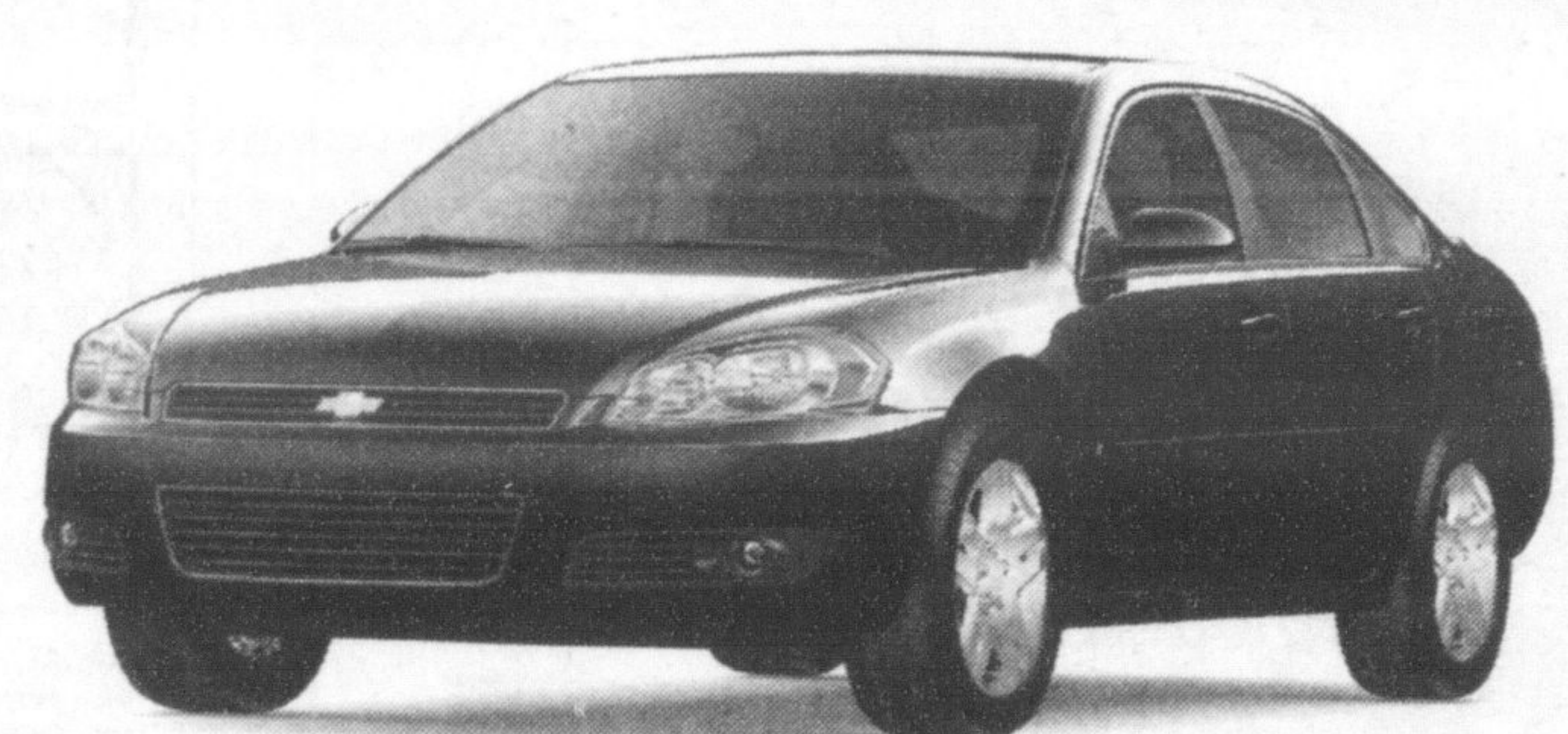
*Impala LTZ model shown.

LEASE $219 v AT 2.4% APR OR 0% FINANCING FOR 60 MONTHS 1 PER MONTH/48 MONTHS $2,375 DOWN PAYMENT $0 SECURITY DEPOSIT