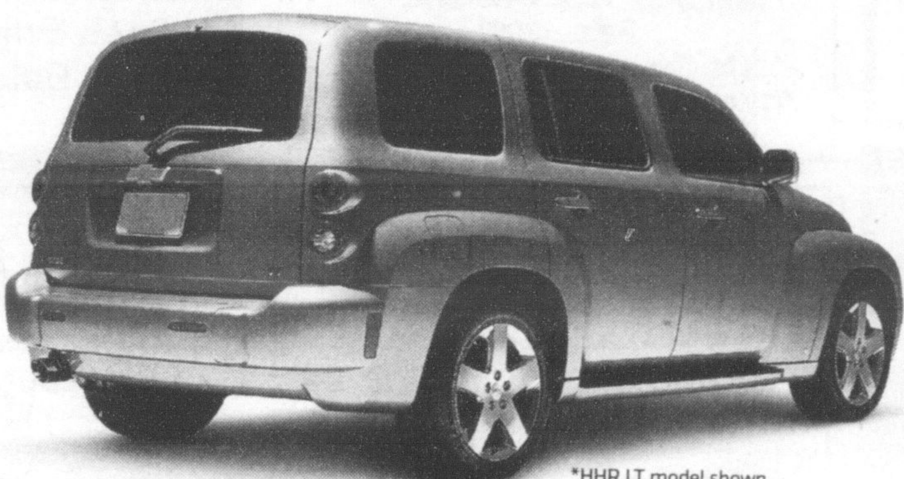
*HHR LT model shown.