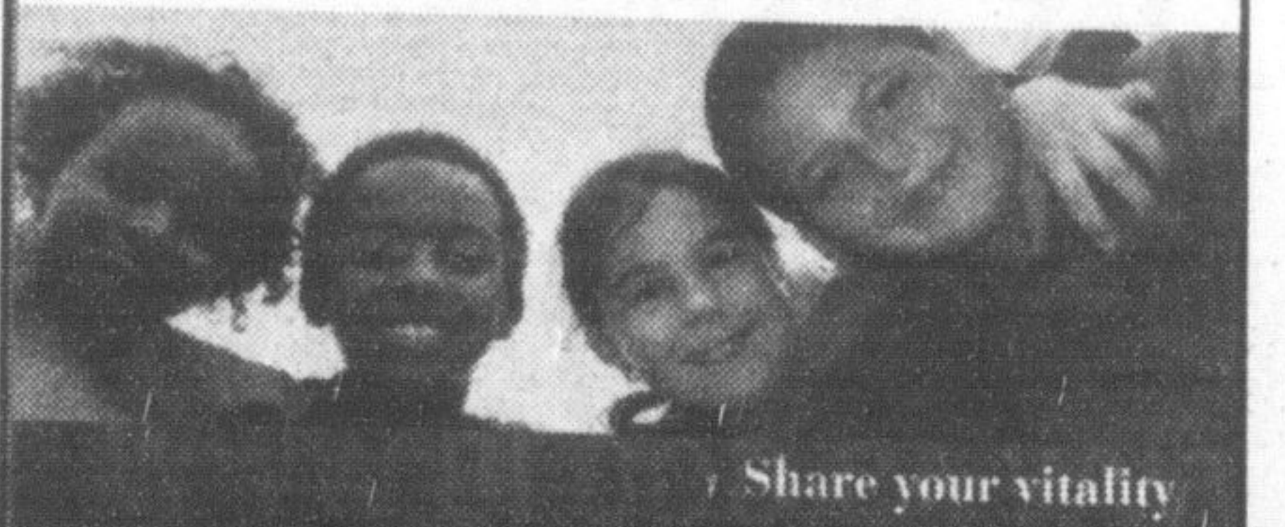
Share your vitality

Call 1 888 2 DONATE for more information or to book an appointment. www.blood.ca Canadian Blood Services it's in you to give