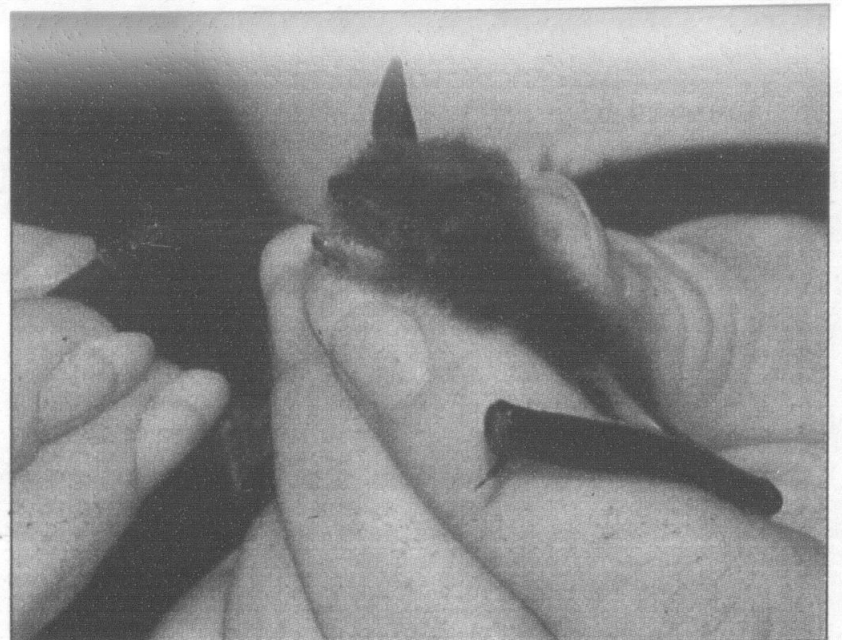
GETTING BATTY: Bats like this one will take centre stage at Mountsberg Saturday evening.