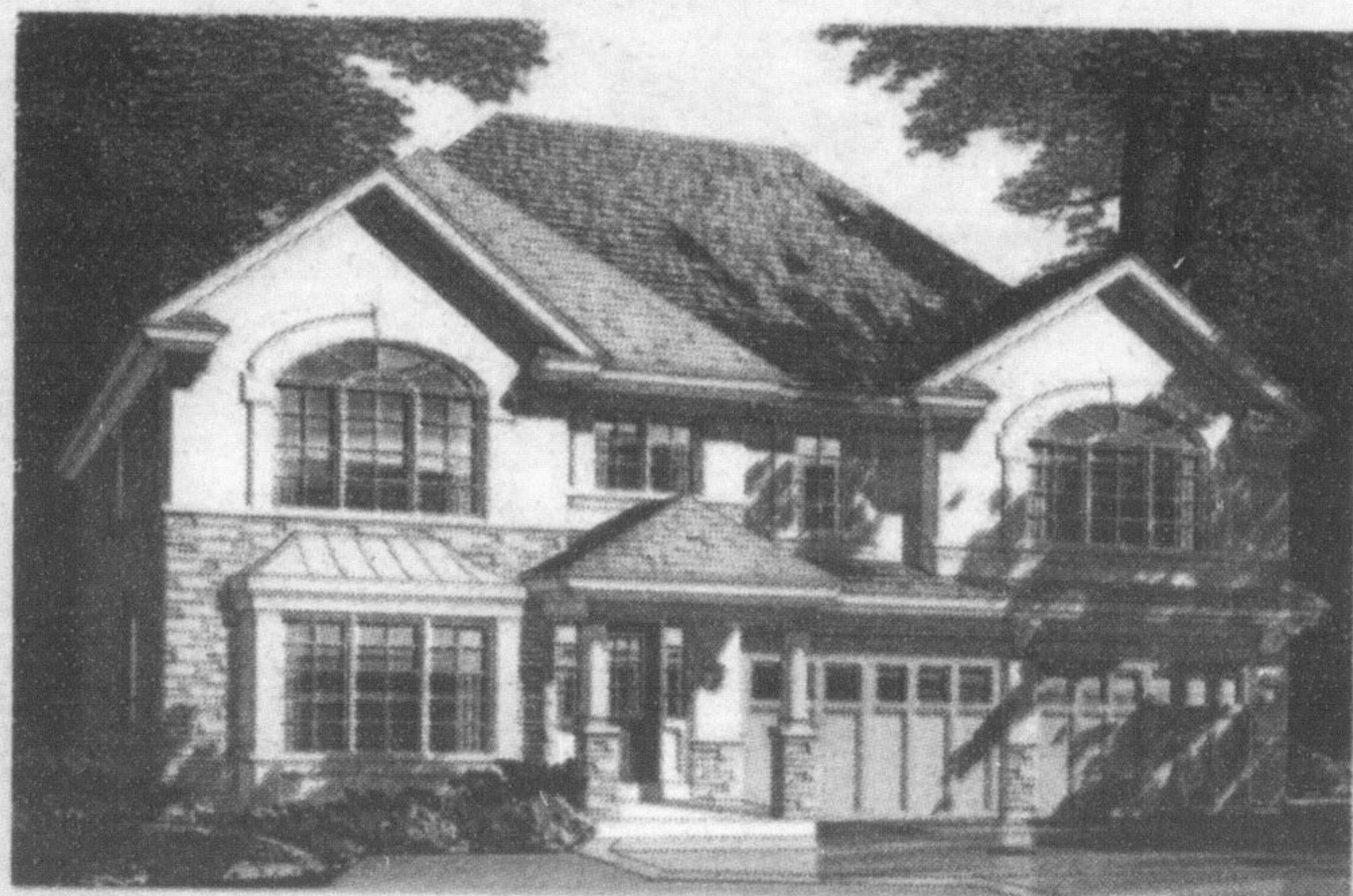
46' WideLot™, The Glenwood II 'D', 2,572 Sq.Ft., $419,990