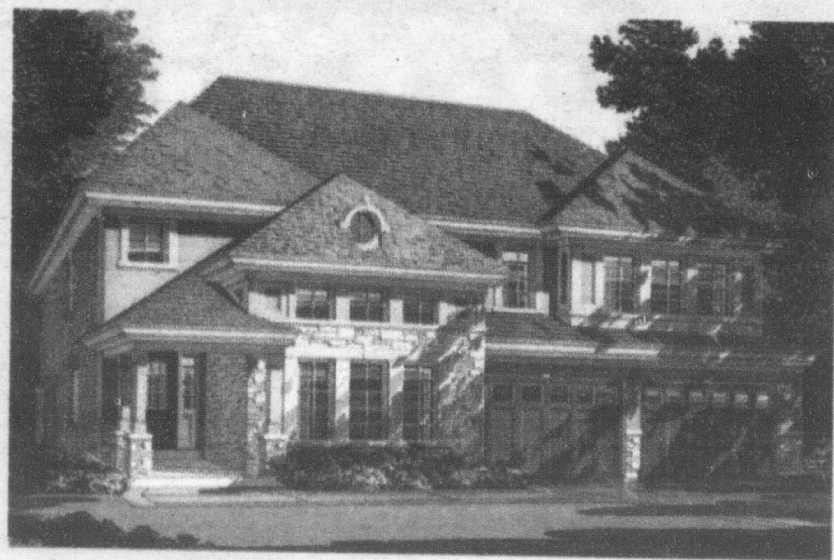
46' WideLot, The Melville II 'C', 2,753 Sq.Ft., $437,990