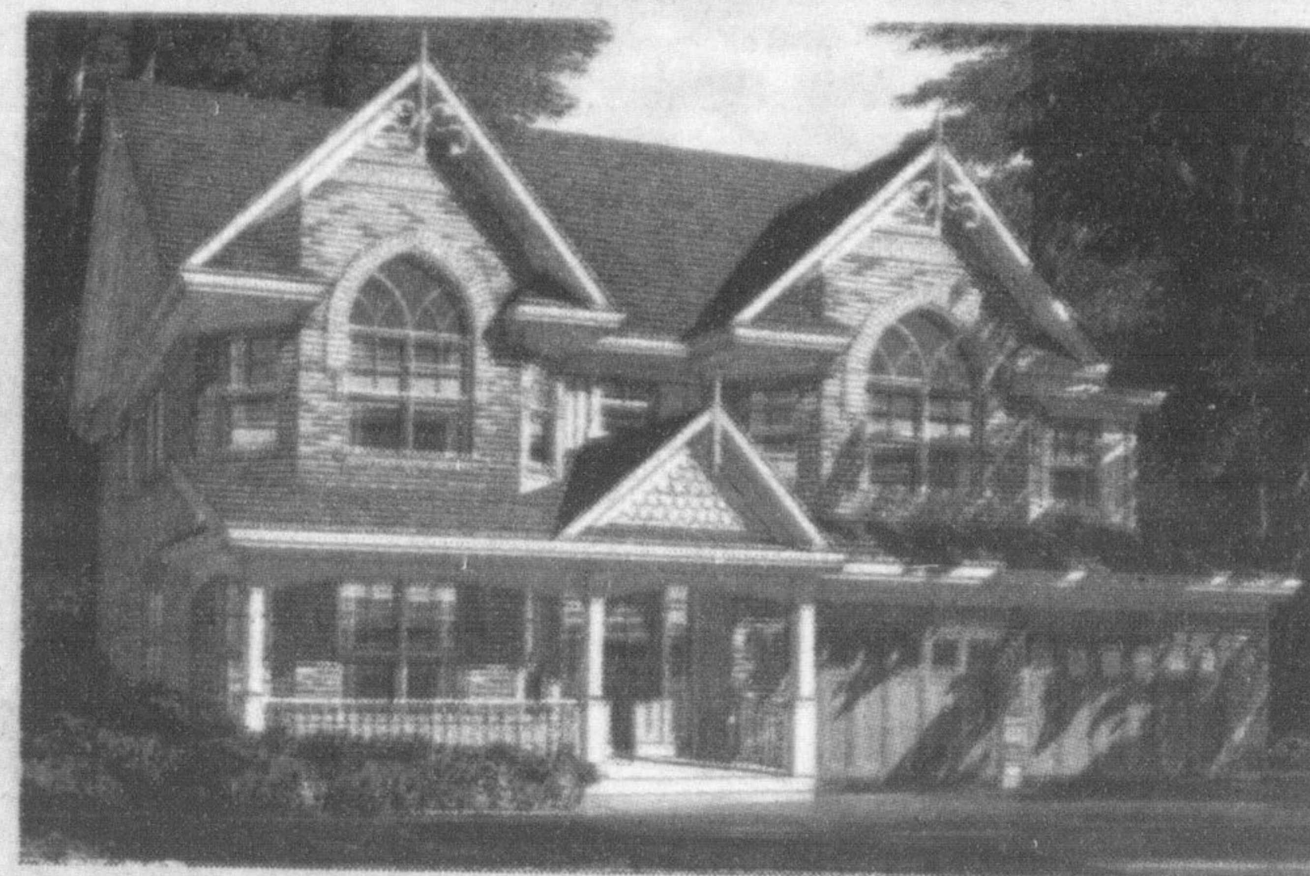
46' WideLot™, The Huxley II 'D', 2,476 Sq.Ft., $428,990