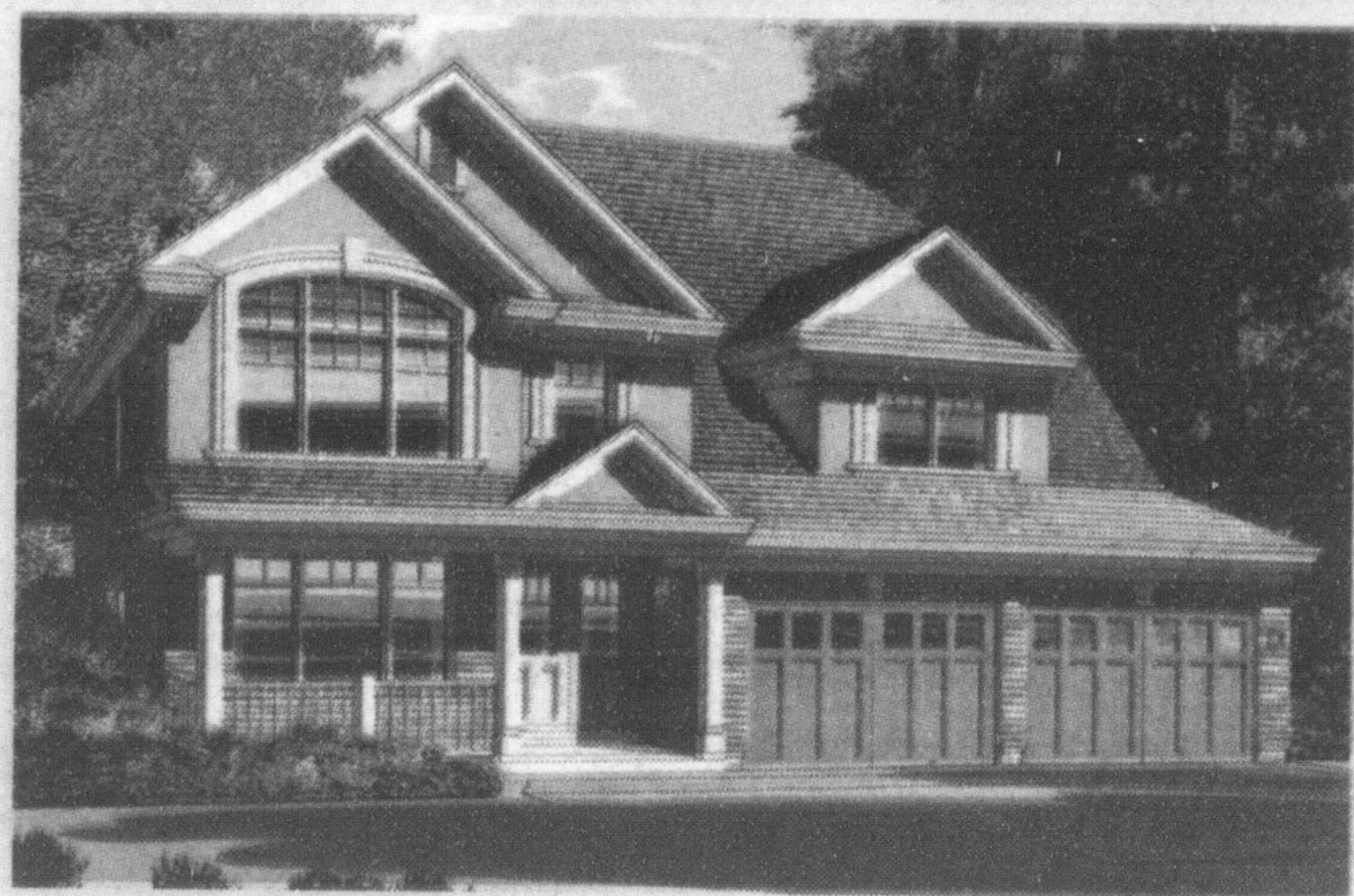
46' WideLot™, The Albion Bay II 'D', 2,172 Sq.Ft., $407,990