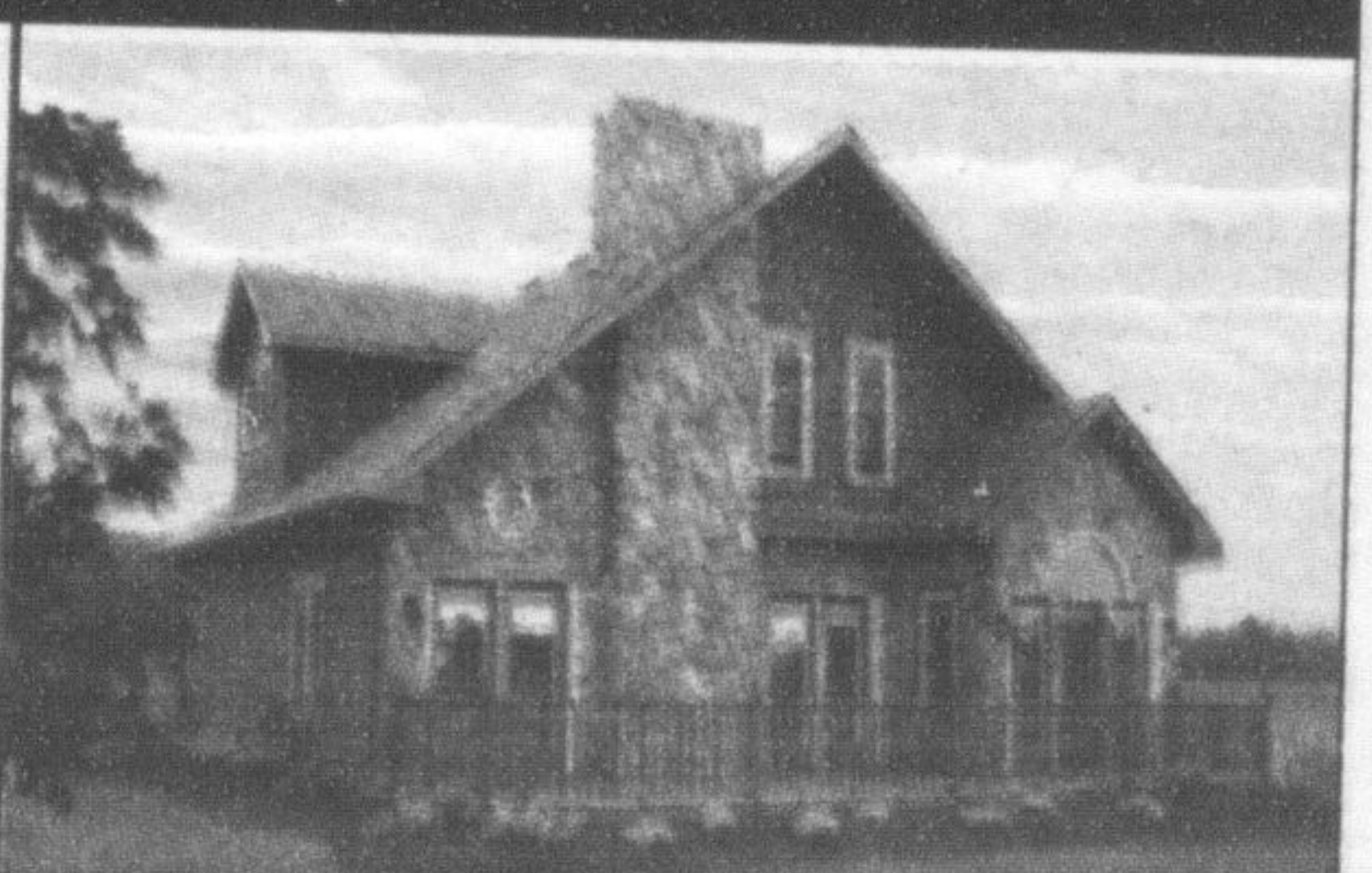
The Summerside - 1,653 sq. ft.

Q qualityhomes.ca CUSTOM BUILT FOR YOUR LOT