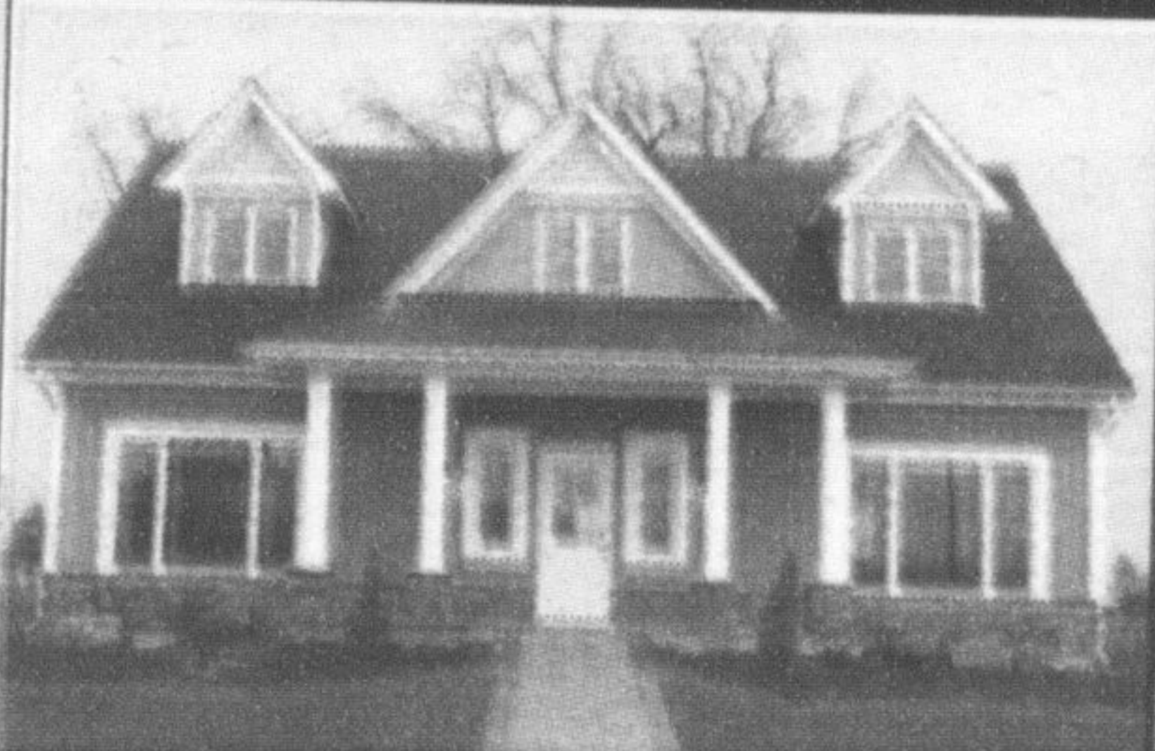
The Covington - 2,100 sq. ft.