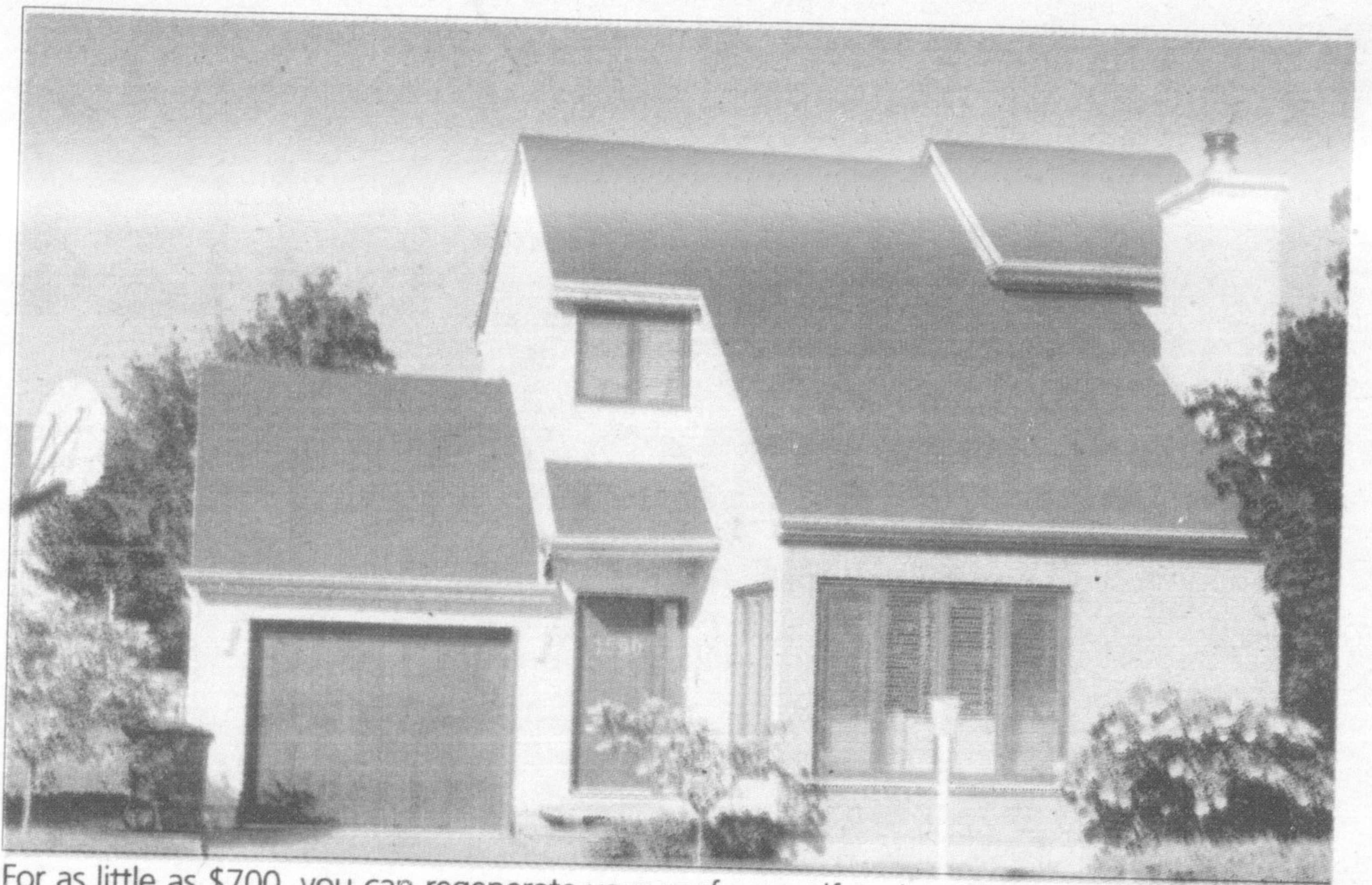
For as little as $700, you can regenerate your roof yourself and avoid the costly replacement of aging shingles and membranes.

A Canadian company, Techni-Seal, has created a simple, economical and environmentally friendly alternative to replacing roof shingles. The breakthrough product is called