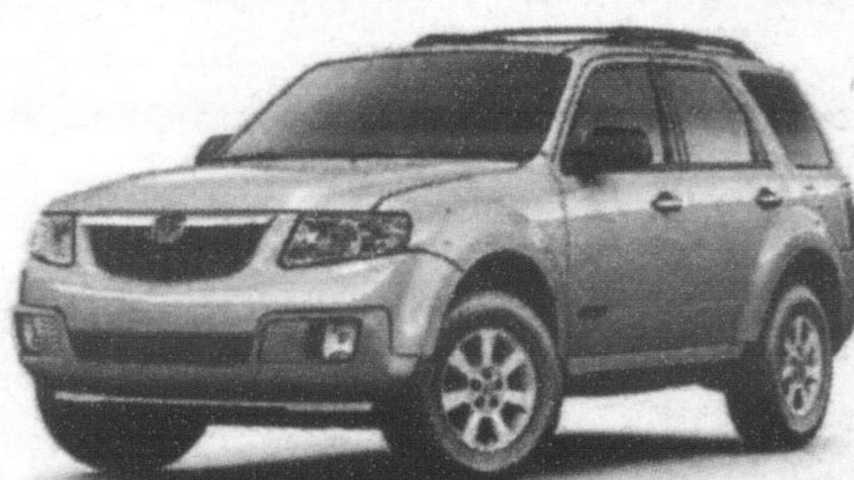
GT-V6 model shown

2008 MAZDA TRIBUTE GX-I4 WITH AUTOMATIC TRANSMISSION