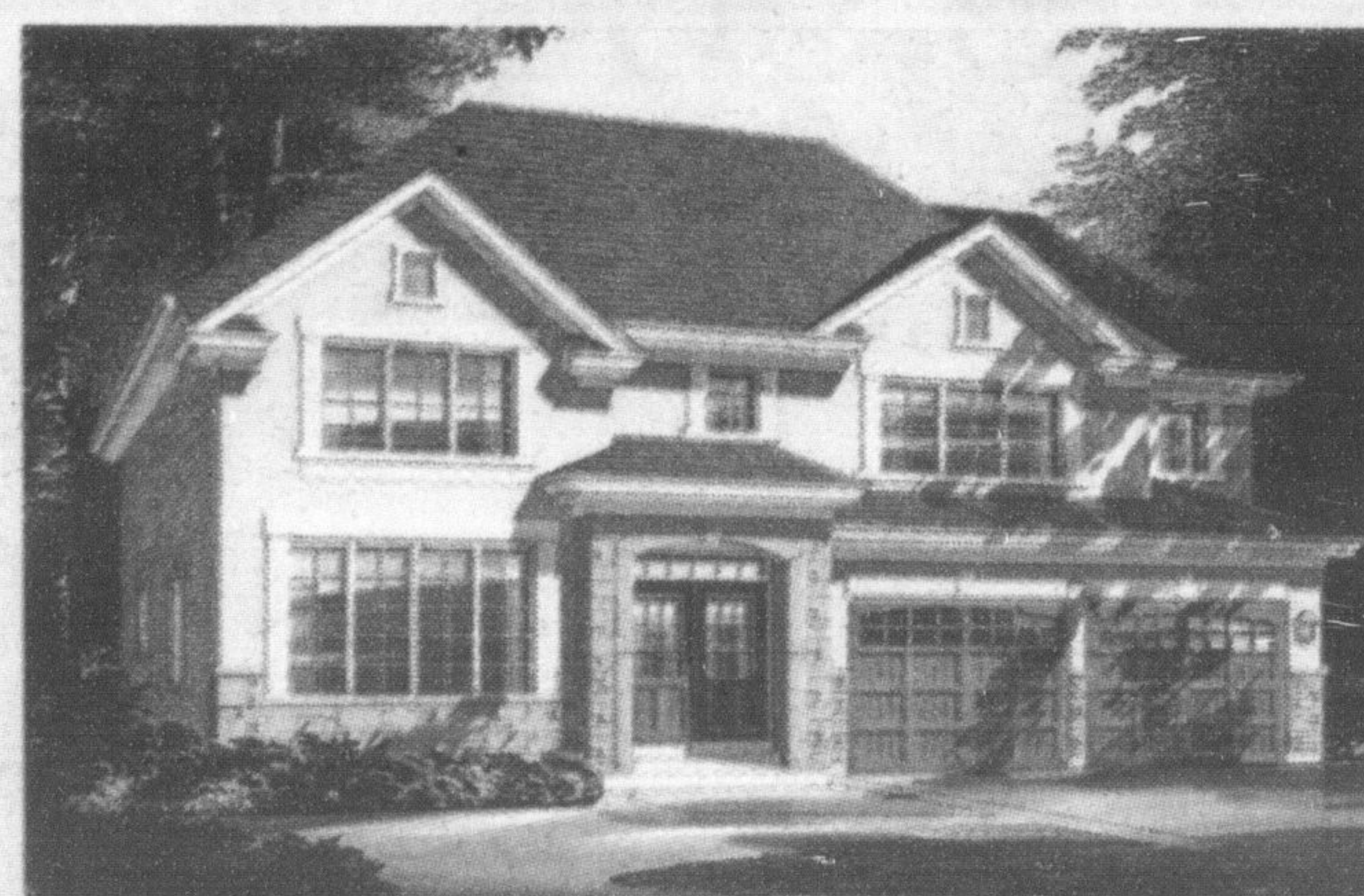
50' Home, The Alston 'C', 2,670 Sq.Ft., $466,990