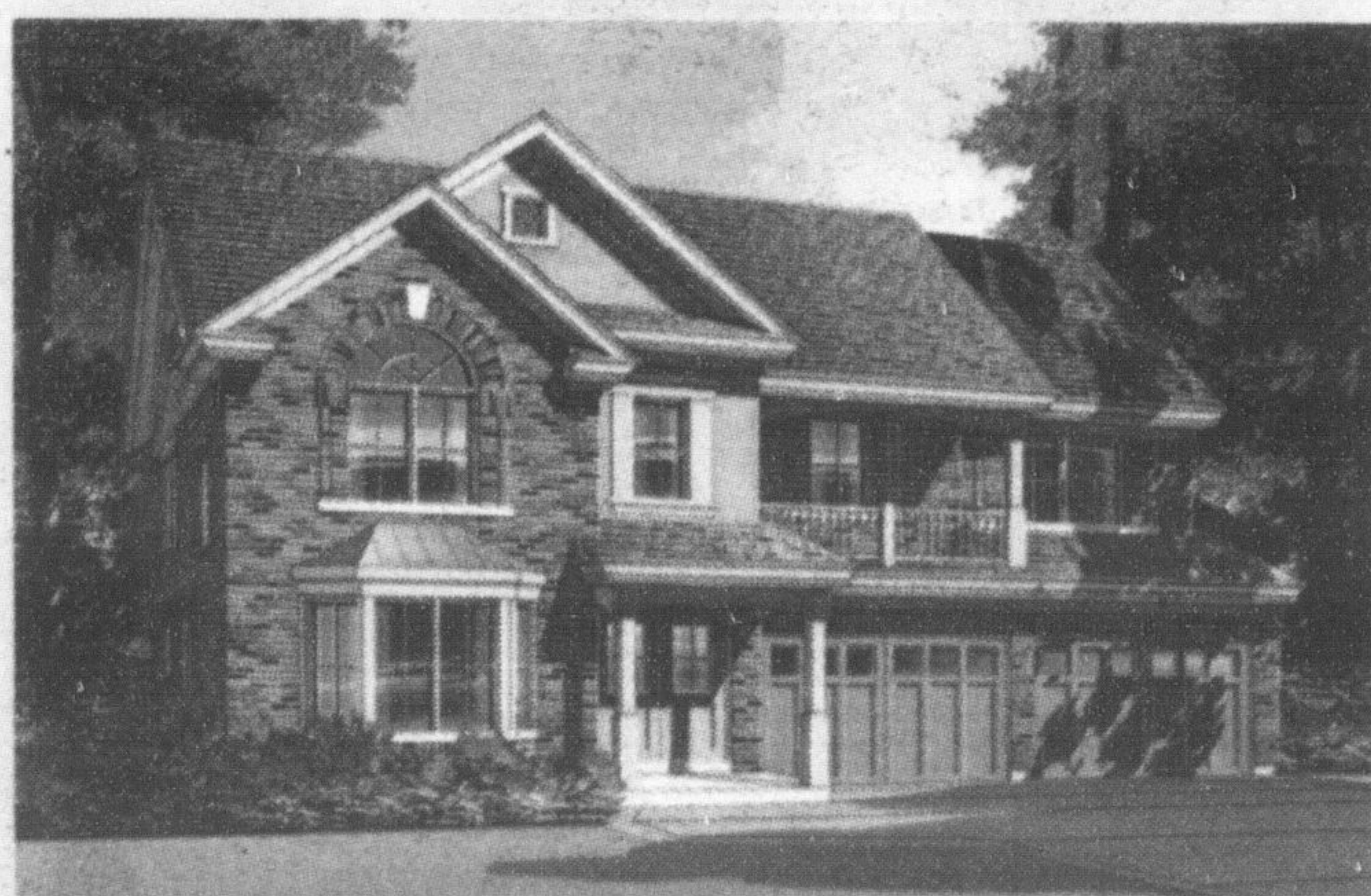
46' WideLot™, The Sutton Hills 'D', 2,921 Sq.Ft., $447,990