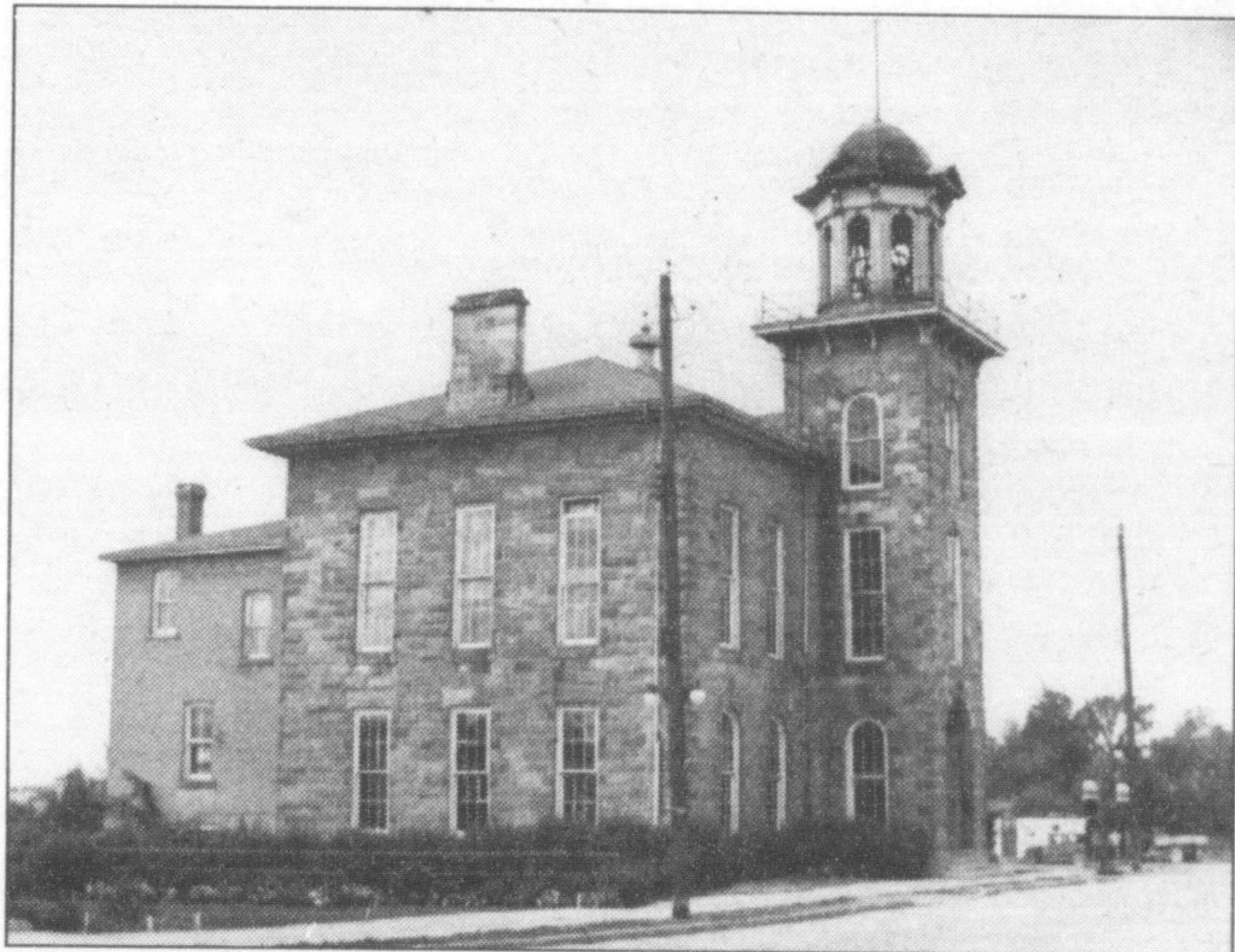
Former Town Hall on Main Street.

5. A new brick addition to Milton's first Town Hall opened in 1894, expanding the stage area.