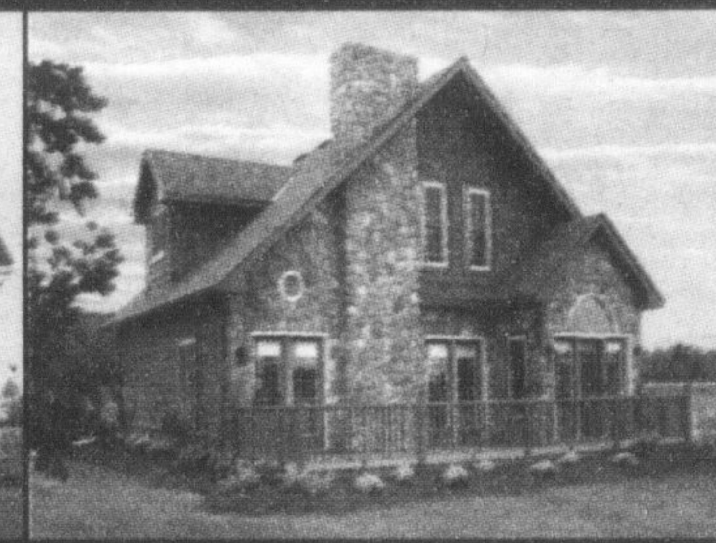
The Summerside - 1,653 sq. ft.

Q qualityhomes.ca CUSTOM BUILT FOR YOUR LOT