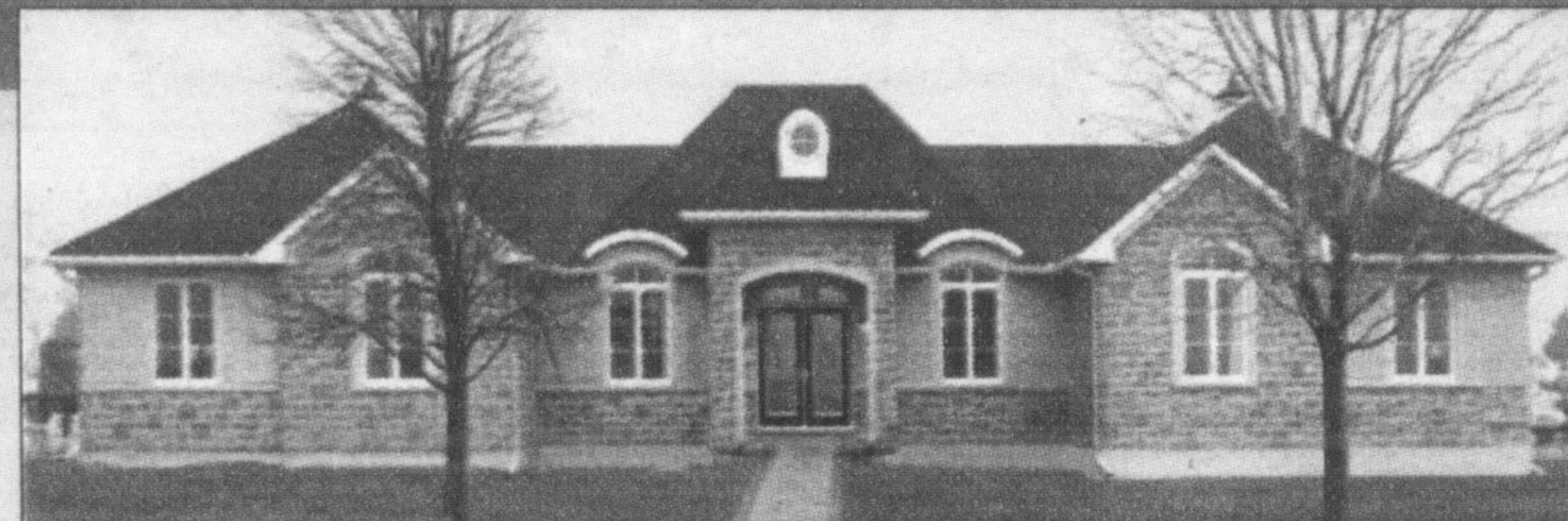
The Graystone - 2,635 sq. ft.

Towards all custom options for your new home. Limited time only!*