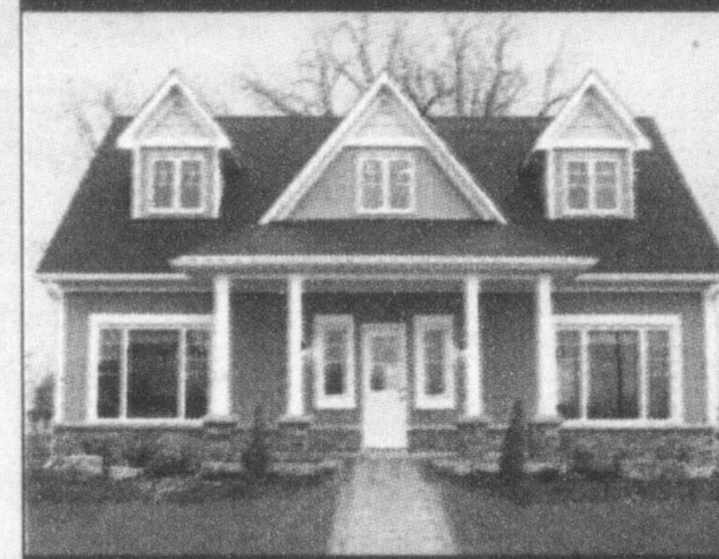
The Covington - 2,100 sq. ft.