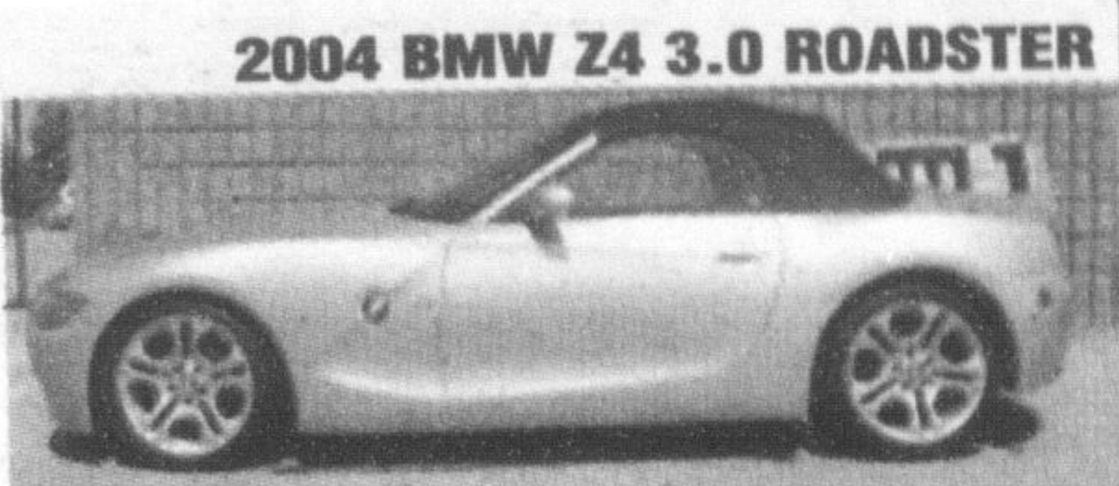
2004 BMW Z4 3.0 ROADSTER

THIS WEEK'S SPECIAL! JUST ARRIVED! Stk T26391