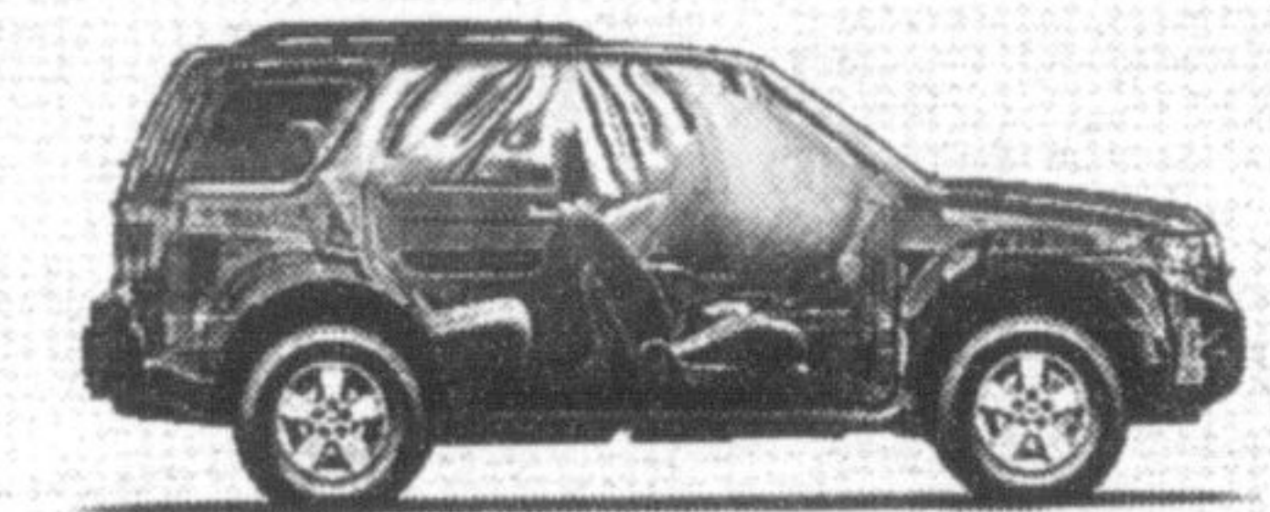
All 6 airbags now standard. The dual front airbags in our Personal Safety System* are now joined by front-seat side airbags and the side-curtain airbags of our Safety Canopy™ System.