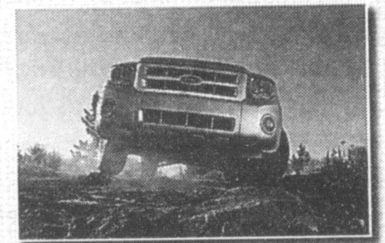
Escape's optional Intelligent 4WD System is always on and always working. It automatically monitors traction and adjusts torque distribution as needed to give you maximum grip.