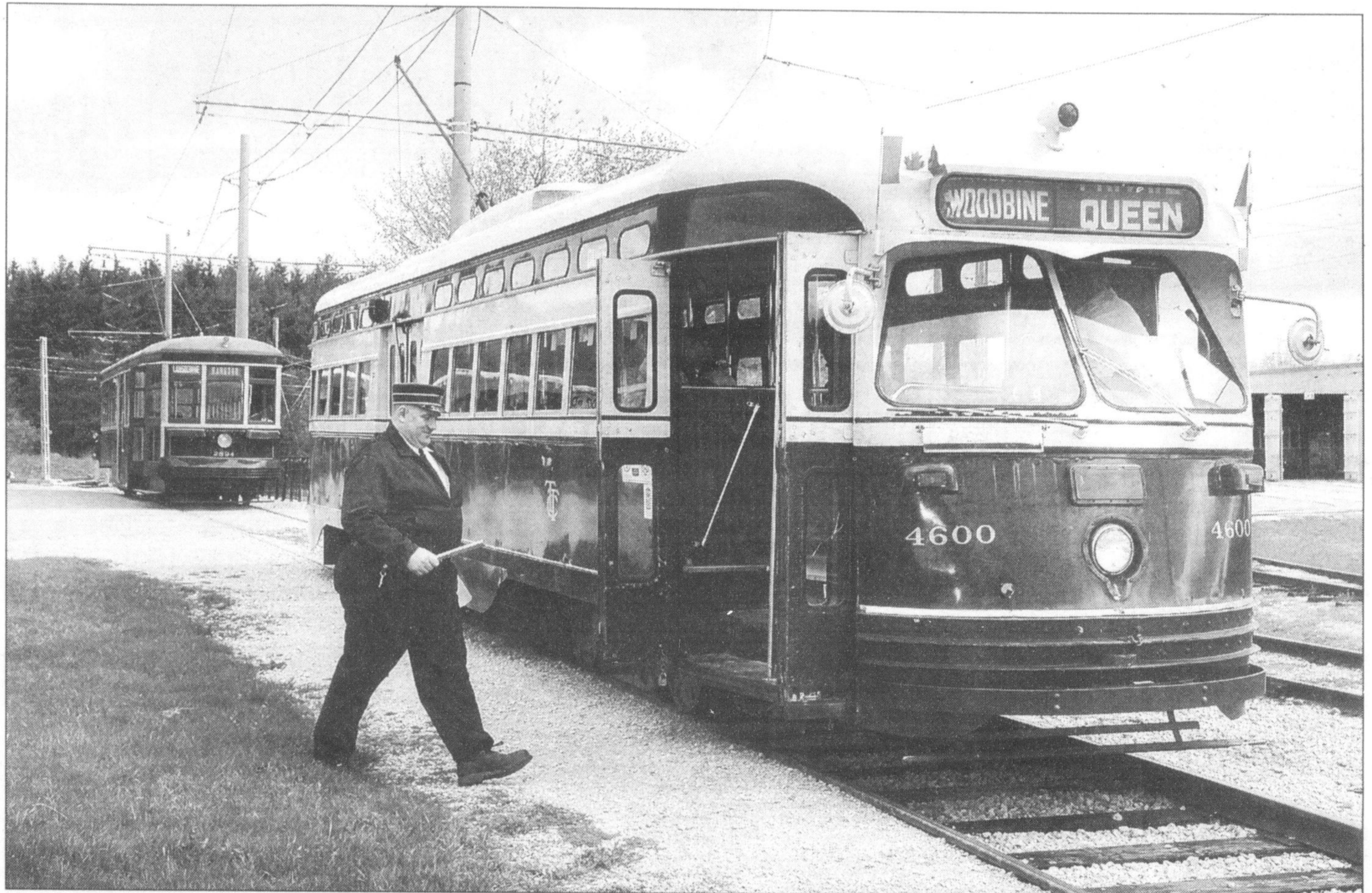
Halton County Radial Railway Museum operators are expecting bigger crowds at the Guelph Line tourist attraction this year due to increased promotion.

The HCRR museum, with an annual attendance of between 11,000 and 15,000 people, was established in 1953 (open to the