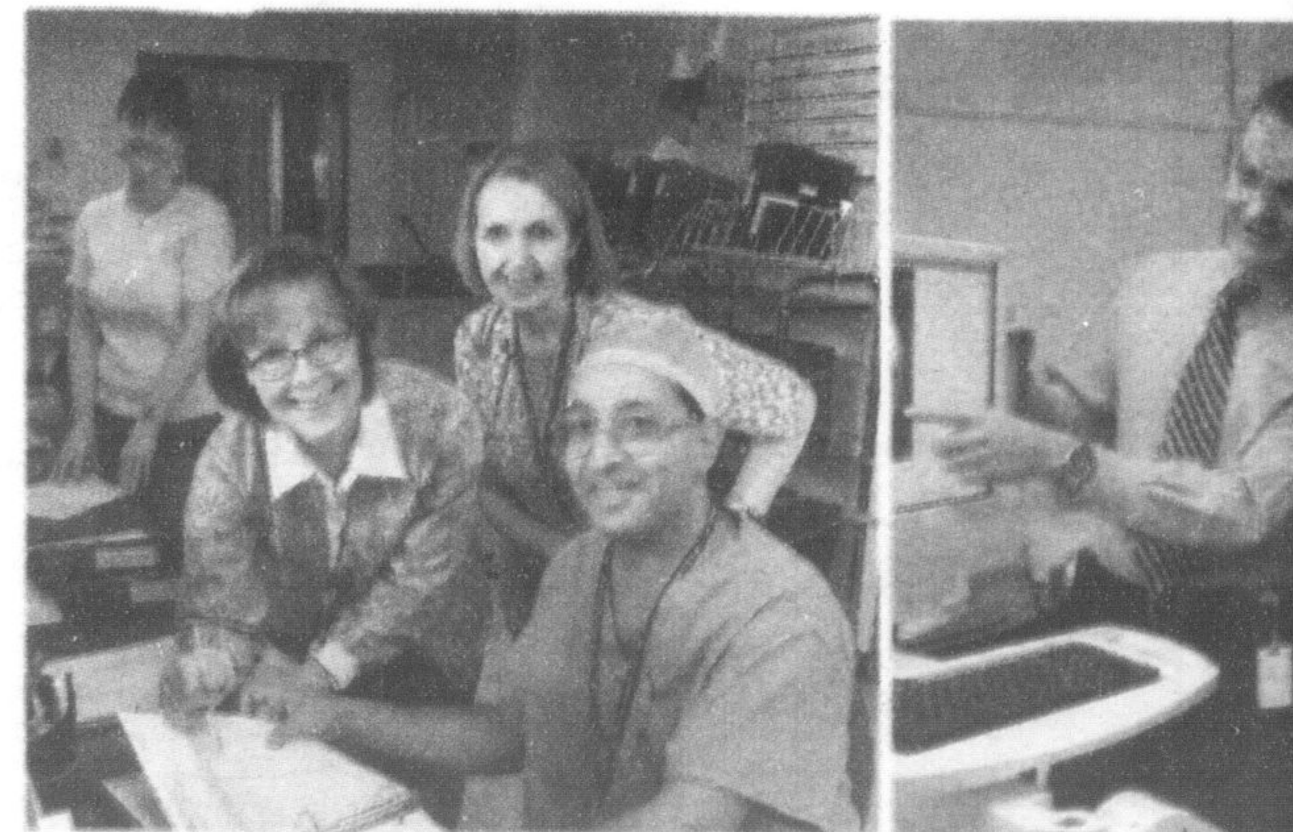
Doctor profiles provided by the PH

"I would like to thank the staff and doctors at Milton sure everything is alright. I really hope our hospital No community can survive without one!"