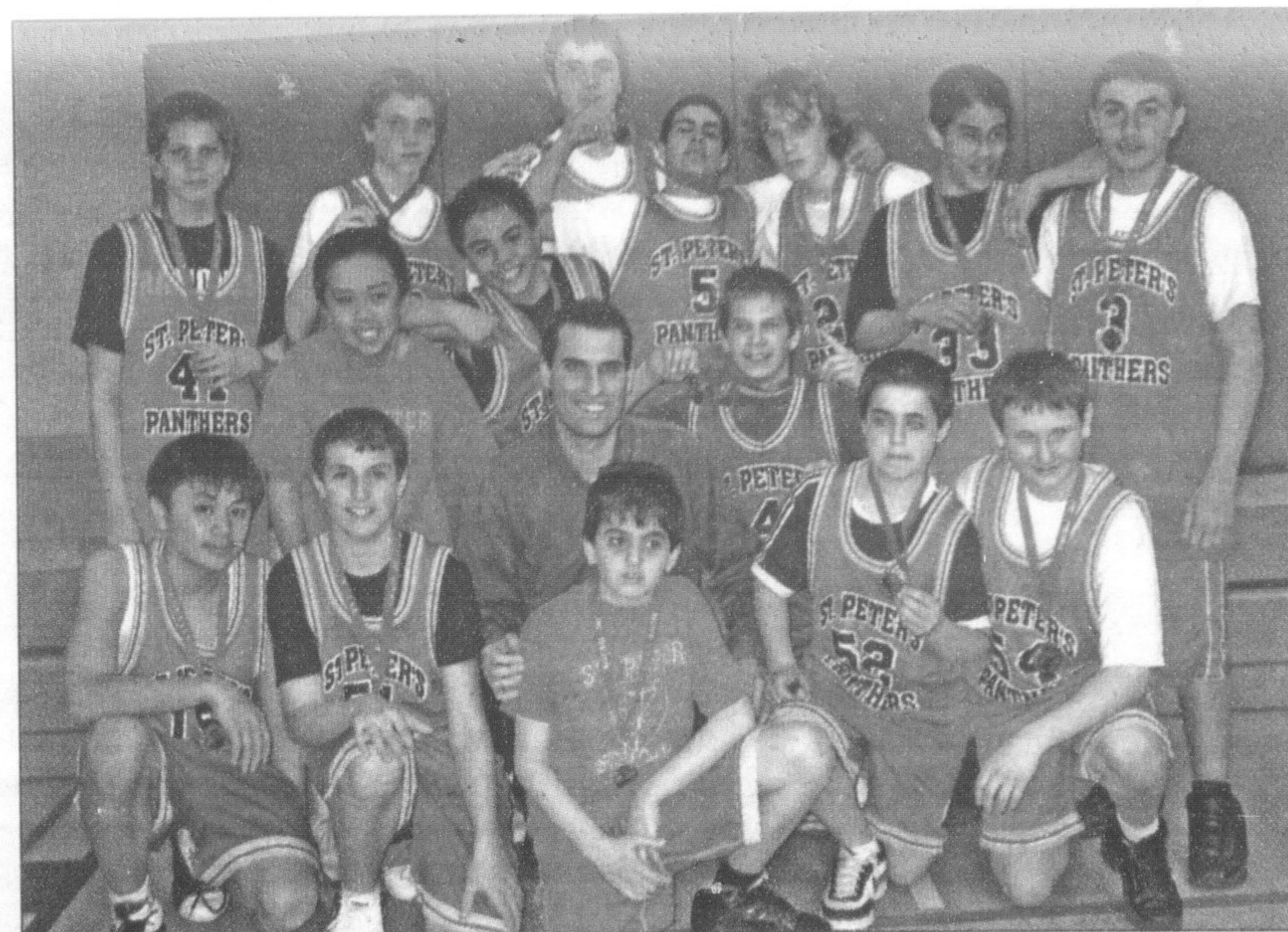
CHAMPIONS: St. Peter's Panthers celebrate their title victory over Guardian Angels.

Herbal Magic WEIGHT LOSS & NUTRITION CENTRES