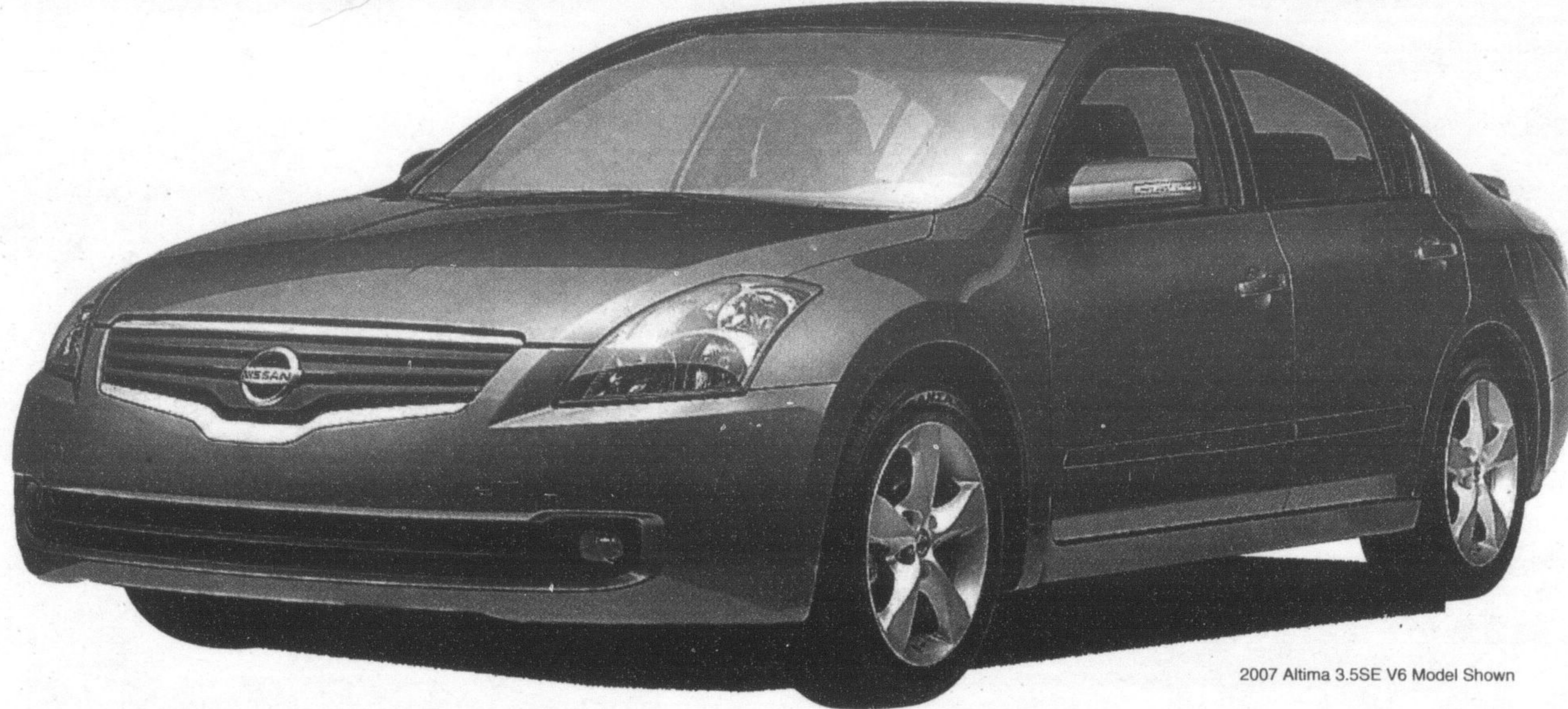
2007 Altima 3.5SE V6 Model Shown