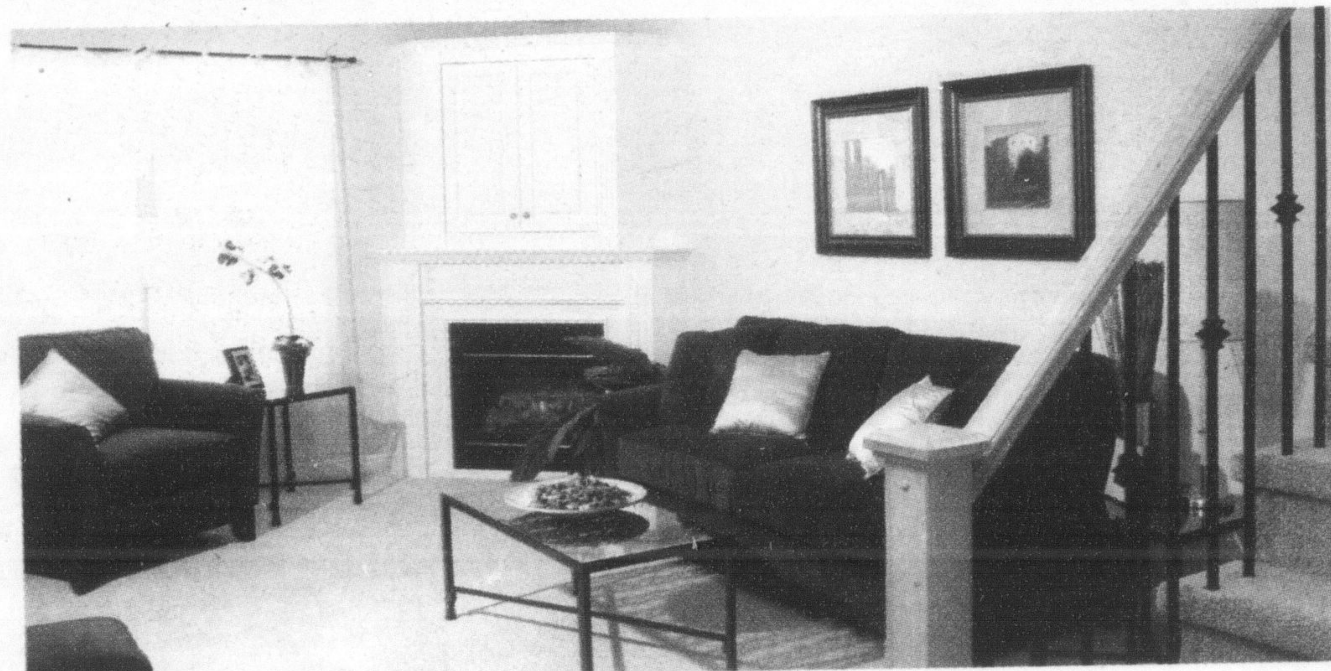
A bright and sunny living room is complemented by a beautiful wrought iron staircase.