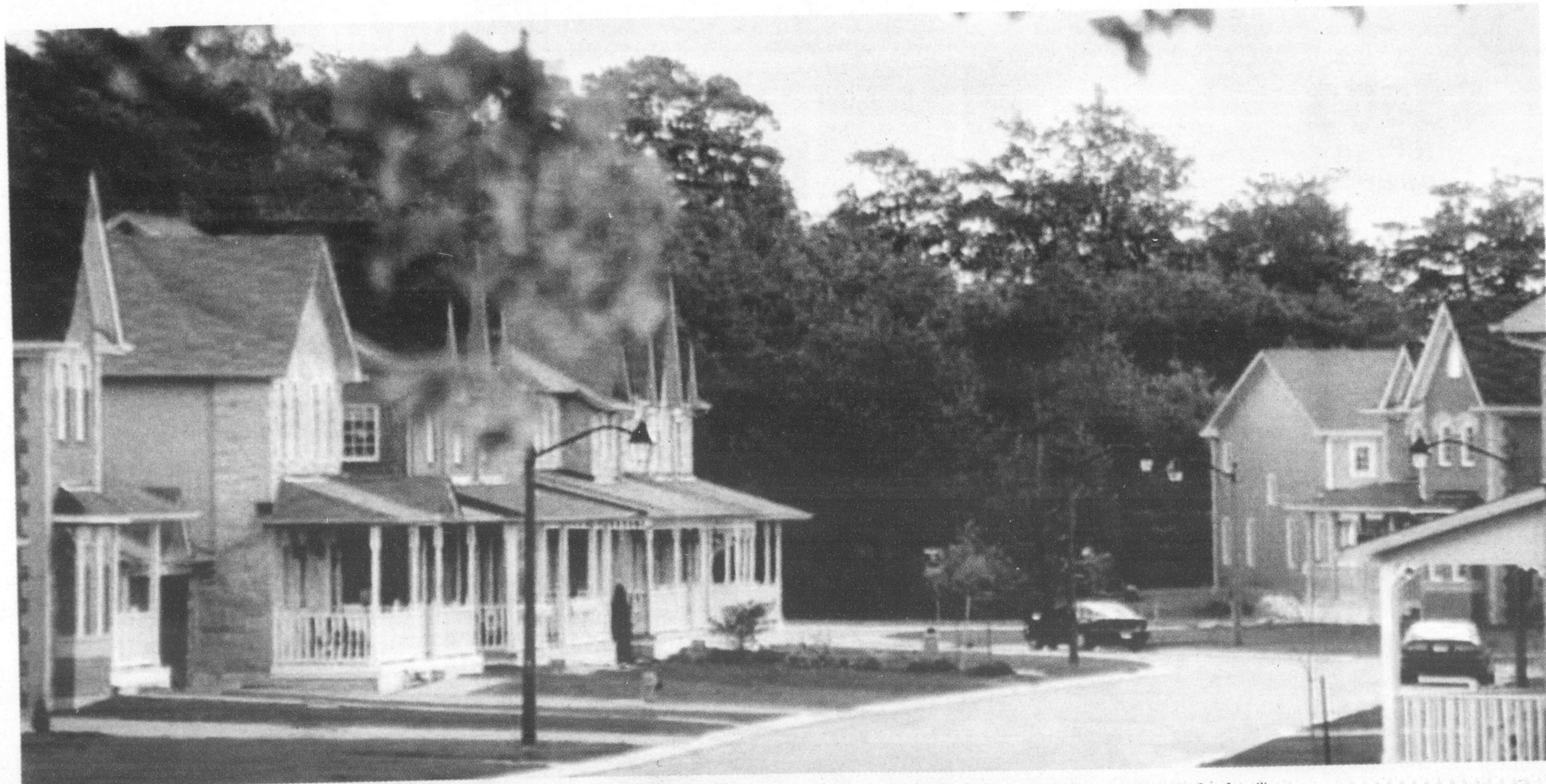
The beautiful streetscape at Ashton's Ridge Homes' Rockwood Ridge. Fabulous views and lots of green space make this a wonderful community for families.