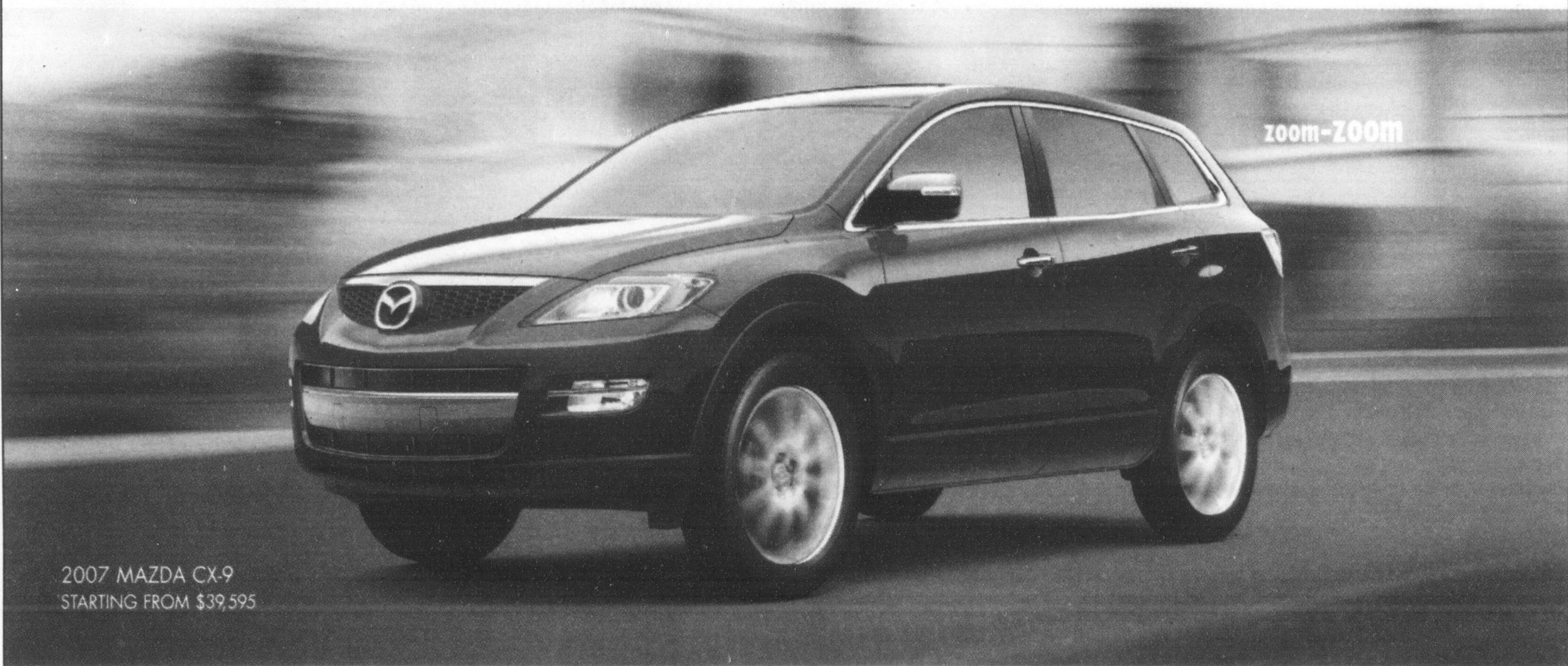
2007 MAZDA CX-9 STARTING FROM $39,595