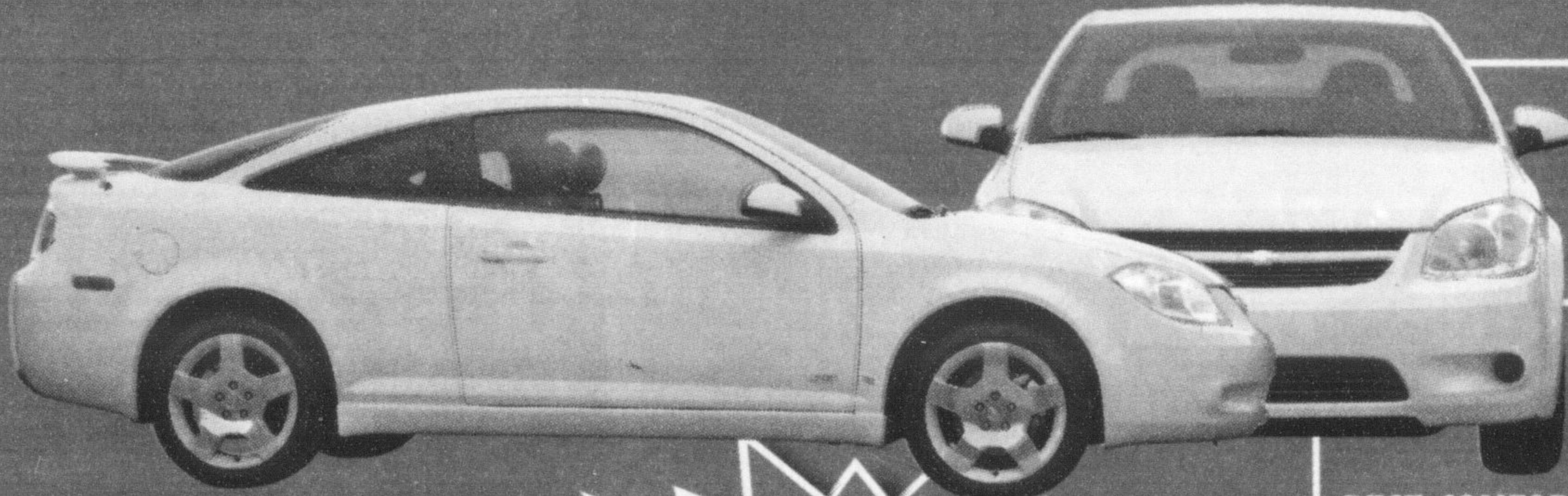
Model not exactly as shown