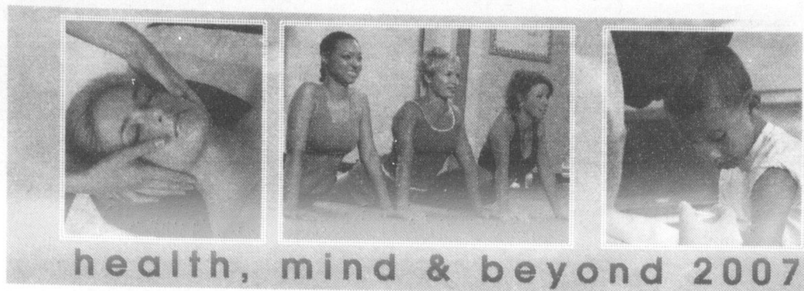
health, mind & beyond 2007