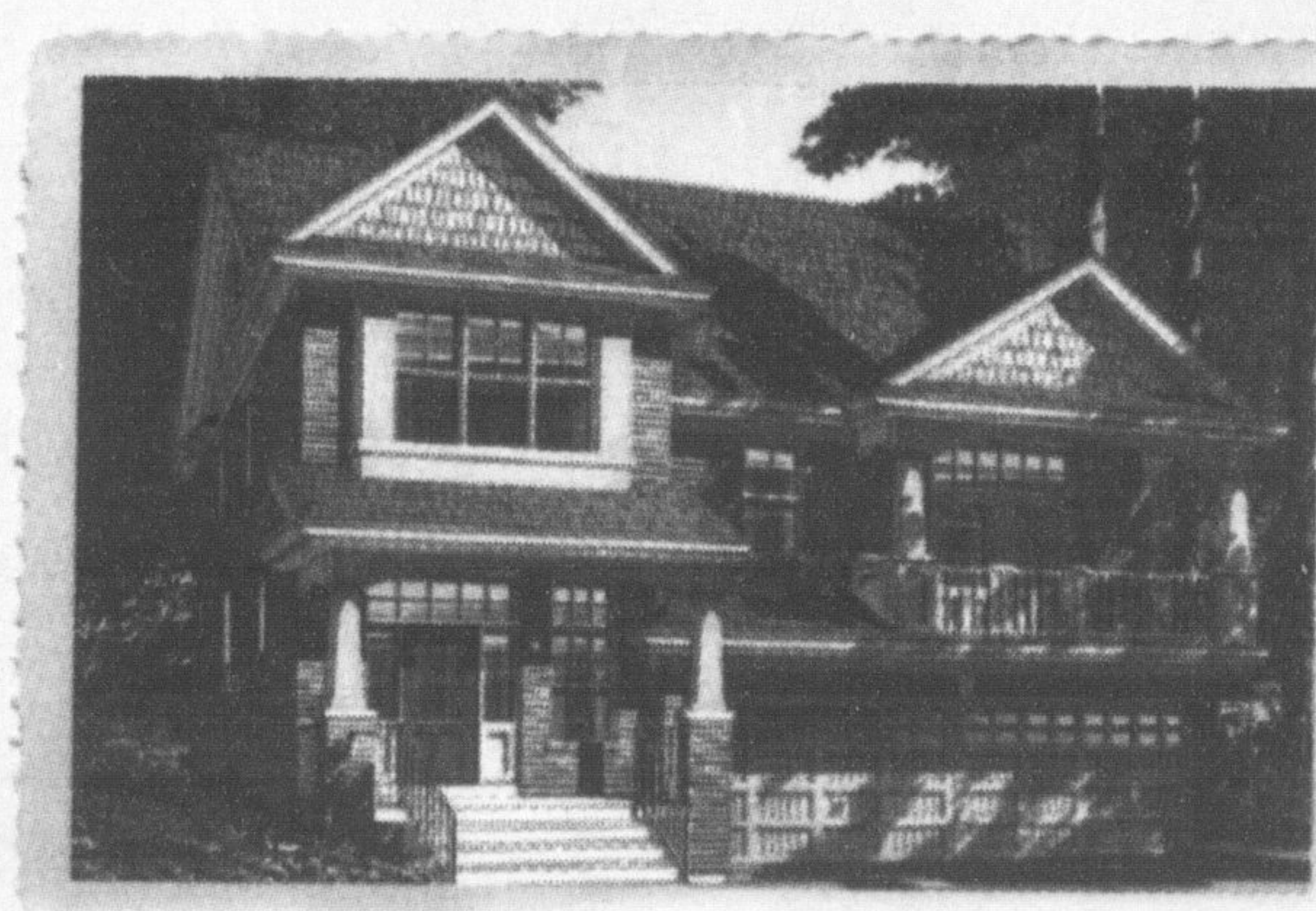
36' WideLot™, The Summerfield 'C', 2,121 Sq.Ft., $360,990