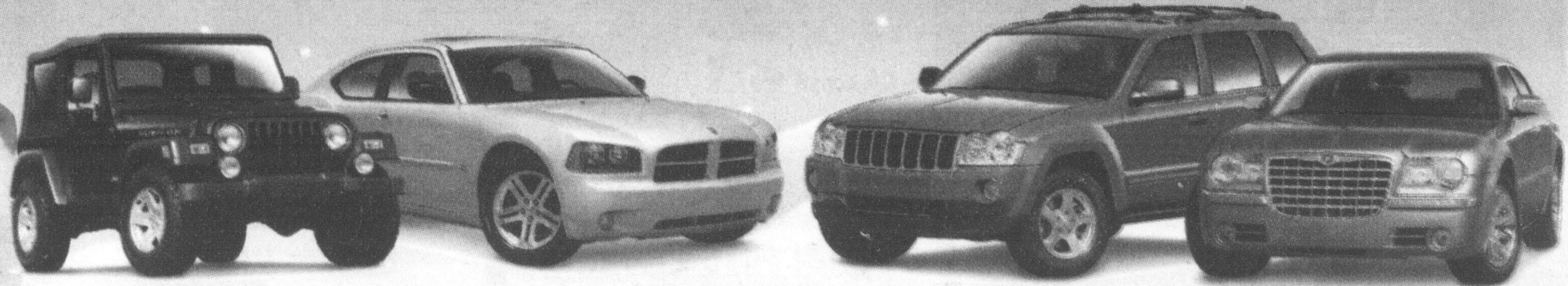
Available 2006 Models only, see dealer for details.