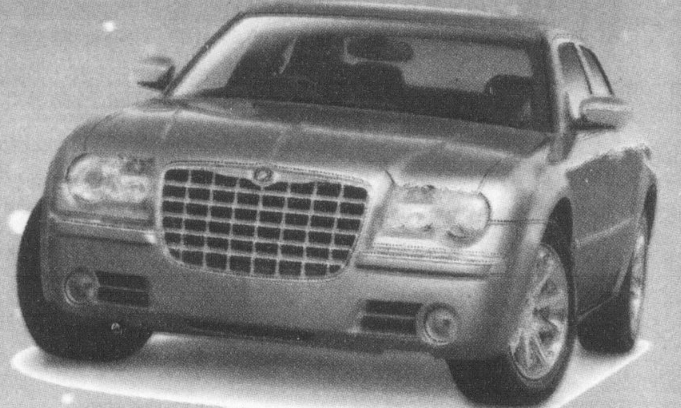
Available 2006 Models only, see dealer for details.