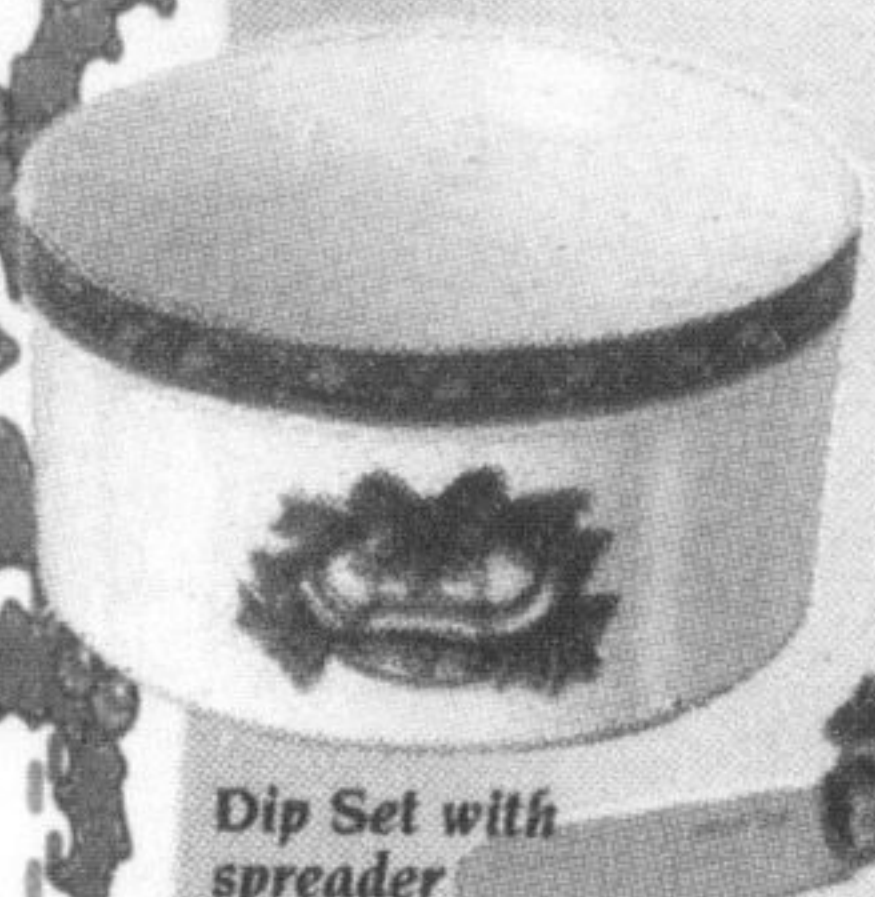
Dip Set with spreader $12.95

But a miniature sleigh, and eight tiny reindeer, With a little old driver, so lively and quick, I knew in a moment it must be St. Nick. More rapid than eagles his coursers they came, And he whistled, and shouted, and called them by name;