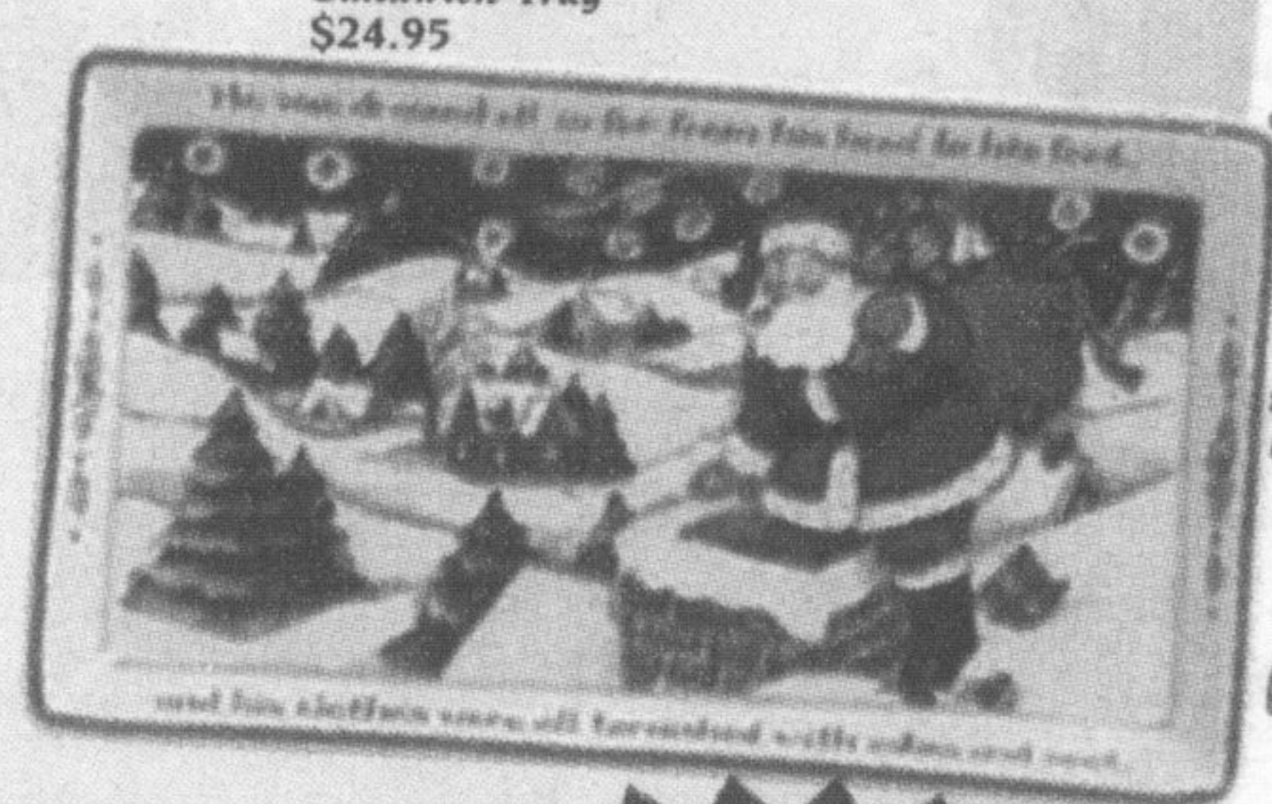
Sandwich Tray $24.95