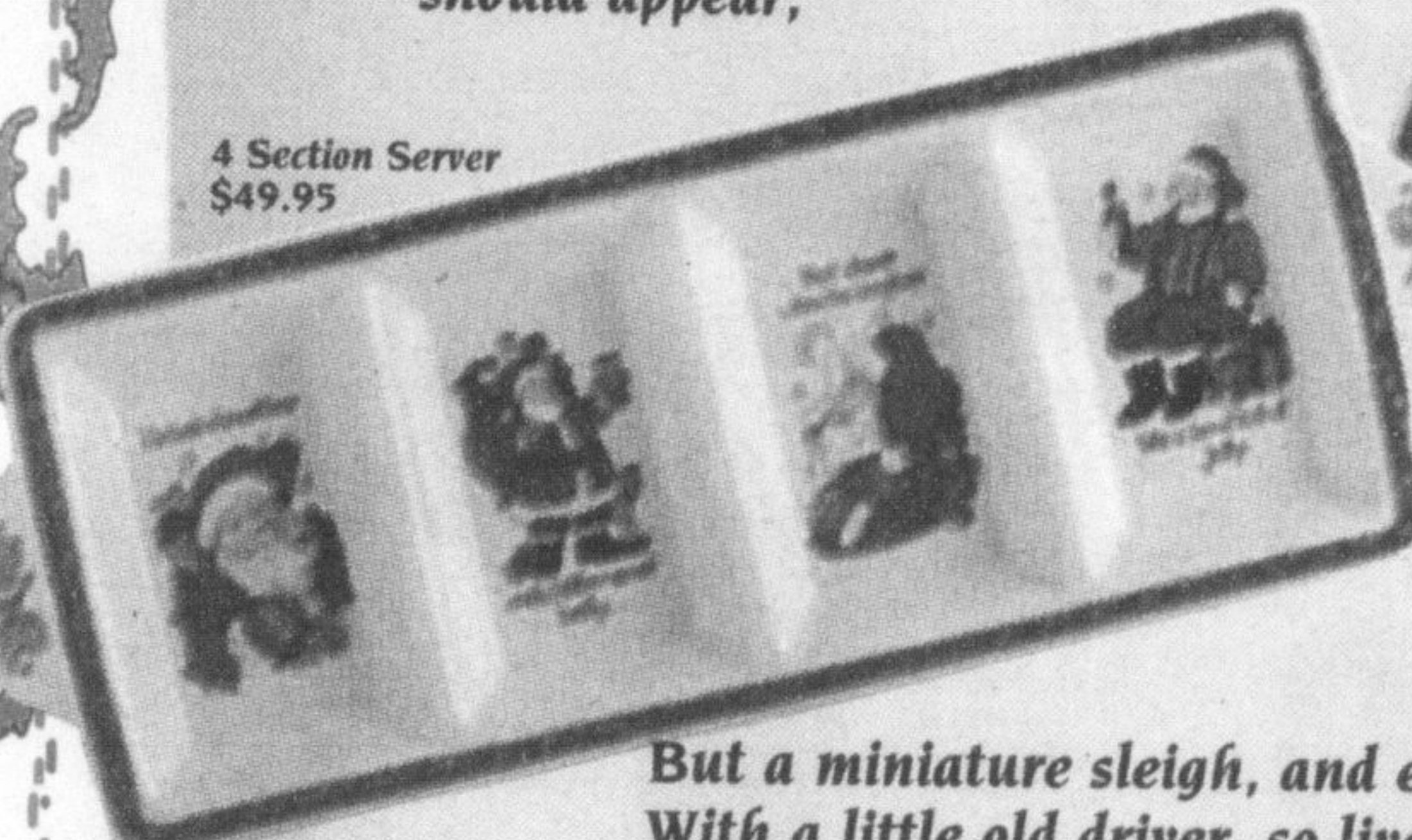
4 Section Server $49.95