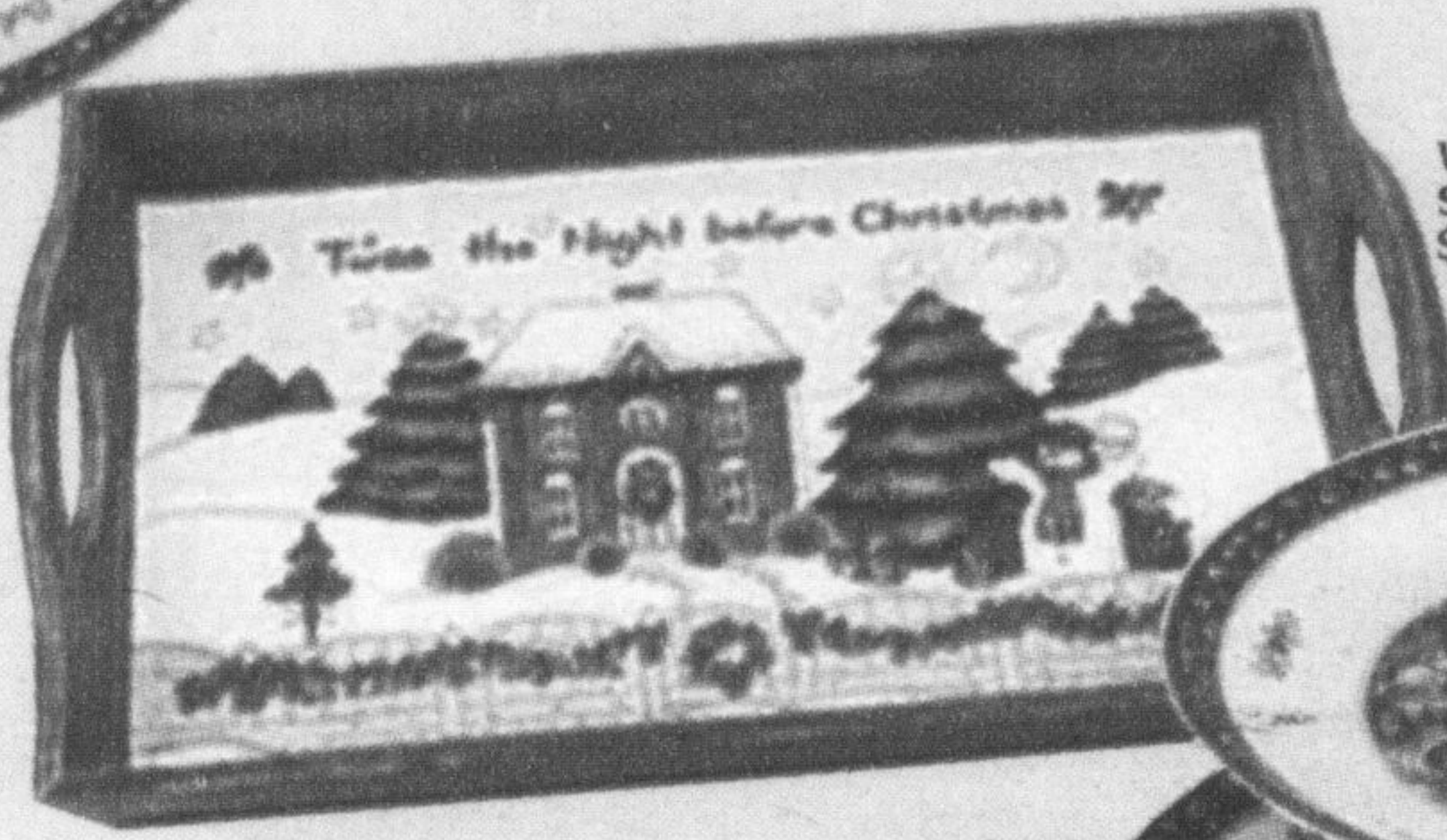
Wood Serving Tray $29.95

A bundle of toys he had flung on his back, And he looked like a peddler just opening his pack.