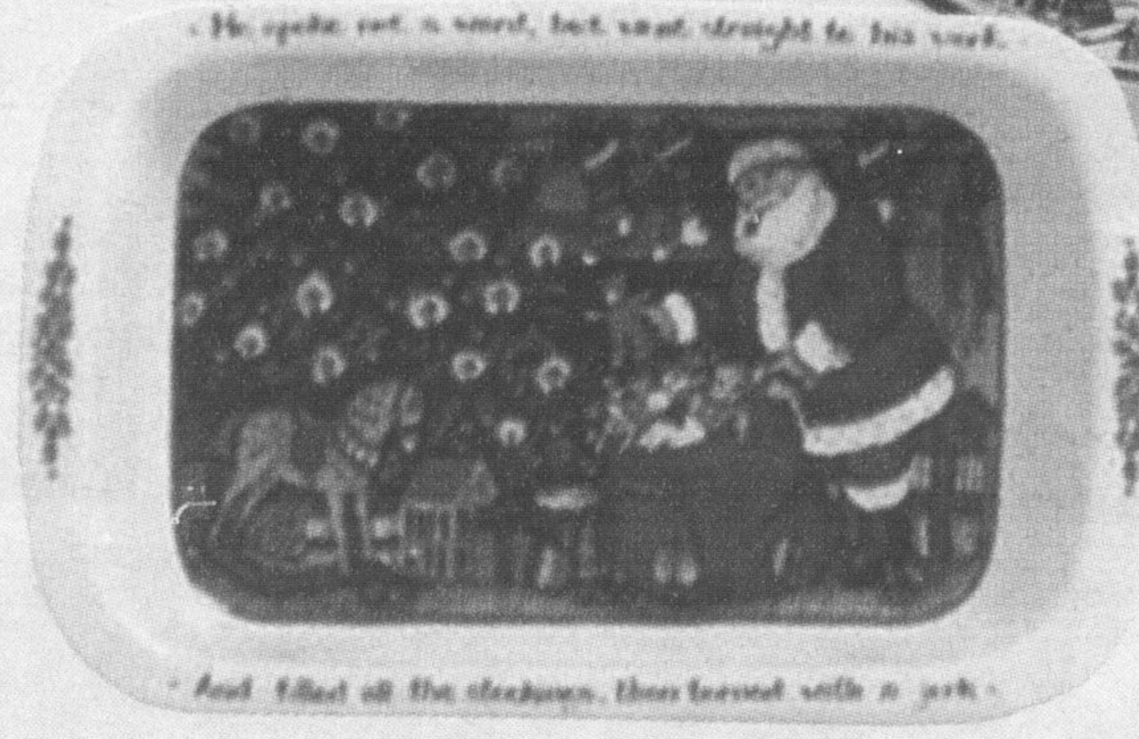
Lasagne Baker $39.95