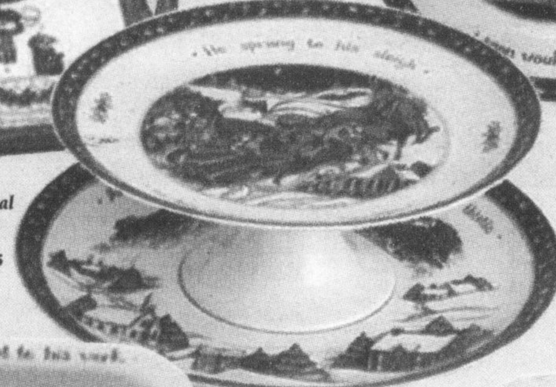
Pedestal Server 2 Tier $59.95