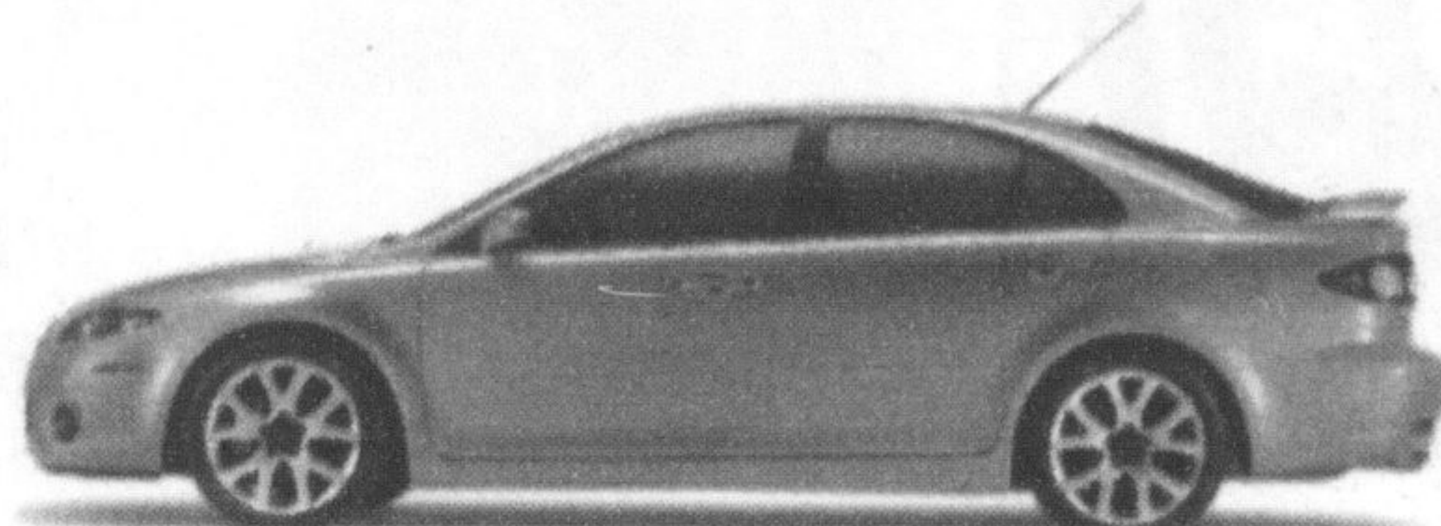
GT-V6 model shown

NO SECURITY DEPOSIT LEASE PAYMENT INCLUDES FREIGHT AND P.D.E.