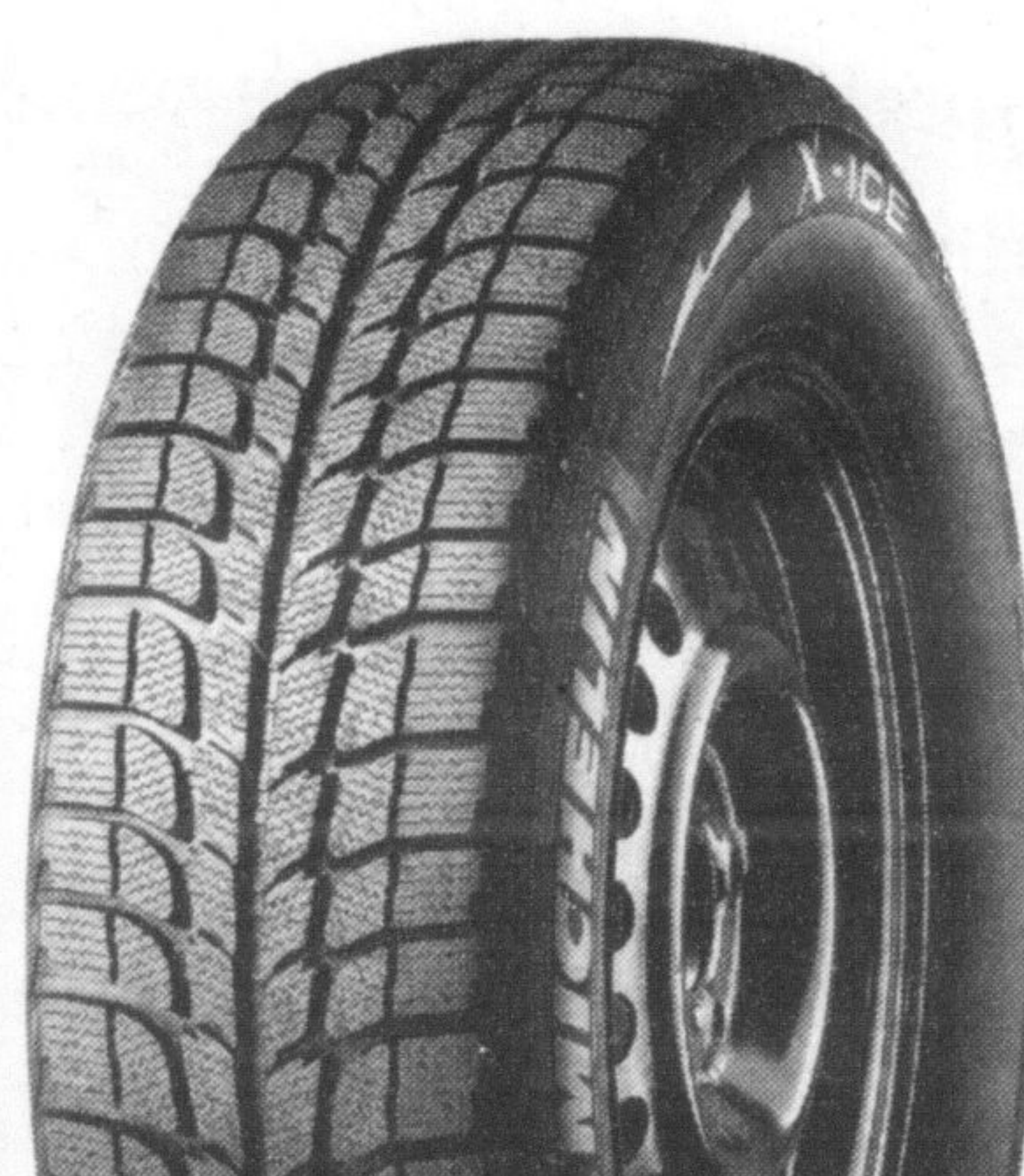
Michelin® X-Ice™ P195/70R14

Installation, balancing, valve stems and lifetime inspection is included in the price of your tires, and our GM expertise. We have tires for all your driving needs.