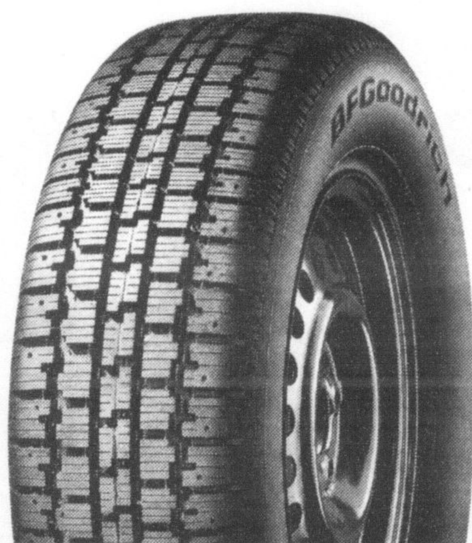
BFGoodrich® Winter Slalom® P195/70R14