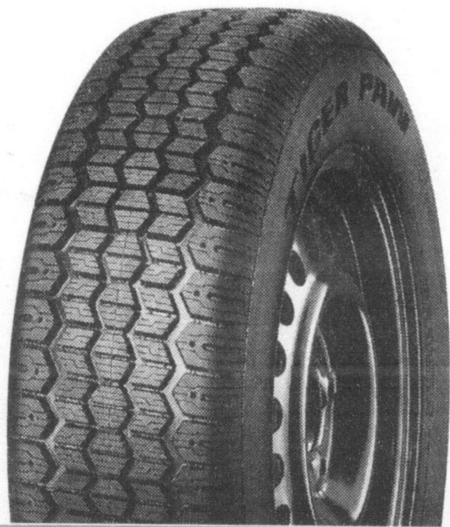
Uniroyal® Ice & Snow™ P195/70R14