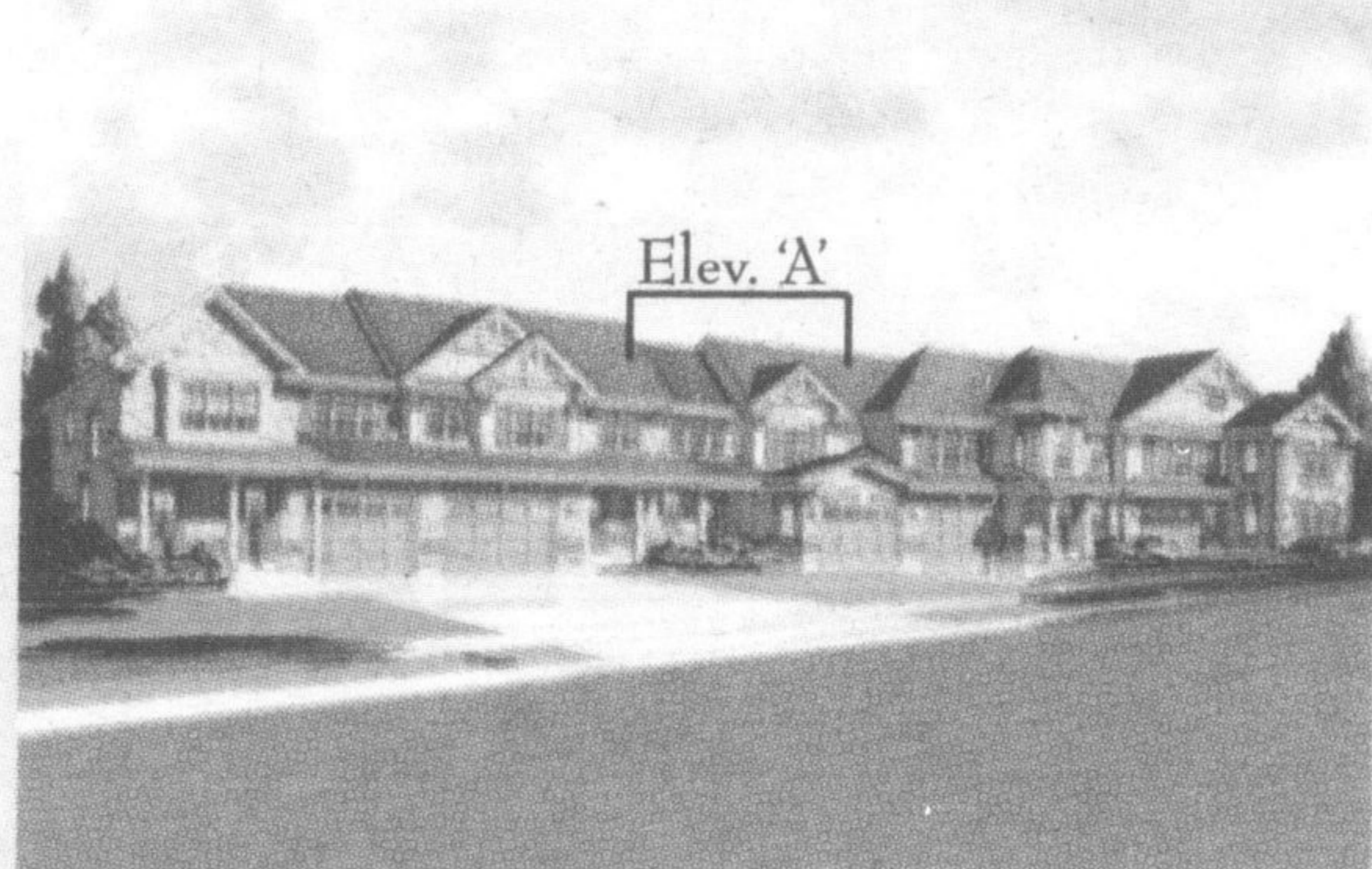
WideLot™ Townhome, The Amesbury 'A', 1,130 Sq.Ft., $220,990