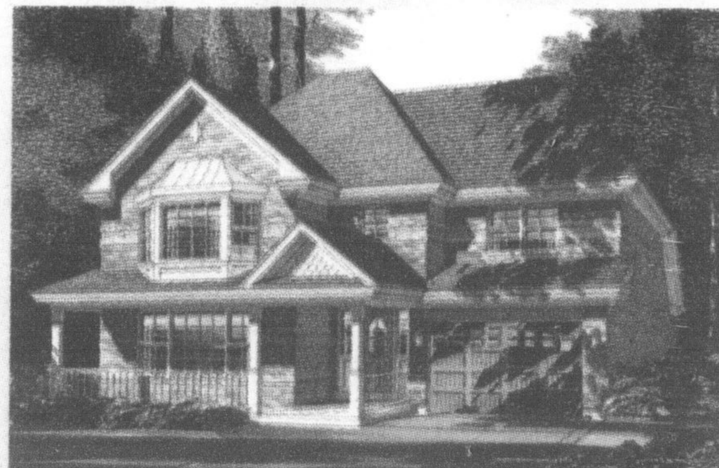
36' WideLot™, The Shady Glen II 'D', 1,811 Sq.Ft., $321,990