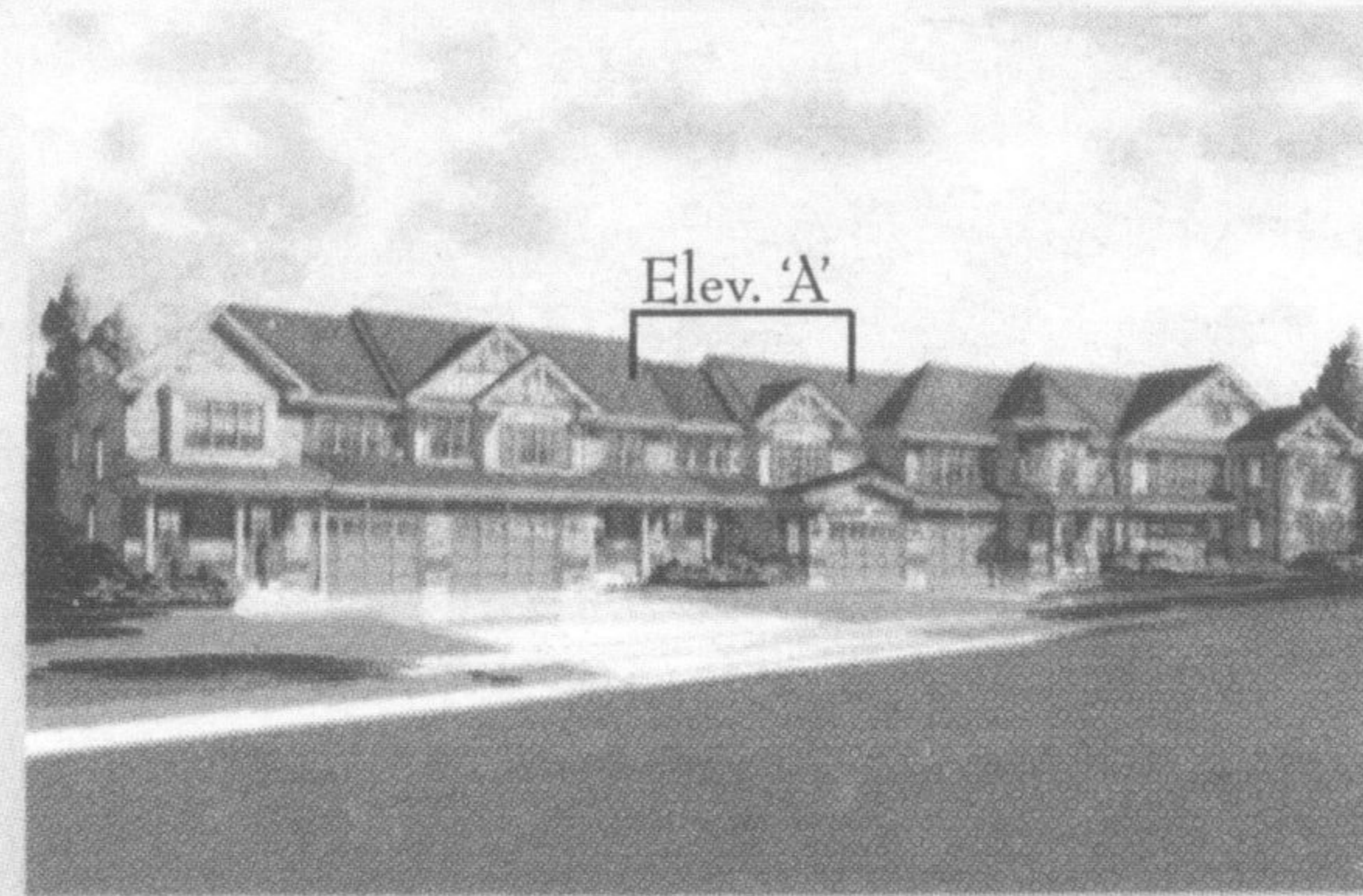
WideLot™ Townhome, The Amesbury 'A', 1,130 Sq.Ft., $220,990