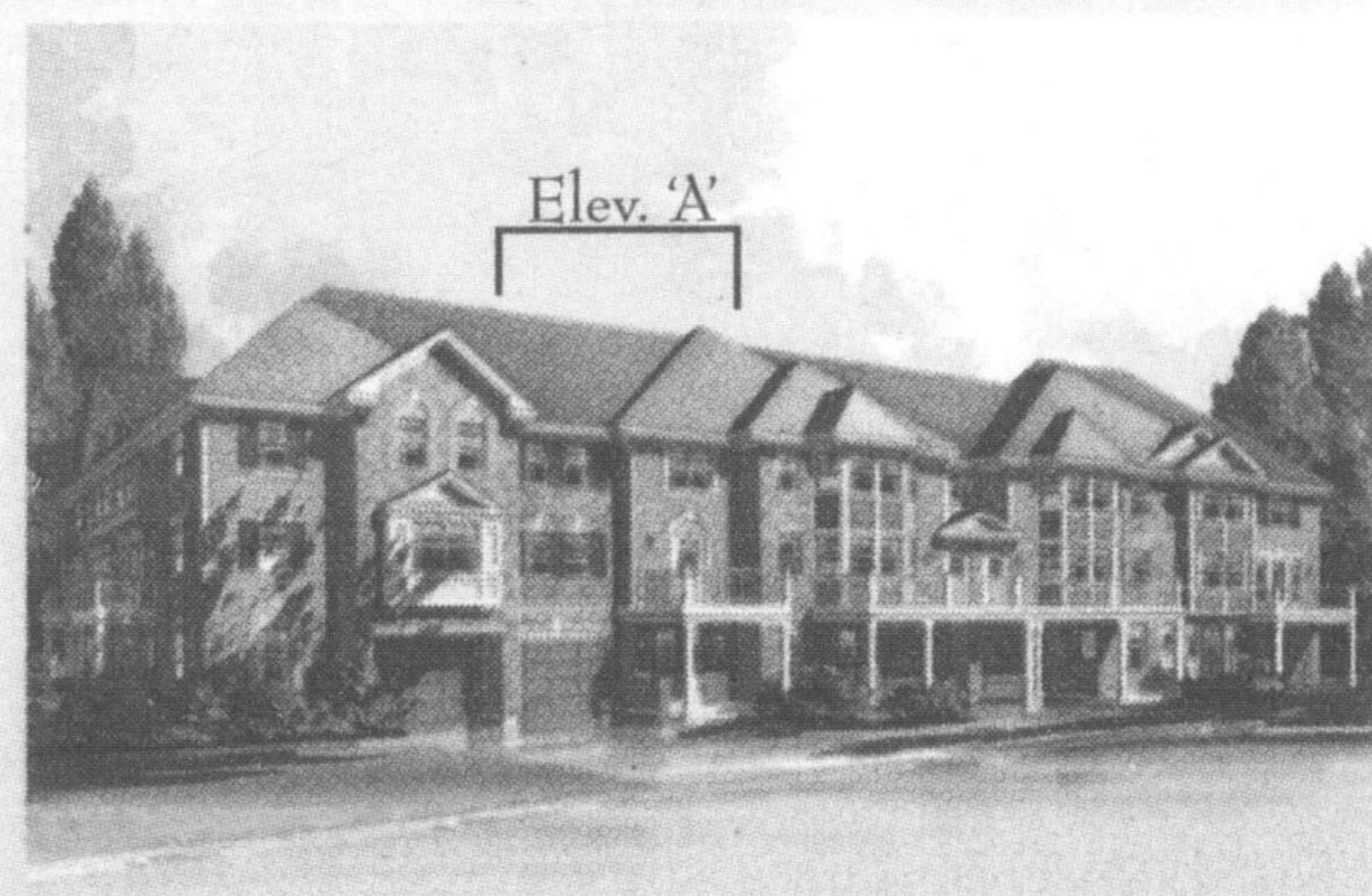
Village Home, The Ashfield 'A', 1,051 Sq.Ft., $193,990