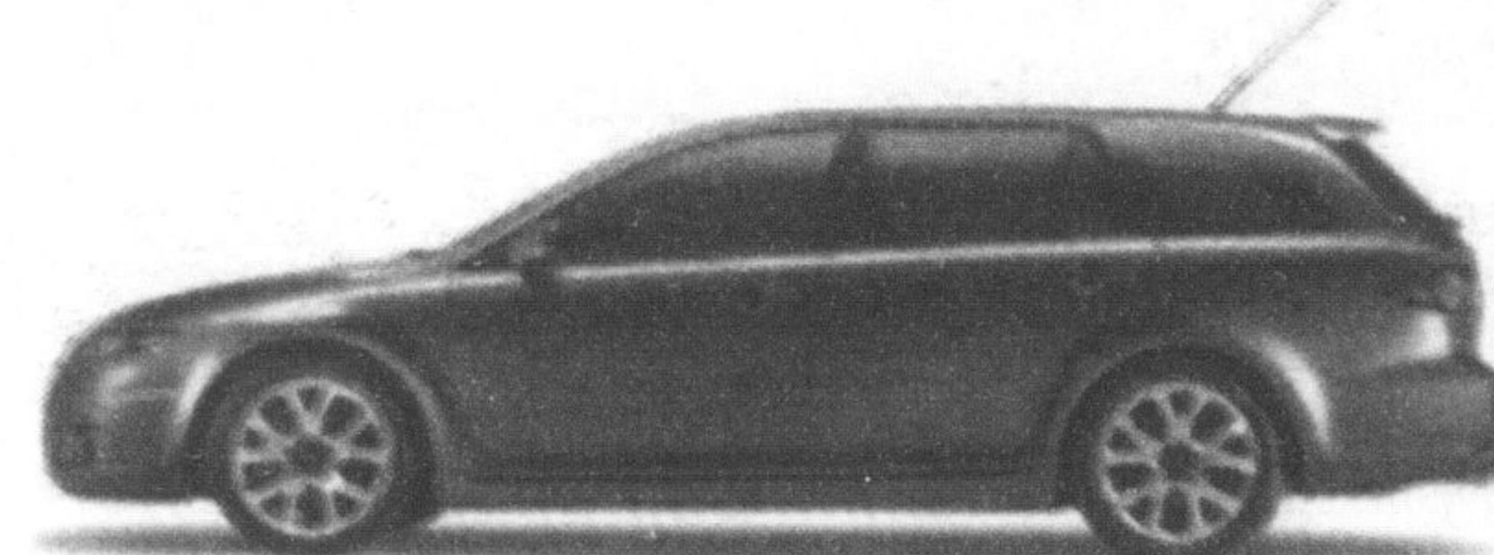
GT-V6 with Performance package model shown

LEASE FROM $299* - AT - 2.9% LEASE APR - OR - 3.9% PER MONTH/48 MONTHS WITH $3,095 DOWN PAYMENT NO SECURITY DEPOSIT LEASE PAYMENT INCLUDES FREIGHT AND P.D.E.