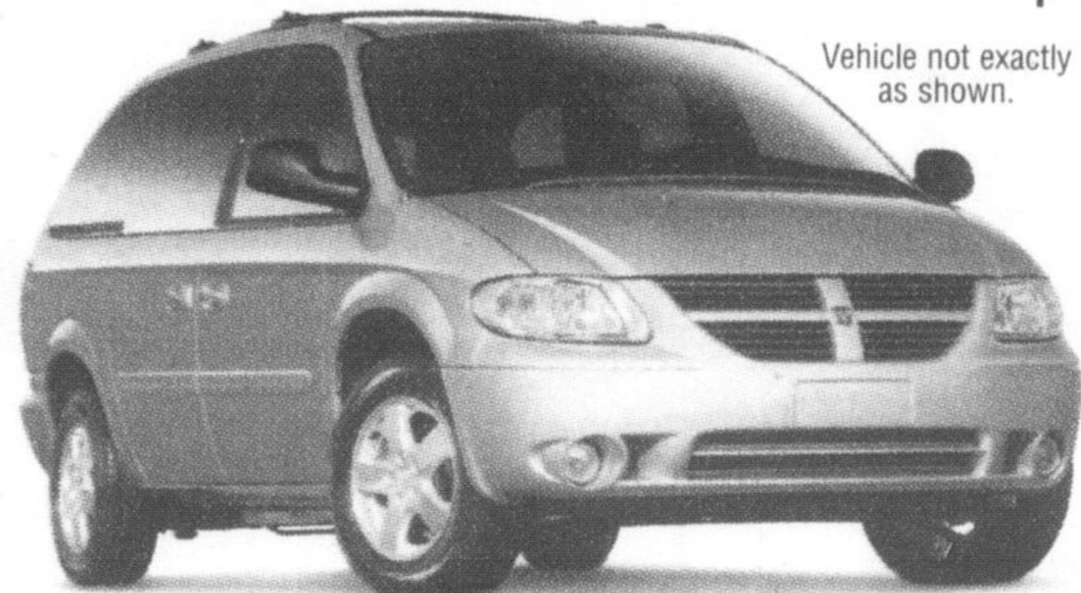
Vehicle not exactly as shown.

Stk # TG07 PAYMENT $399 † 48 MTH TERM A.P.R. 1.6% TOTAL DOWN $2,900