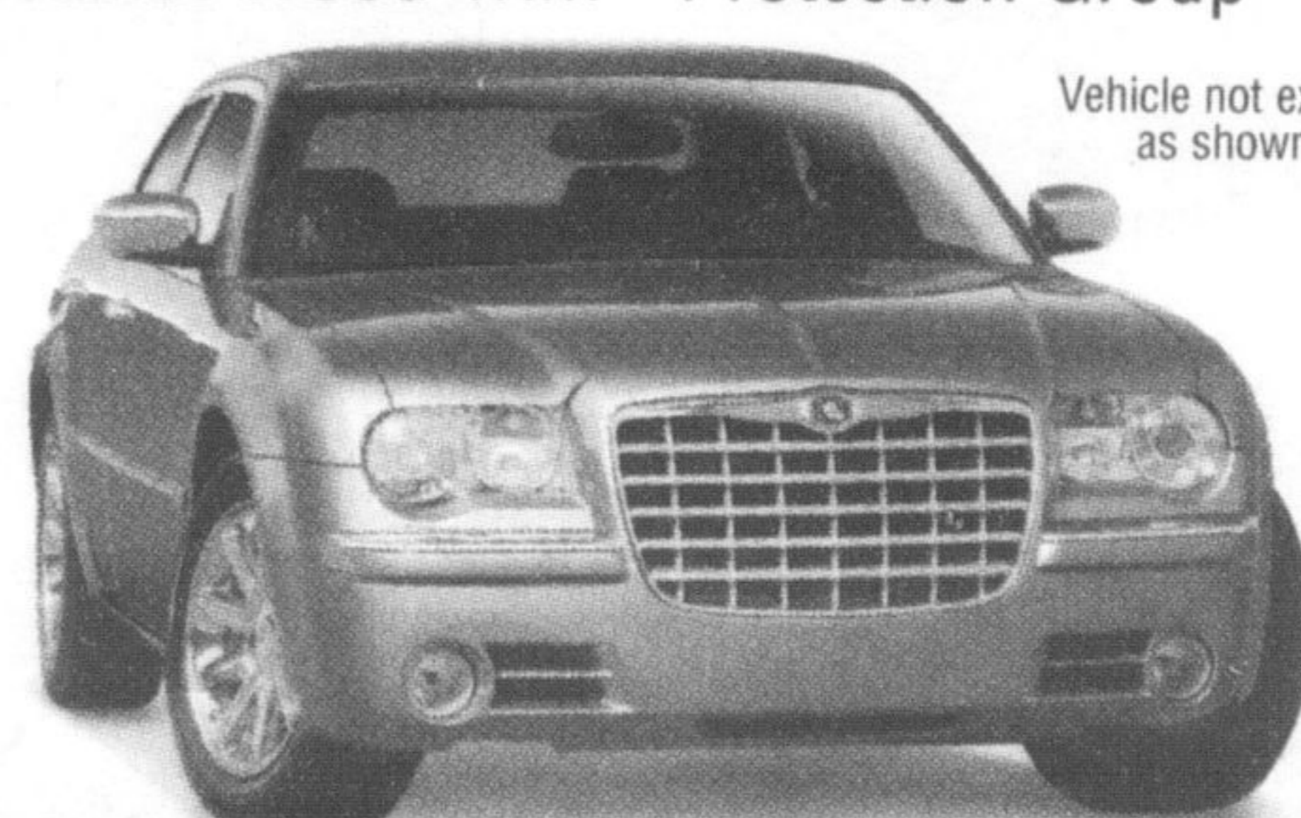
Vehicle not exactly as shown.

Stk # TL10 PAYMENT $662 † 48 MTH TERM A.P.R. 2.5% TOTAL DOWN $790 NO HIDDEN FEES