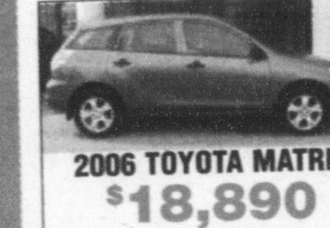
2006 TOYOTA MATRIX $18,890