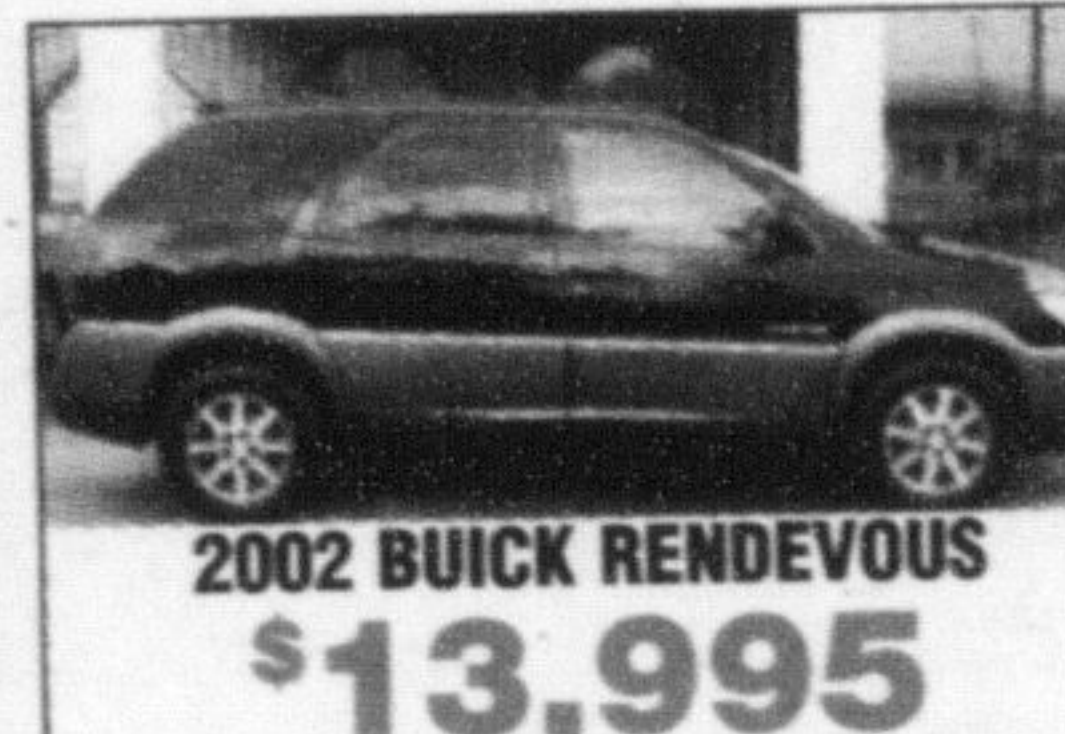
2002 BUICK RENDEZVOUS $13,995

COMING SOON! 2007 CHEV AVALANCE LT 4X4 ONLY 200 KM!! LEATHER, HEATED SEATS & MUCH MORE!