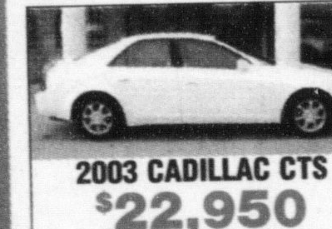
2003 CADILLAC CTS $22,950