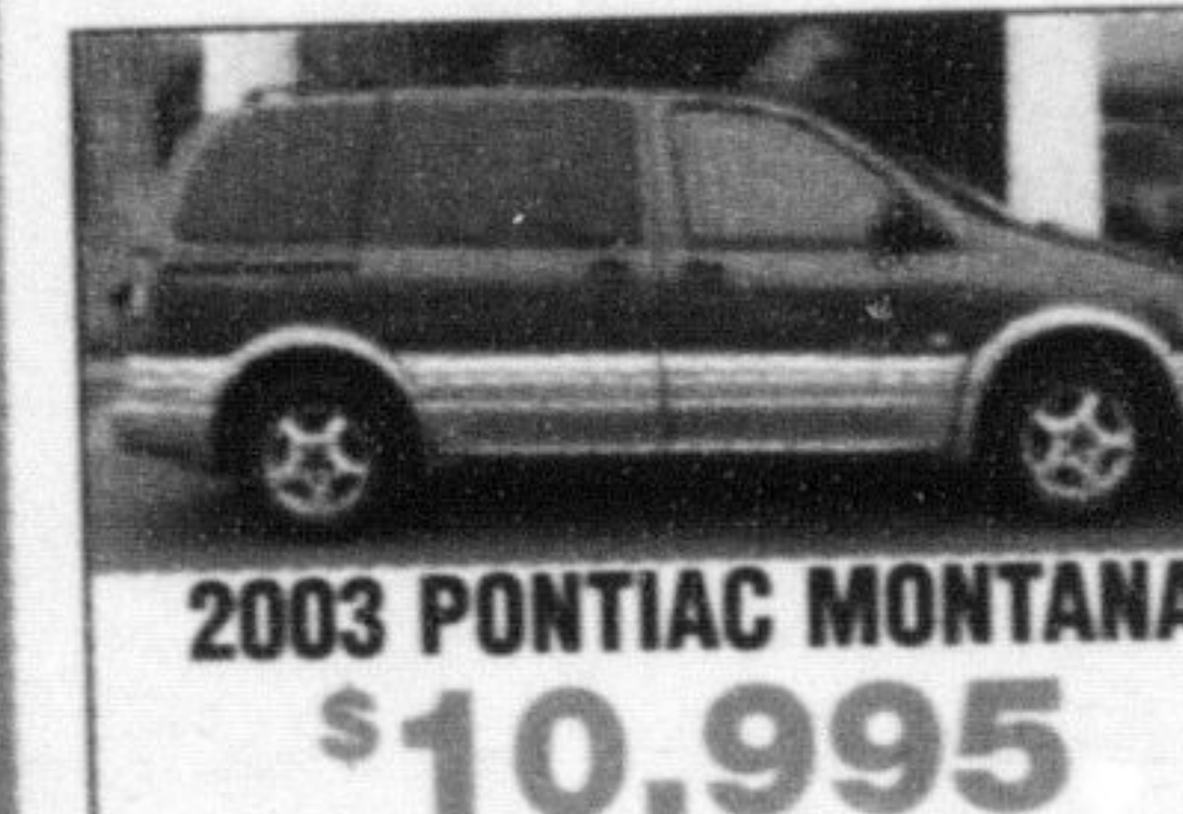
2003 PONTIAC MONTANA $10,995