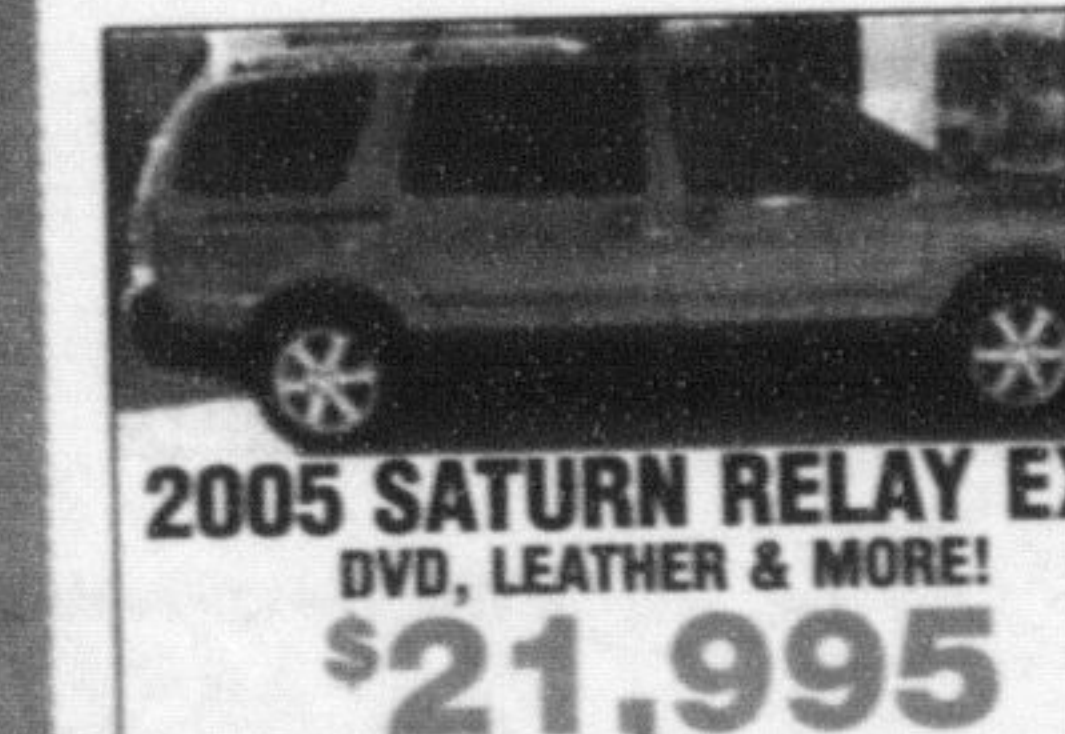
2005 SATURN RELAY EXT. DVD, LEATHER & MORE! $21,995