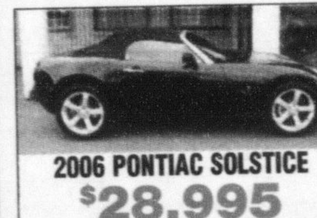
2006 PONTIAC SOLSTICE $28,995