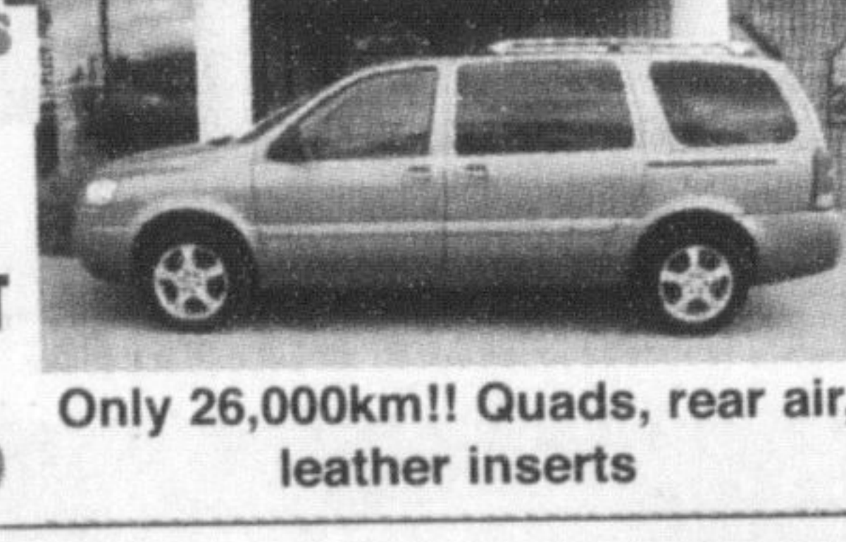
Only 26,000km!! Quads, rear air, leather inserts

THIS WEEK'S SPECIAL! 2006 CHEVROLET UPLANDER LT EXTENDED $19,990