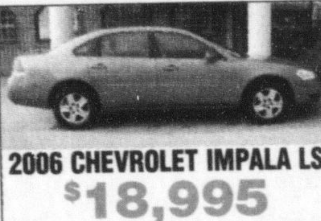
2006 CHEVROLET IMPALA LS $18,995

COMING SOON! 2007 CHEV AVALANCE LT 4X4 ONLY 200 KM!! LEATHER, HEATED SEATS & MUCH MORE!