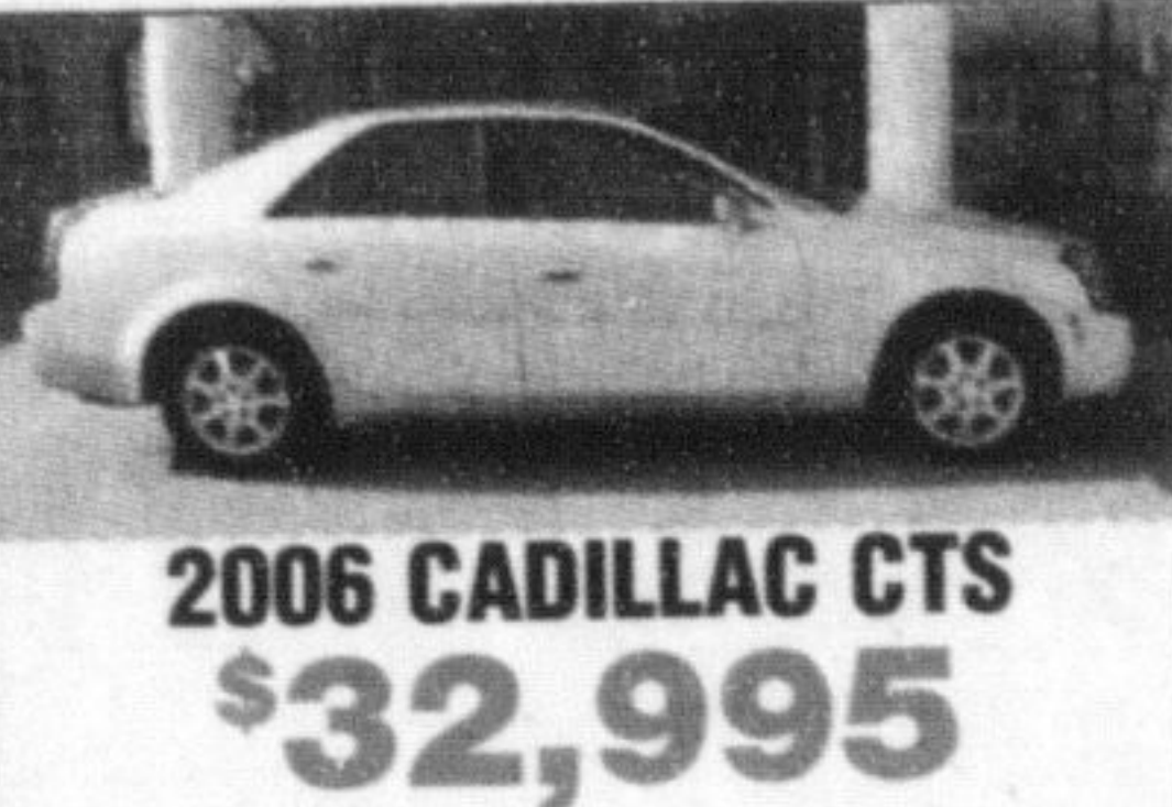
2006 CADILLAC CTS $32,995