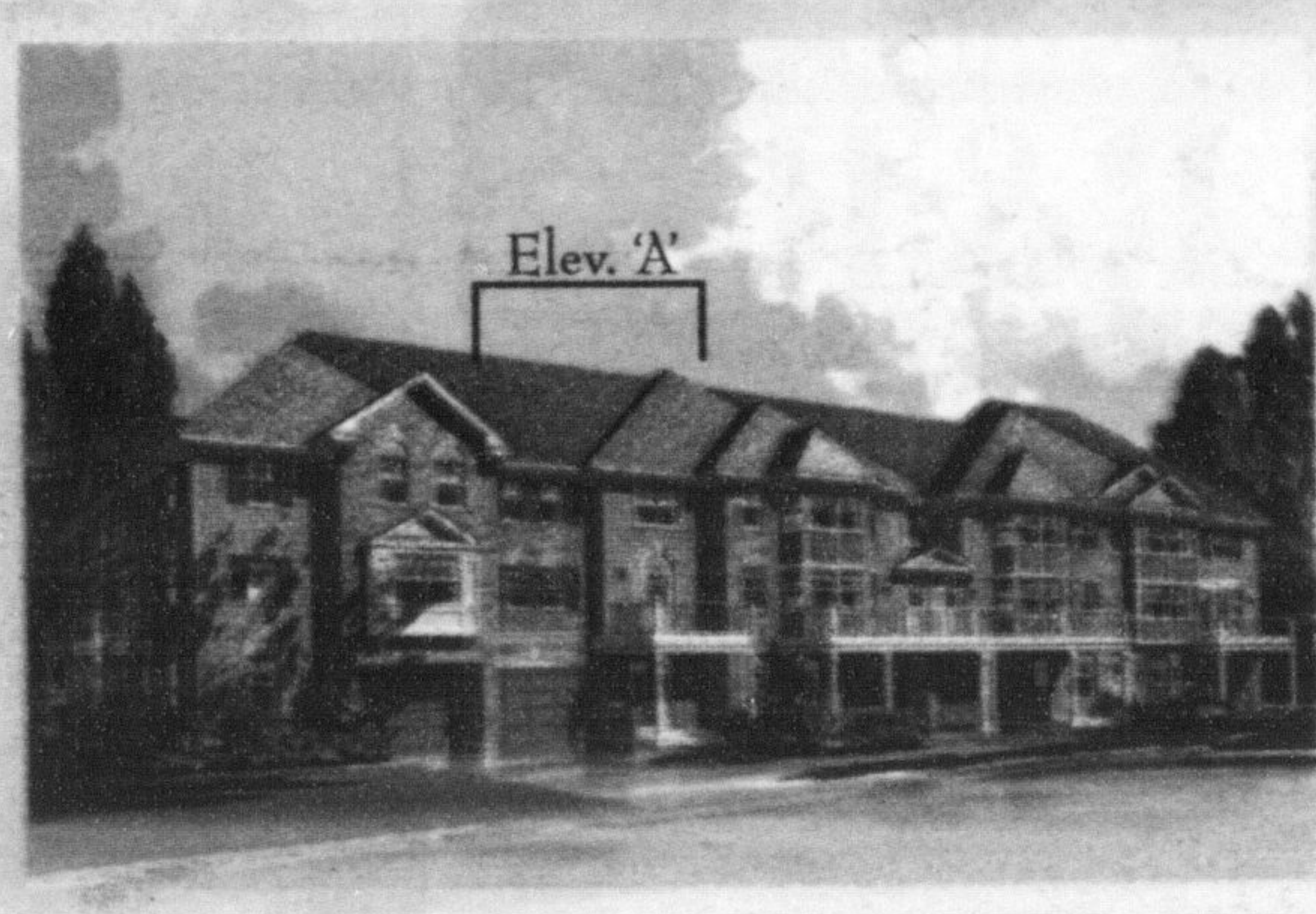
Village Home, The Ashfield 'A', 1,051 Sq.Ft., $193,990