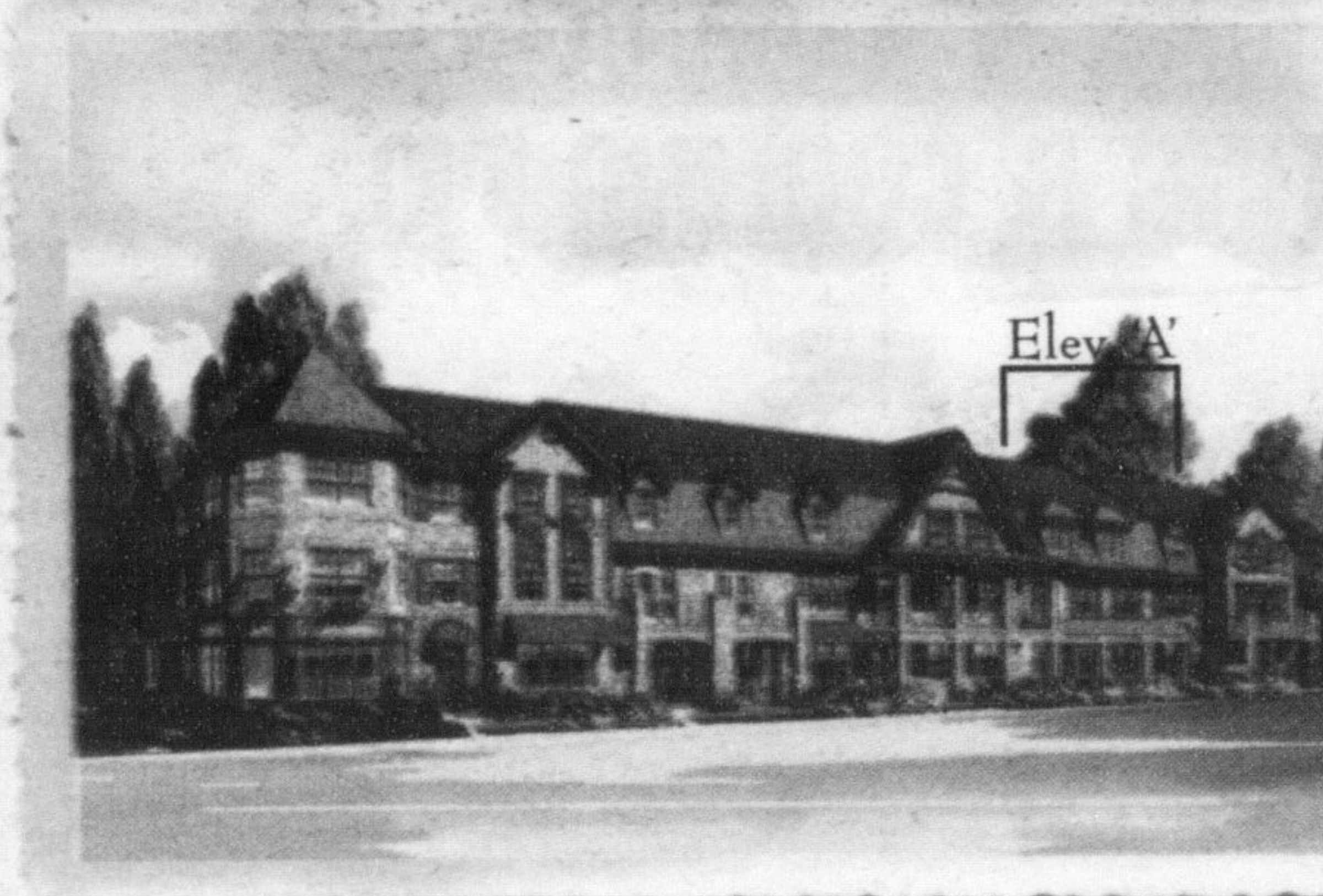
Main Street Townhome, The Ashberry 'A', 1,585 Sq.Ft., $247,990