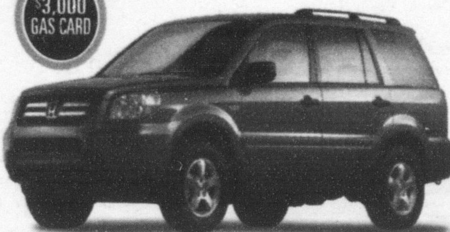
Pilot LX, model YF1816E