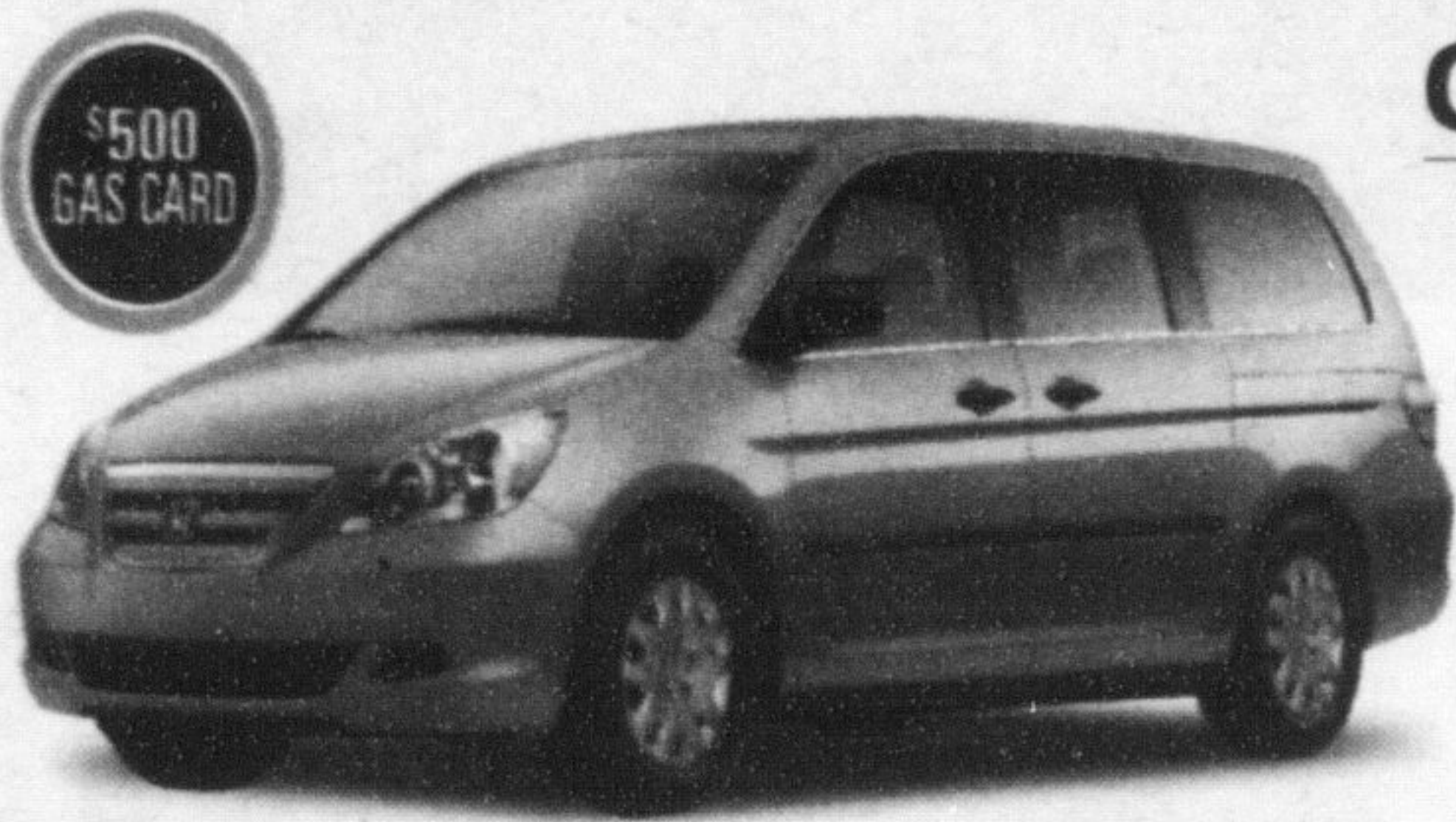
Odyssey LX, model RL3626E

Purchase or lease this week & you could win your Honda