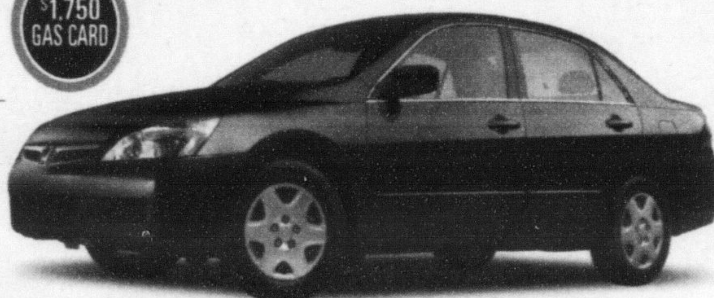
Accord Sedan DX-G, model CM5516E

PURCHASE FINANCING FROM 1.9% ON APPROVED O.A.C.