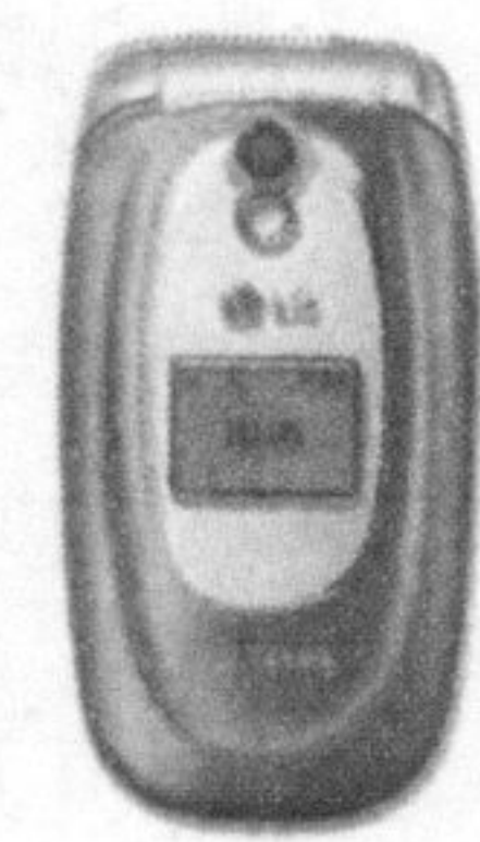
LG 200 Camera phone