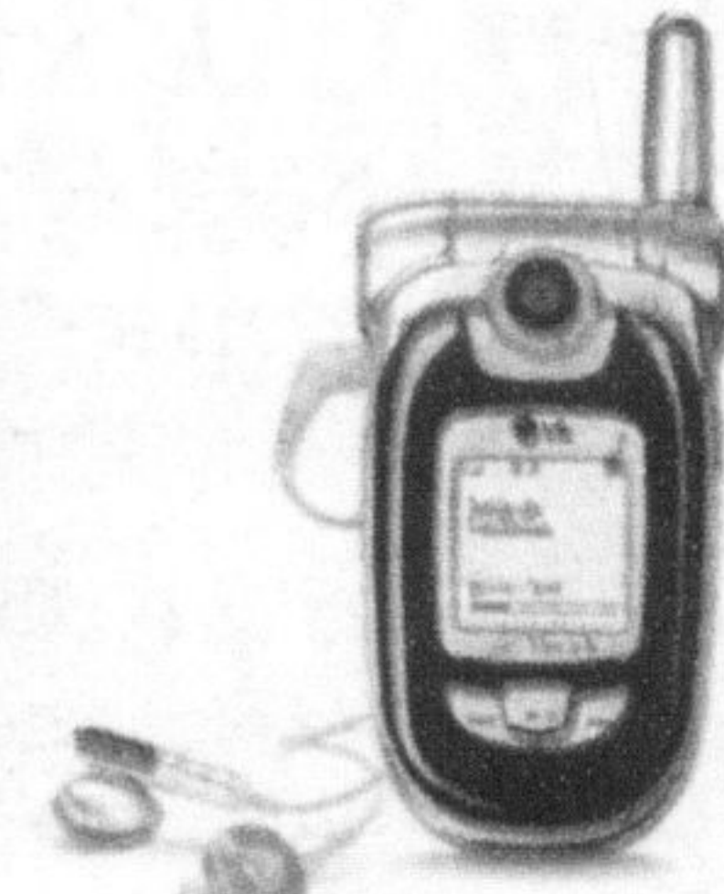
LG 8100 Music/TV Camera/Video phone