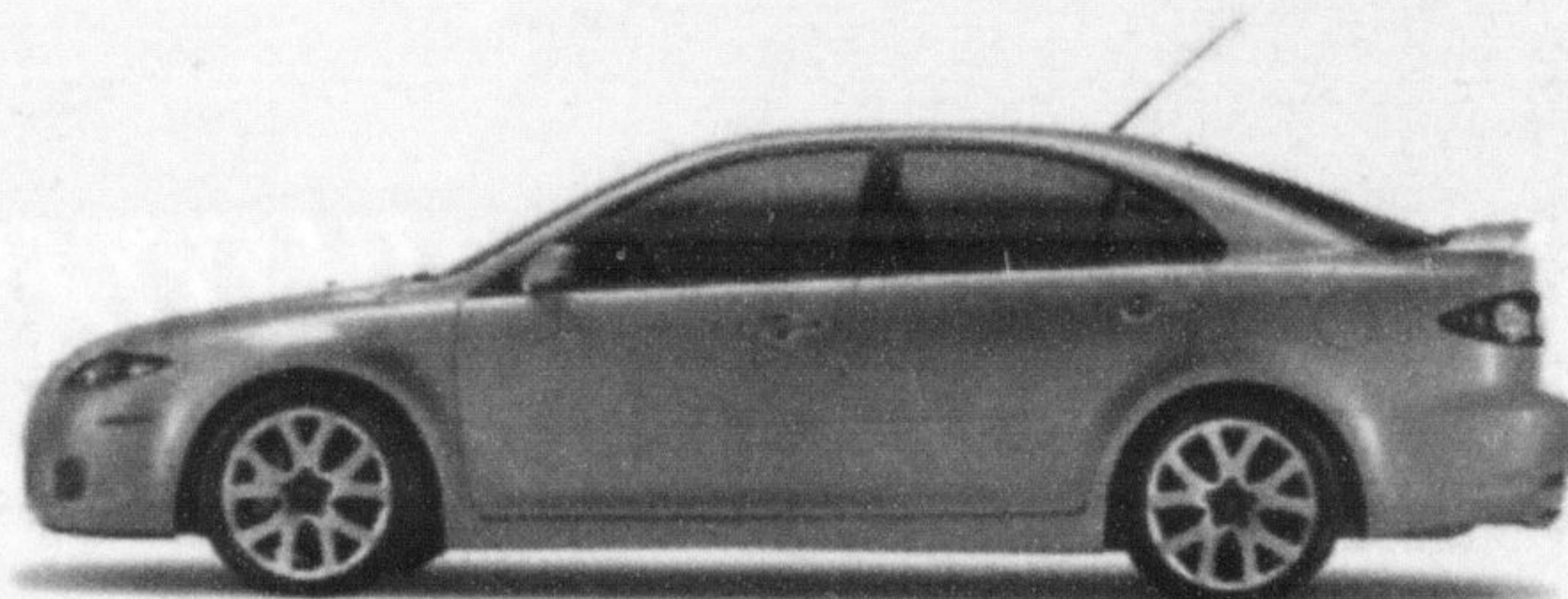
GT-V6 model shown

LEASE FROM $279* - AT - 1.9% LEASE APR PER MONTH/48 MONTHS WITH $2,695 DOWN PAYMENT NO SECURITY DEPOSIT LEASE PAYMENT INCLUDES FREIGHT AND P.D.E.