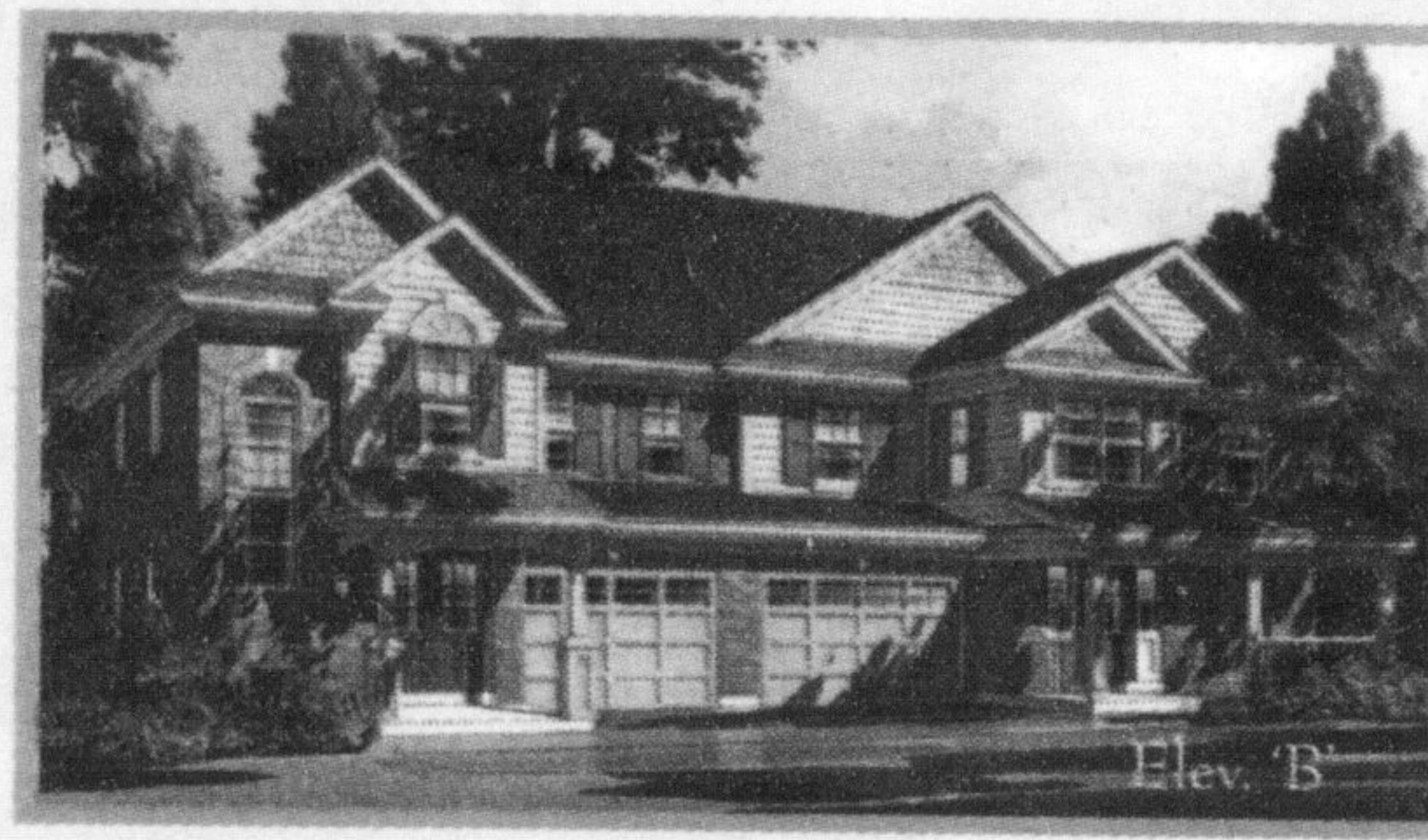
WideLot™ Semi, The Milmont 'B', 1,835 Sq.Ft., $281,400

Detached WideLot™ 36' and 56' homes as well as Village Homes, WideLot™ Townhomes and WideLot™ Semis. These home designs meet the needs of people looking for modern living in an established community. Visit us this weekend and find out why more than 5,000 families proudly call Hawthorne Village home. One walk through the friendly streets will convince you that this is a special place to live.