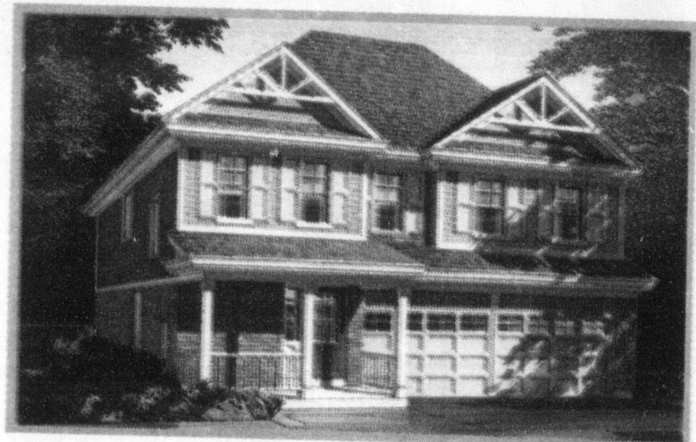
36' WideLot™, The Newport 'A', 1,774 Sq.Ft., $320,990