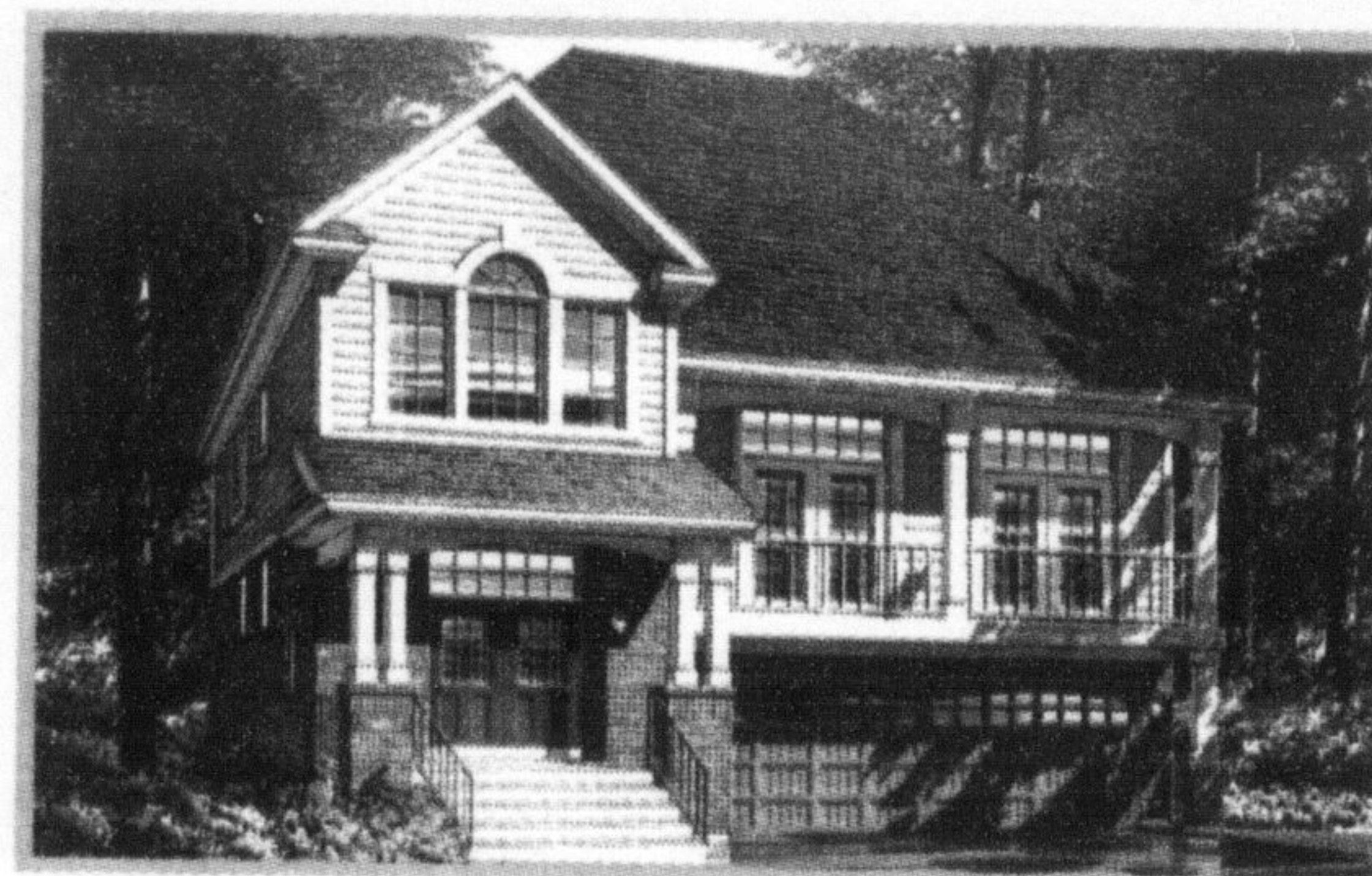
36' WideLot™, The Wintergrove 'A', 2,318 Sq.Ft., $356,990