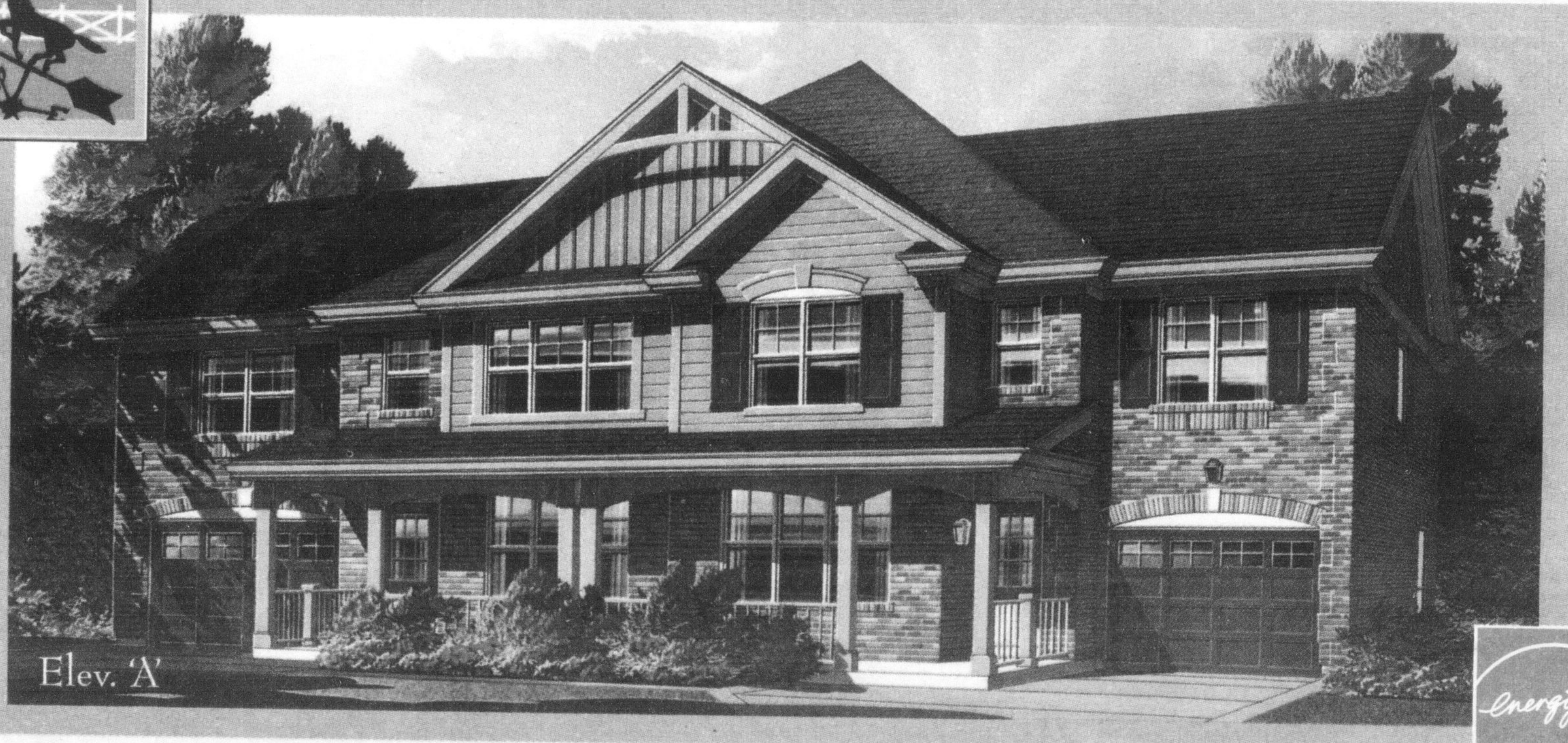
WideLot™ Semi, The Rosewood 'A', 1,864 Sq.Ft., $283,990