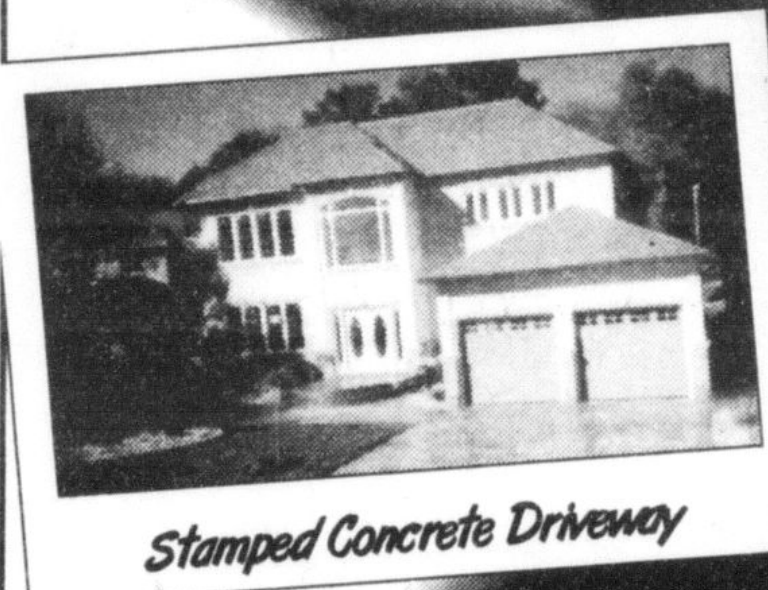
Stamped Concrete Driveway