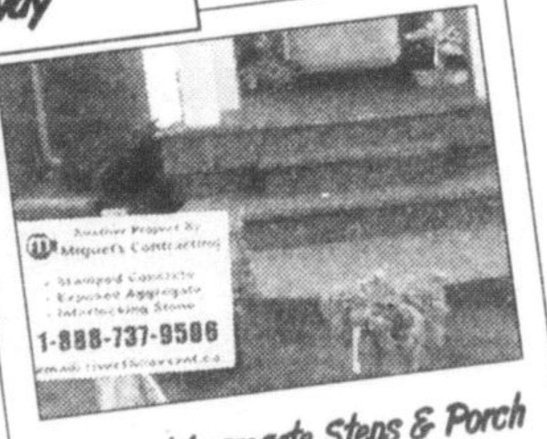
Exposed Aggregate Steps & Porch

We Specialize In... • Exposed Aggregate* • Stamped Concrete* • Interlocking • Jewelstone *32 Colours Available