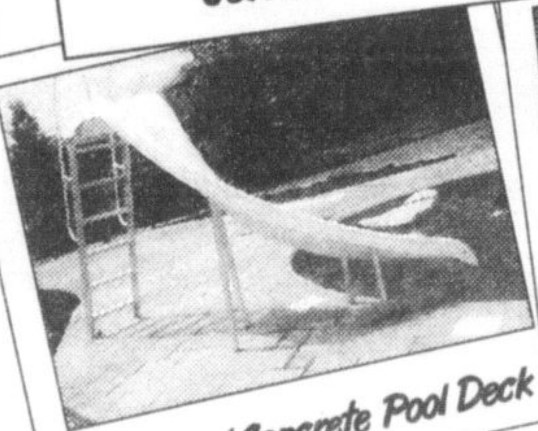
Stamped Concrete Pool Deck