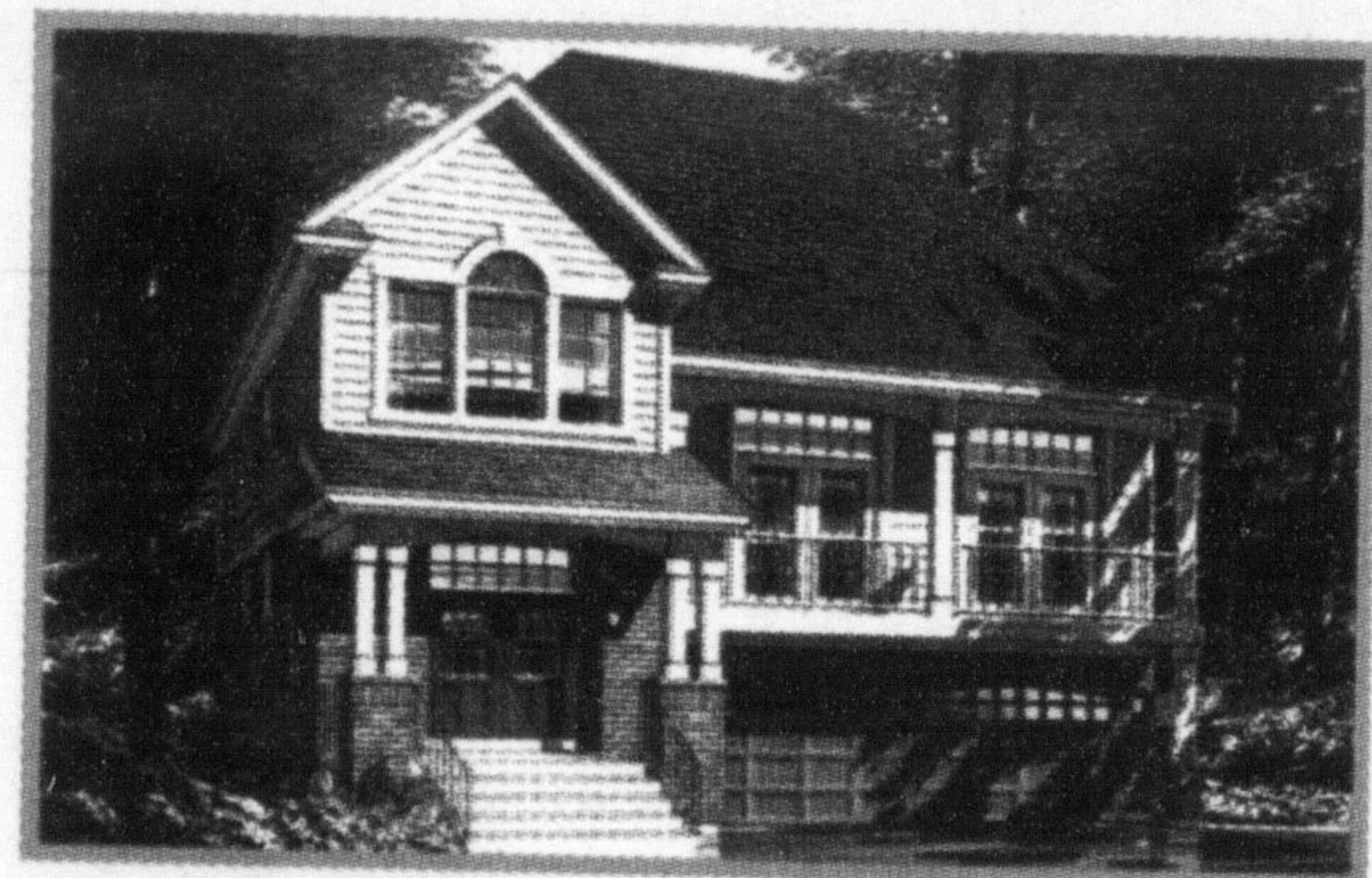
36' WideLot™, The Wintergrove 'A', 2,318 Sq.Ft., $356,990