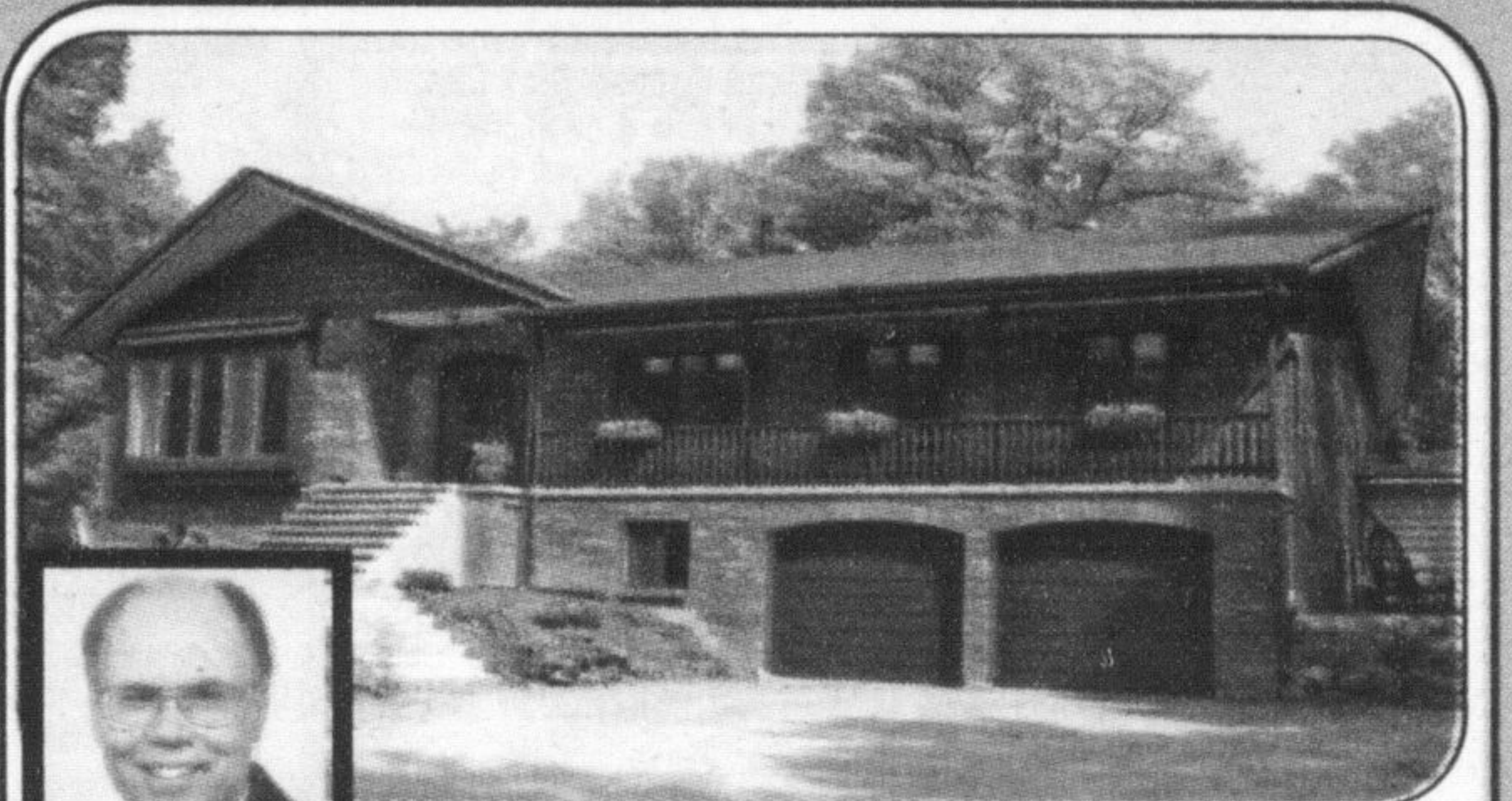
5 ACRE COUNTRY RETREAT

A gorgeous country lot adorned with mature trees and surrounded by blissful farms & woodlands. The upgraded & well kept 3 bedroom bungalow affords 4 walkouts, lovely decks, newer windows & doors plus upgraded propane heating. Oversized garage & separate workshop. Lots of extras here. Don't miss your chance to own this beautiful property, located minutes from Georgetown. Contact Carol Wood 905-450-8300.