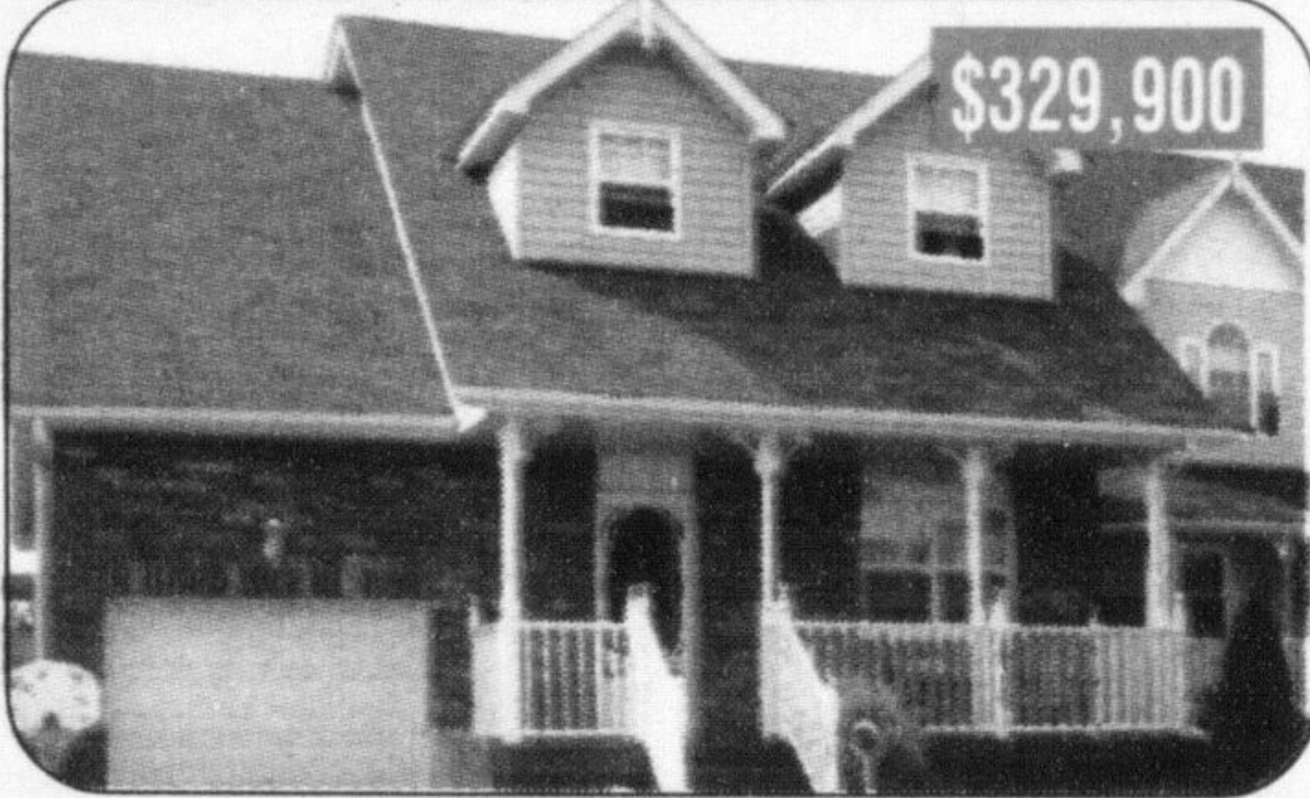
FABULOUS CAPE COD

Lovely 3 bedroom home for your family. Enjoy the large front verandah in this desirable neighbourhood. Ceramic hallway leads to large eat-in country kitchen with walkout to deck, main floor laundry with closet and access to garage. Private fenced yard, with large deck and gravel pad ready for the hot tub. Lots of wiring upgrades including surround sound in fully finished basement with large 4th bedroom or office.