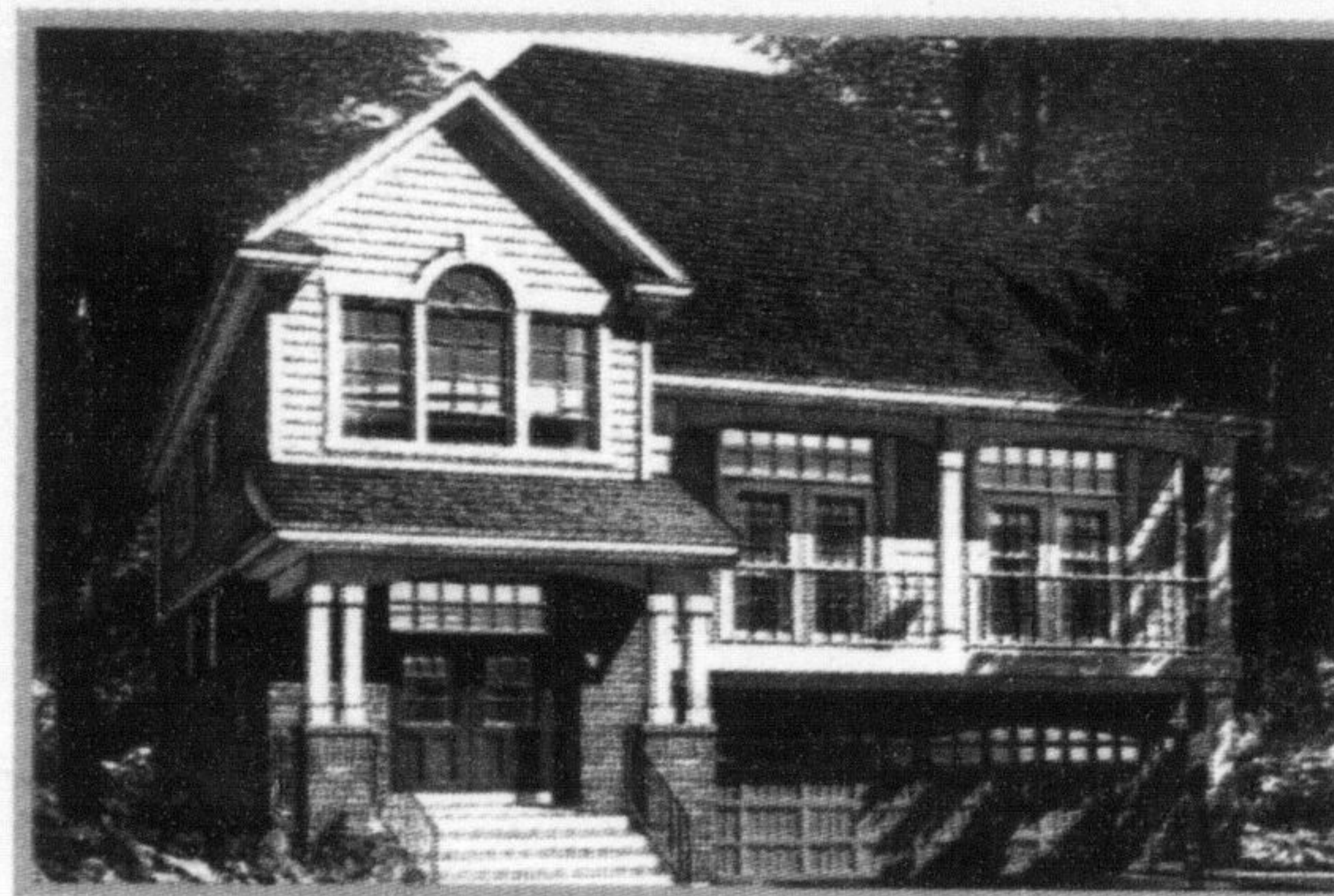
36' WideLot™, The Wintergrove 'A', 2,318 sq.ft., $356,990

Hawthorne Village home. One walk through the friendly streets will convince you that this is a special place to live.