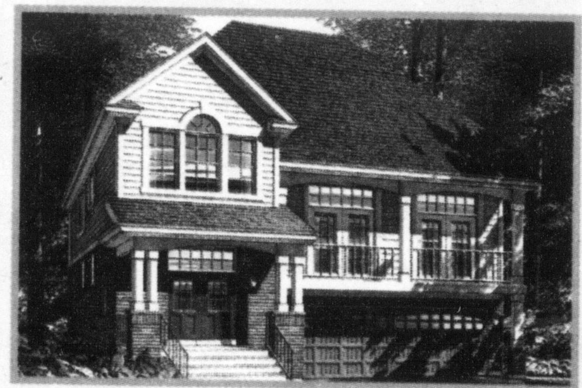
36' WideLot™, The Wintergrove 'A', 2,318 sq.ft., $356,900

Hawthorne Village home. One walk through the friendly streets will convince you that this is a special place to live.