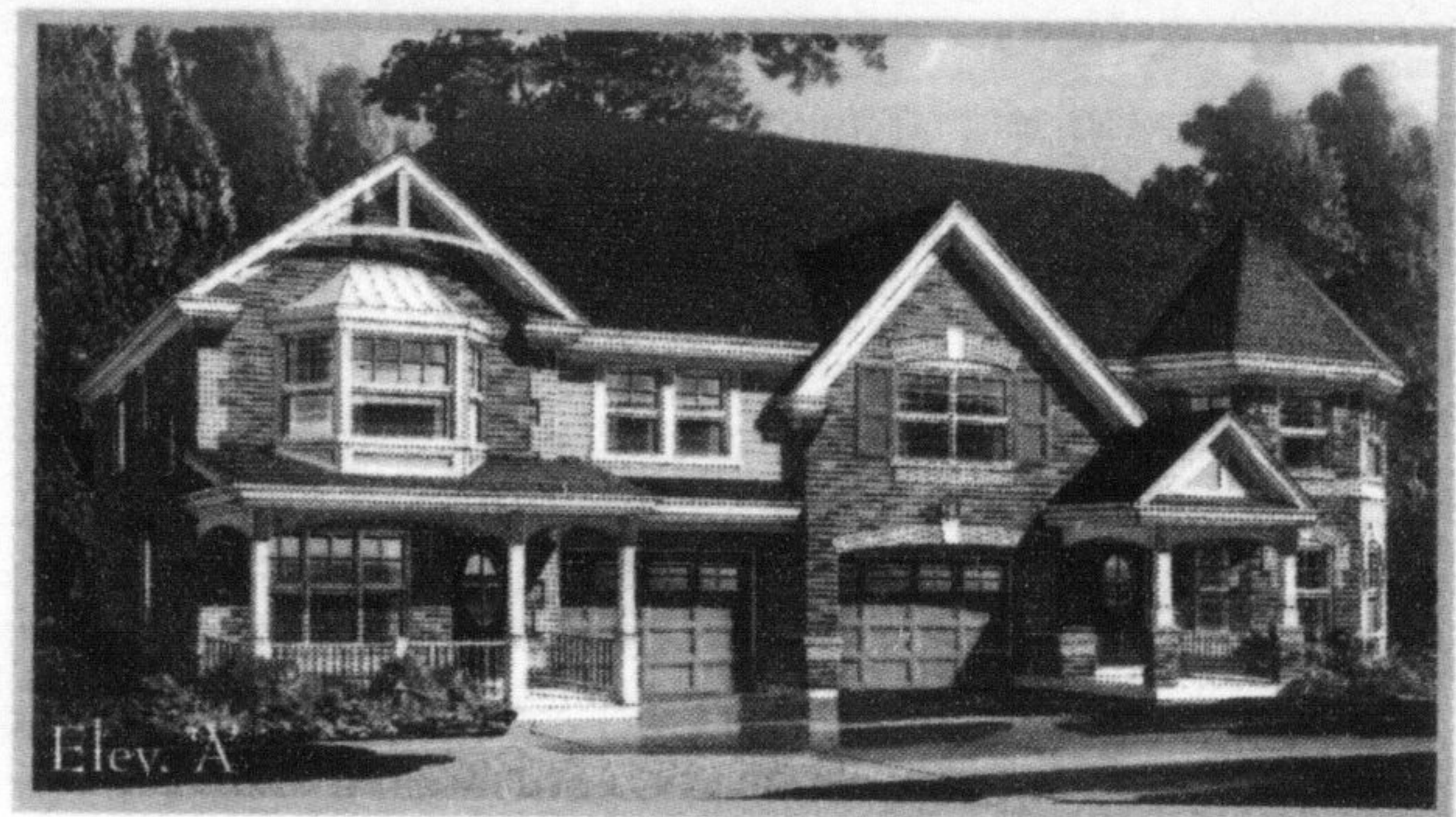
WideLot™ Semi, The Southbury 'A', 1,987 sq.ft., $292,990