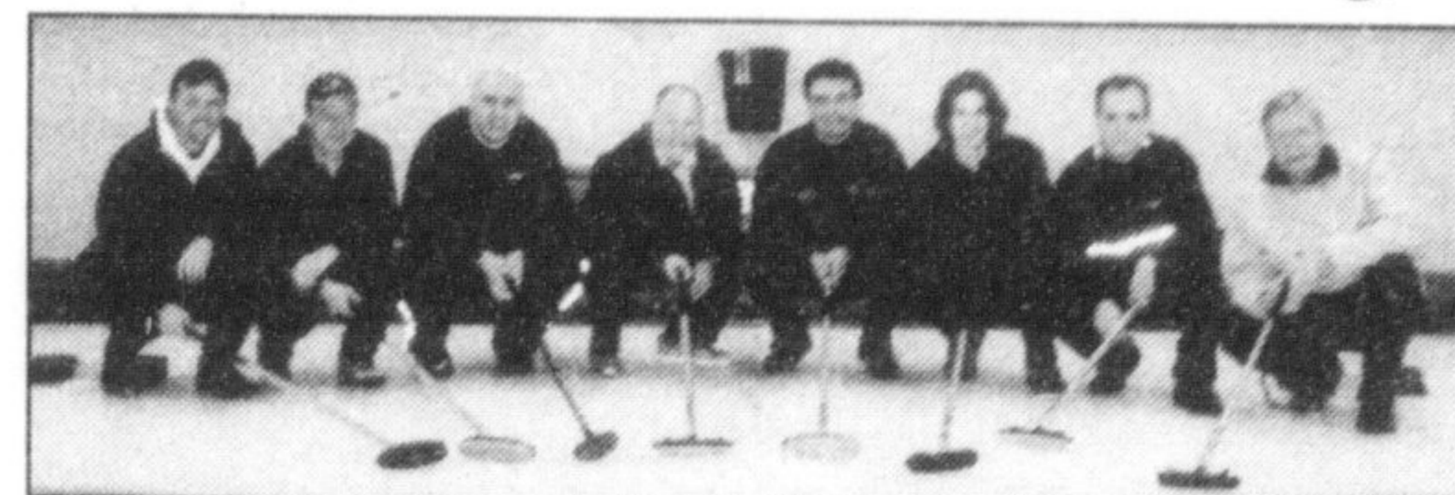
Milton Curling Club's Tankard championship squad.