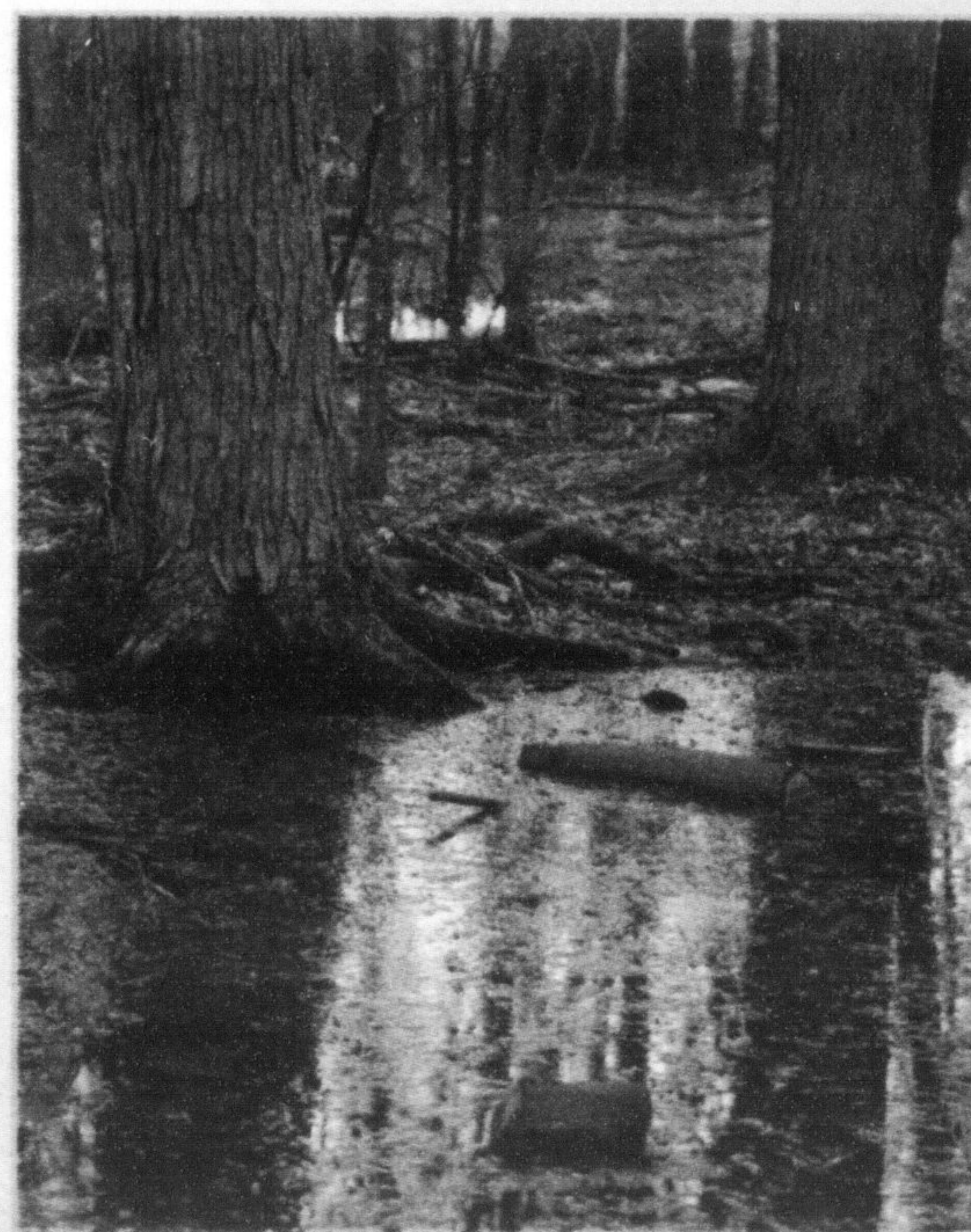
WOODLOT @ MILLPOND

Grant Sewell of Milton Earth Day Photo Contest Winner